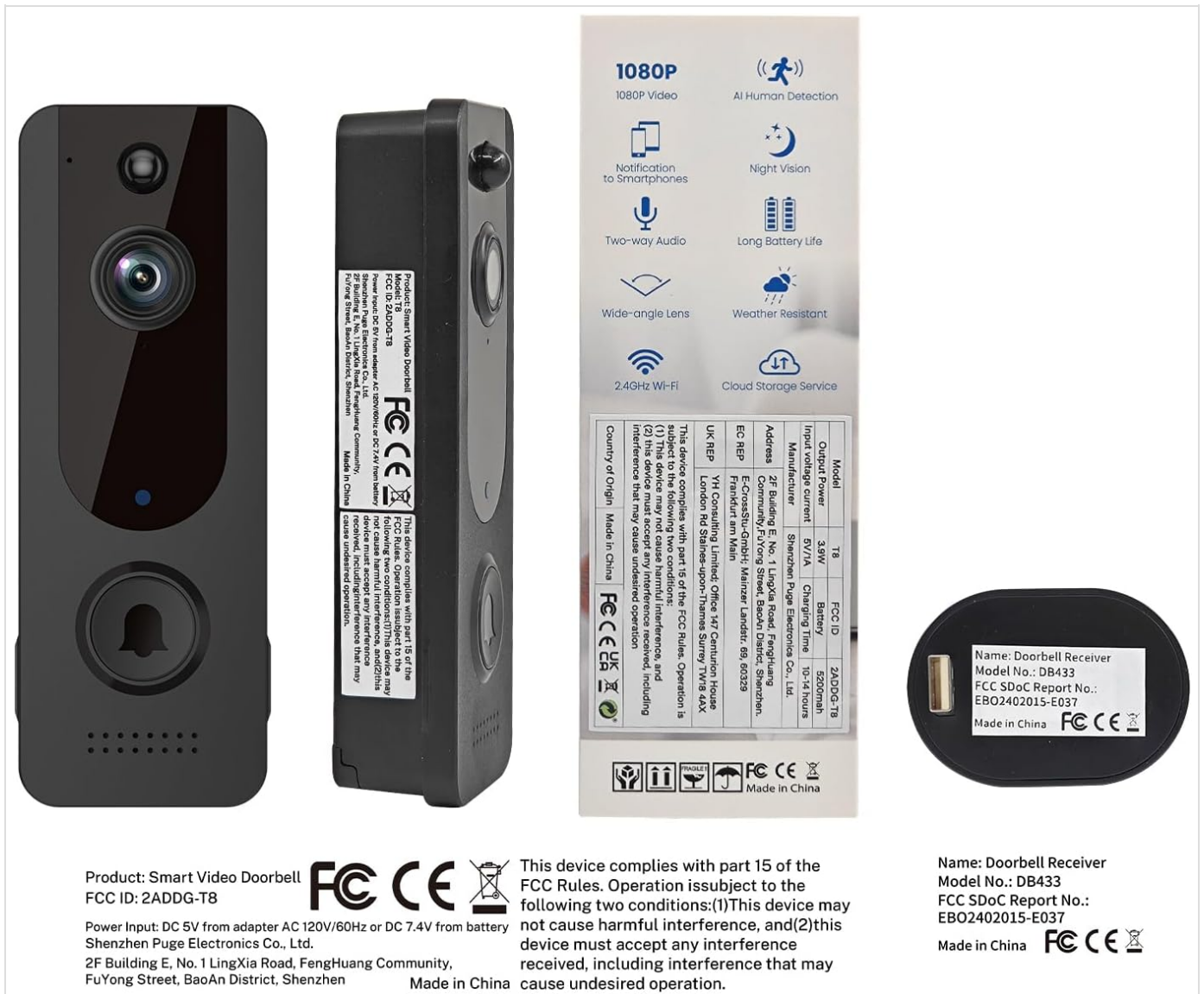
Image: Various product labels and packaging details for the Aiwit Video Doorbell and its receiver, showing model numbers, FCC IDs, and manufacturer information.