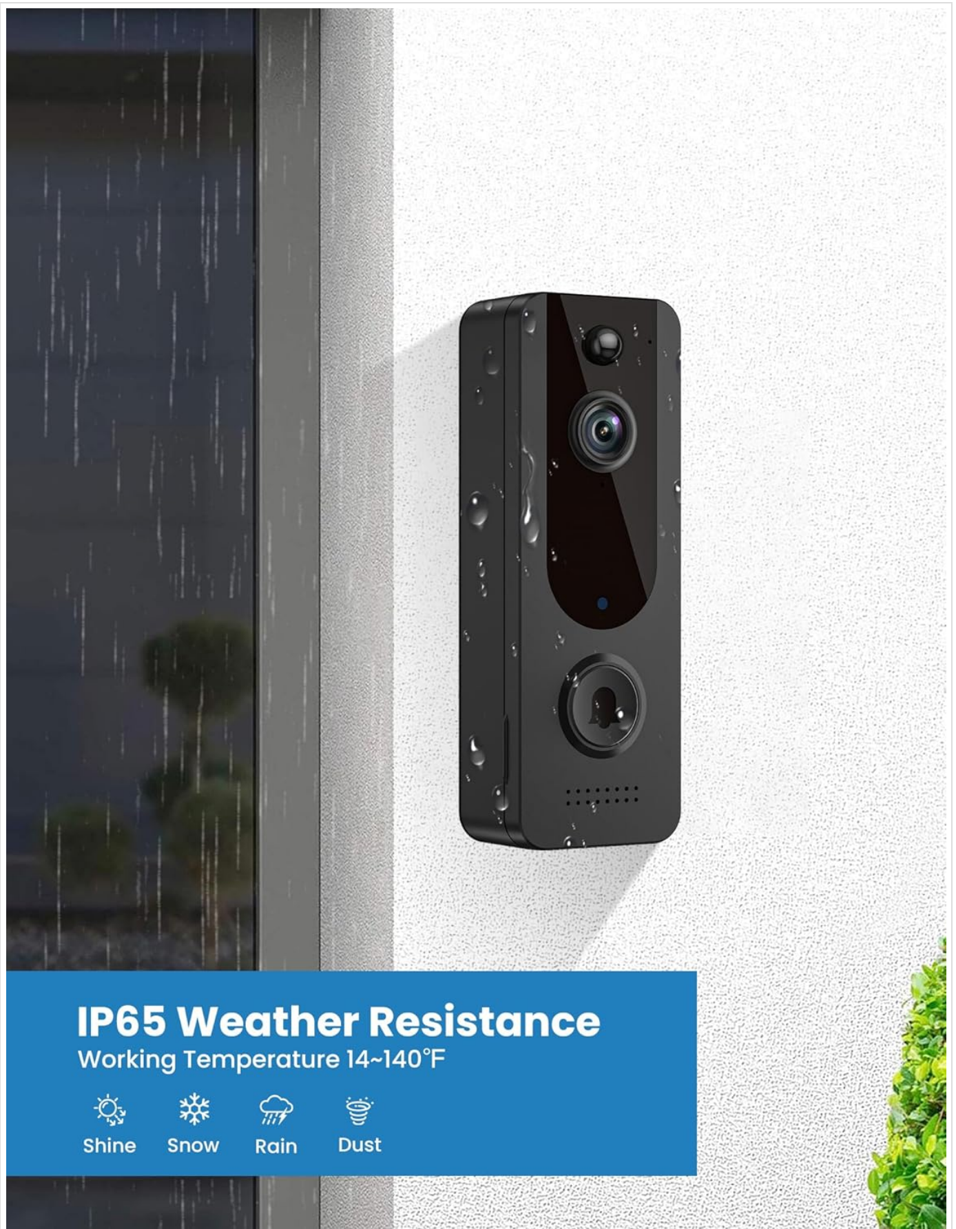
Image: The Aiwit Video Doorbell mounted outdoors, with water droplets on its surface, illustrating its IP65 weather resistance against shine, snow, rain, and dust.