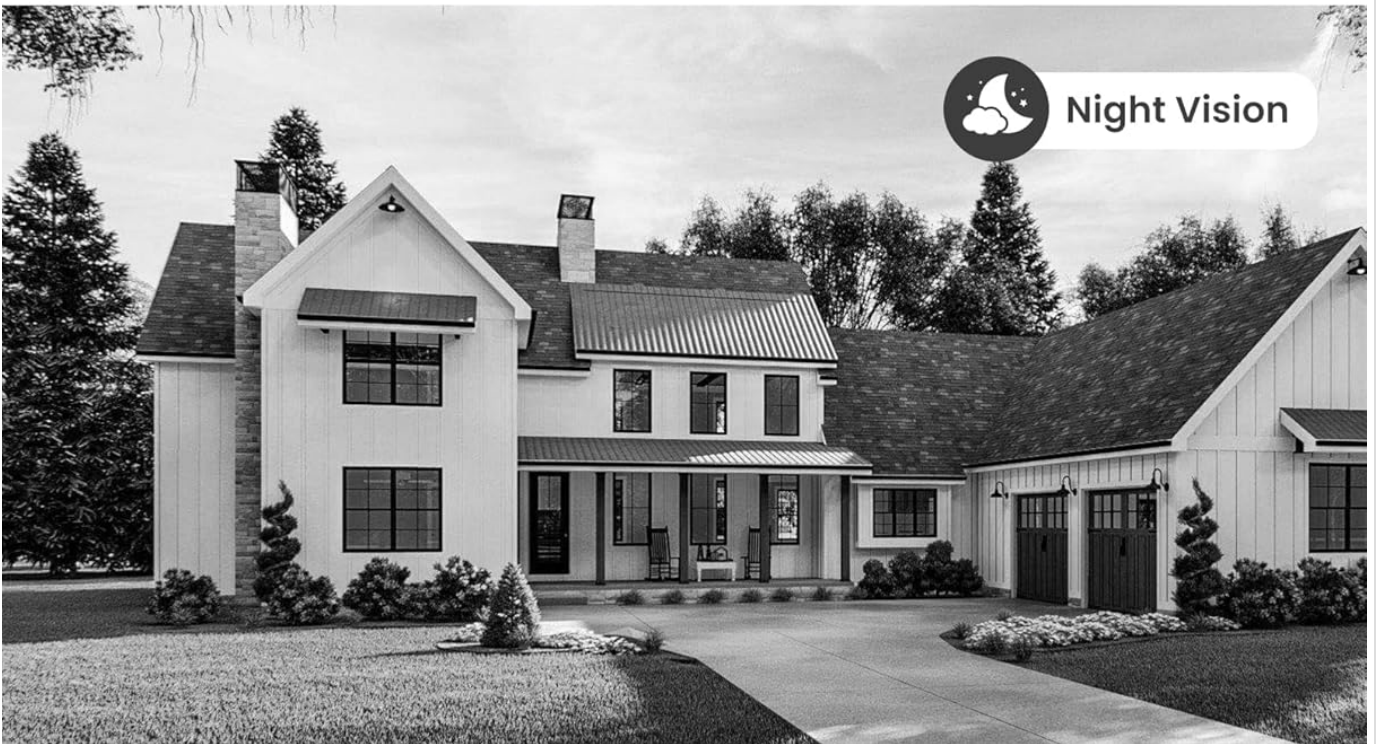
Image: A comparison showing the same house scene in daylight (color) and at night (black and white infrared night vision), demonstrating the doorbell's capability to capture clear images in darkness.