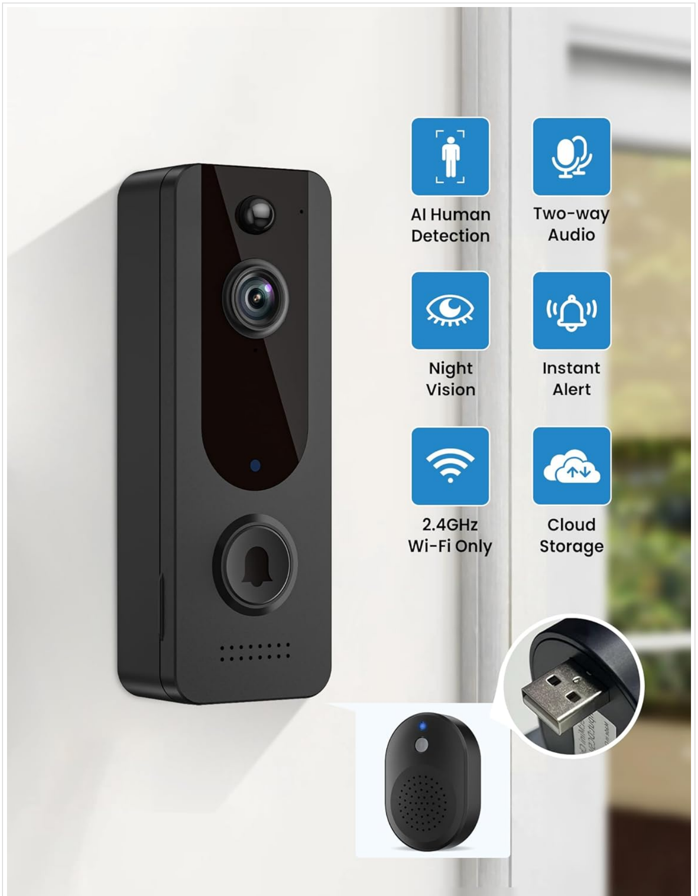
Image: The Aiwit Video Doorbell mounted on a wall, with icons highlighting key features: AI Human Detection, Two-way Audio, Night Vision, Instant Alert, 2.4GHz Wi-Fi Only, and Cloud Storage. An inset shows the USB charging port on the chime unit.