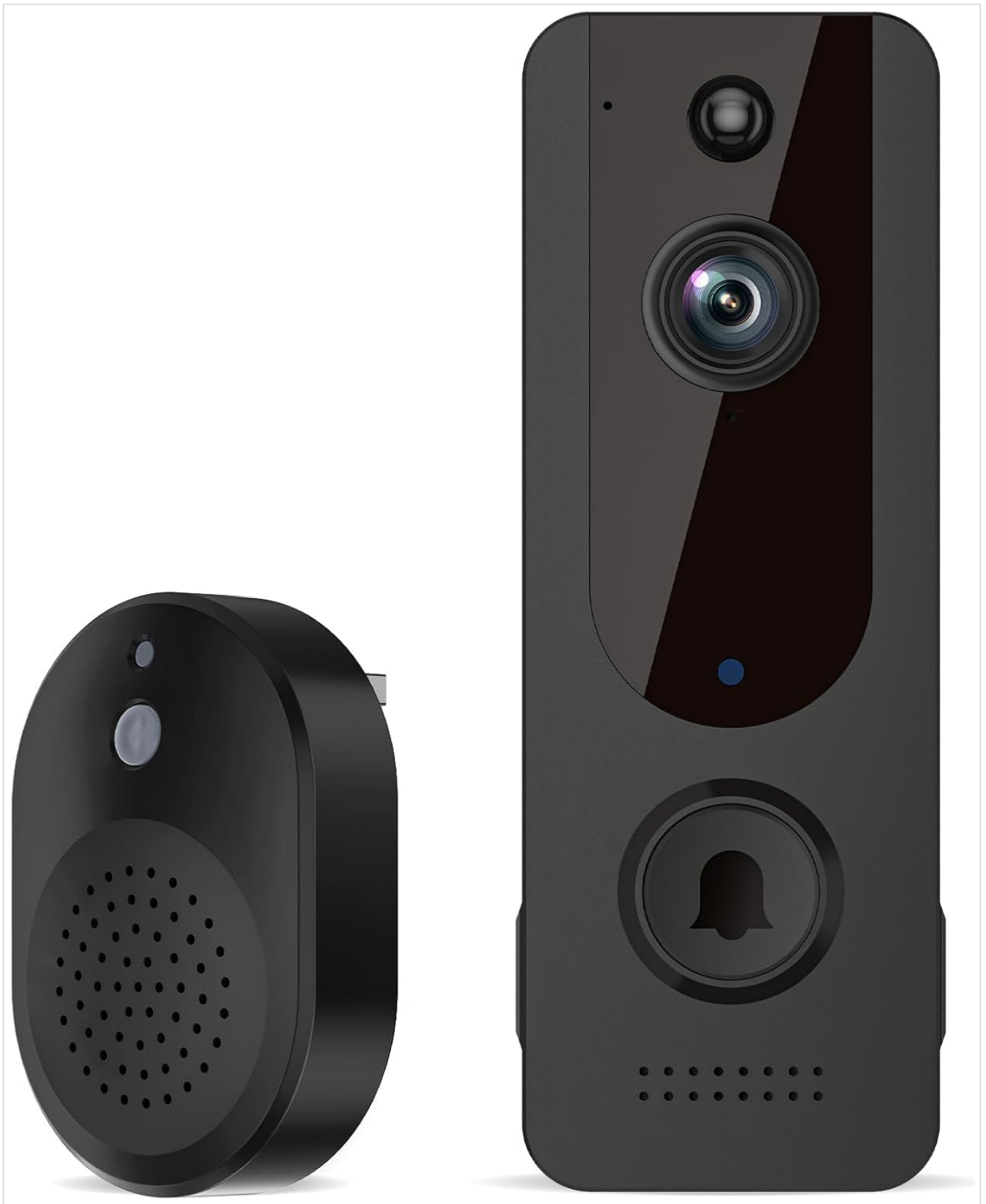
Image: The Aiwit Video Doorbell unit and its accompanying indoor chime ringer, both in black.