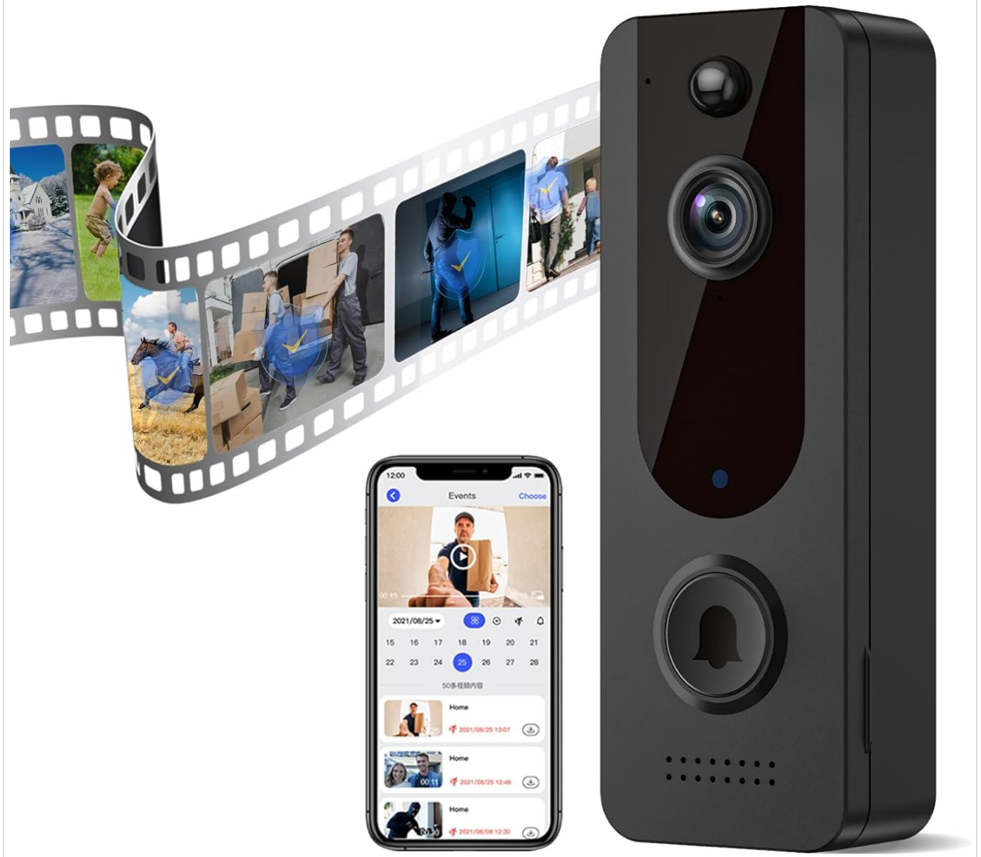
Image: A smartphone screen displaying the Aiwit app's "Events" interface, showing a calendar and a list of recorded video clips stored in the cloud.