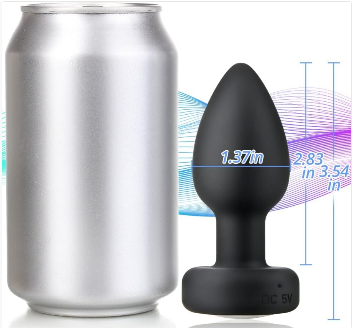
Figure 2: Product dimensions shown next to a standard beverage can for size reference. Dimensions are approximately 2.83 to 3.54 inches in length and 1.37 inches in width at the widest point.