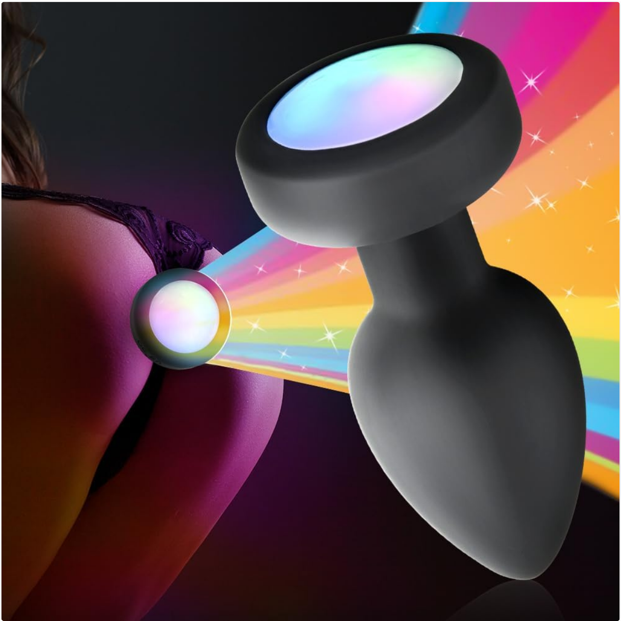
Figure 4: The luminous base displaying its colorful light effects during operation.