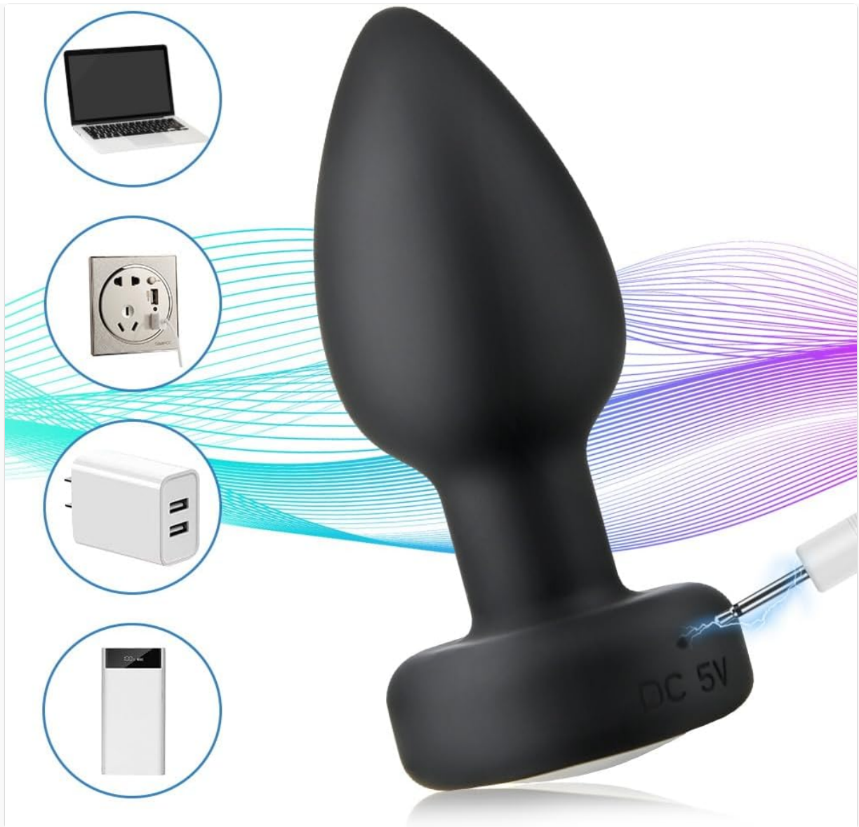
Figure 5: Illustration of connecting the USB charging cable to the device.