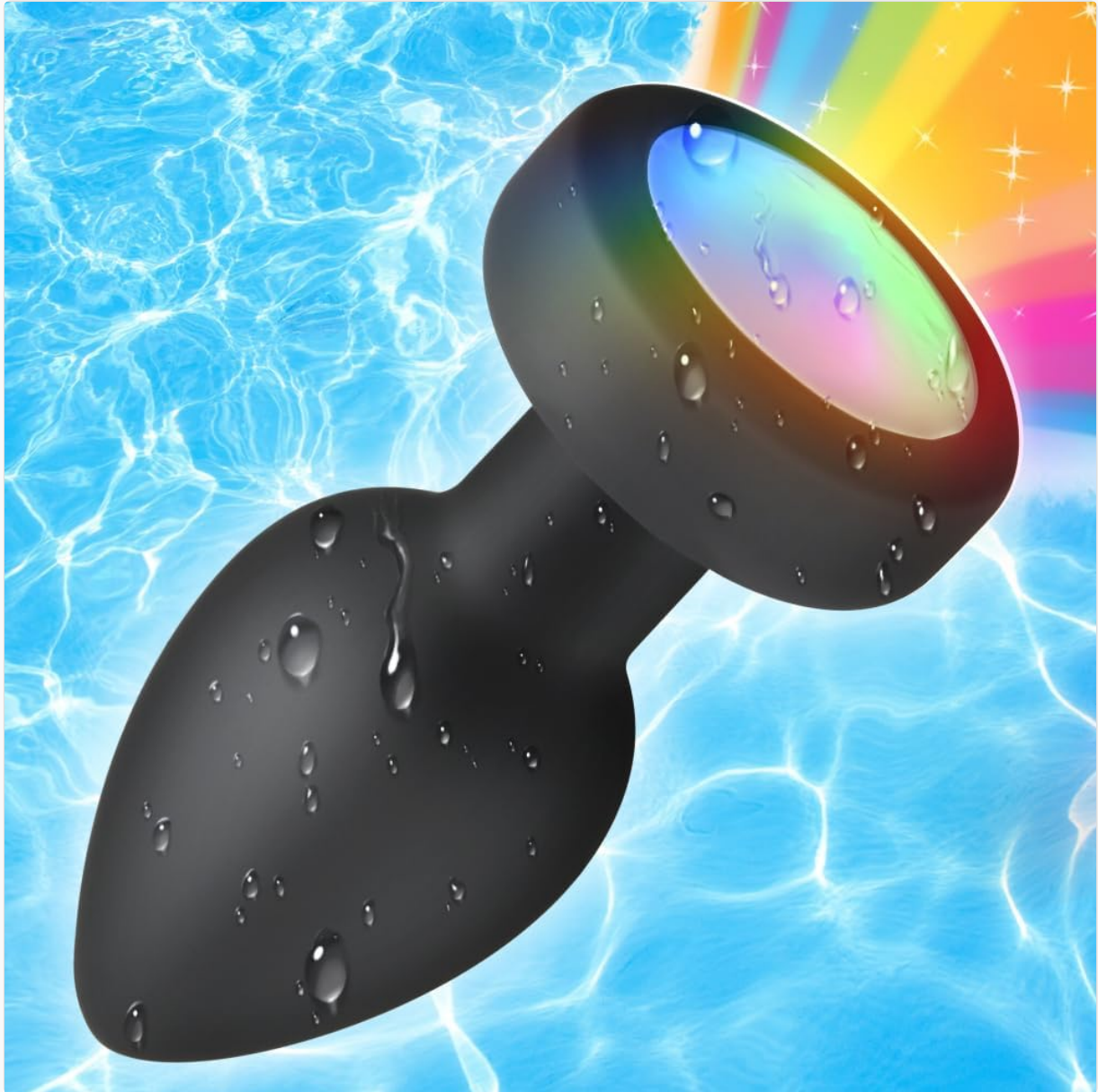
Figure 6: The device shown in water, highlighting its waterproof capability for easy cleaning.