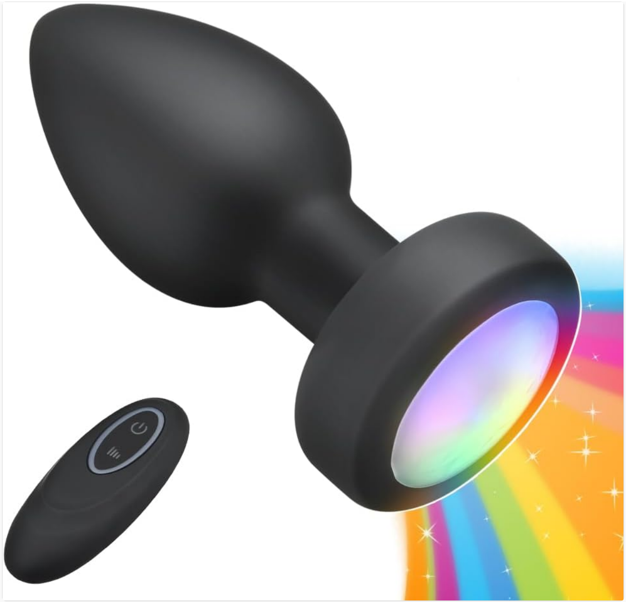
Figure 1: Main product view showing the silicone plug and its wireless remote control.