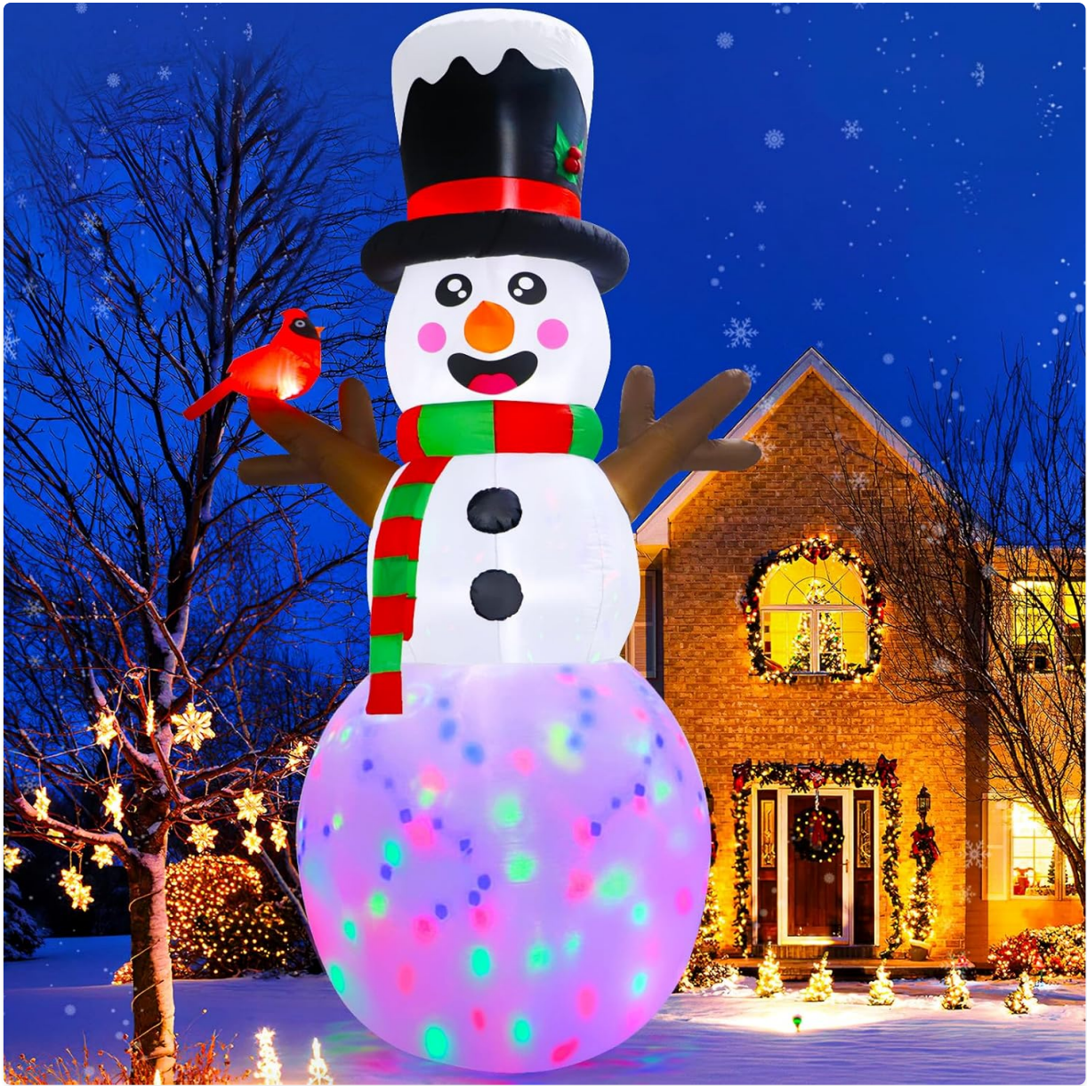
Image 1.1: The AerWo 12FT Giant Inflatable Snowman in an outdoor setting.