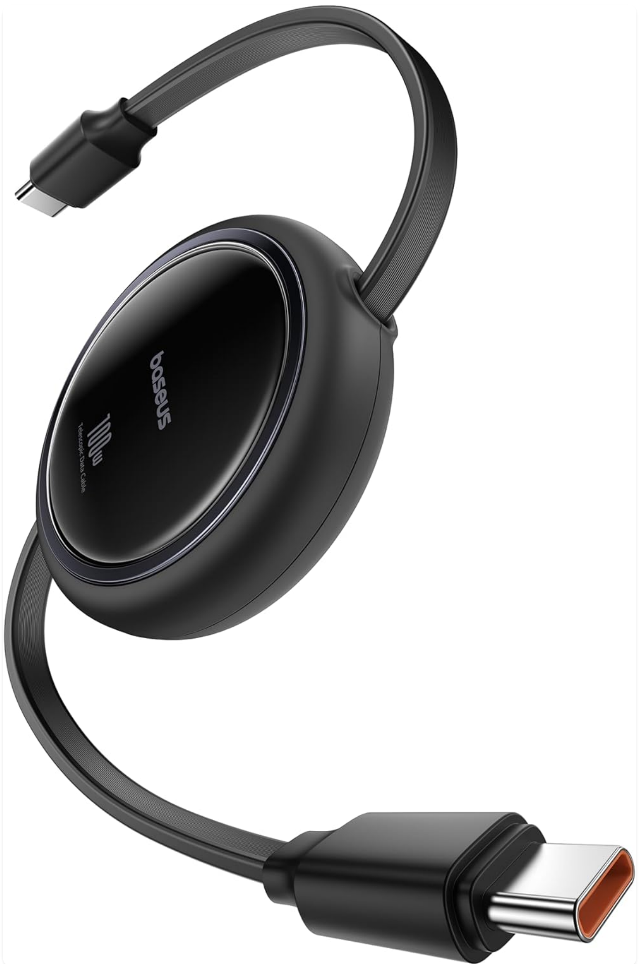
Figure 1: The Baseus 100W Retractable USB C Cable in black, showcasing its compact, circular design with both USB-C connectors extended.