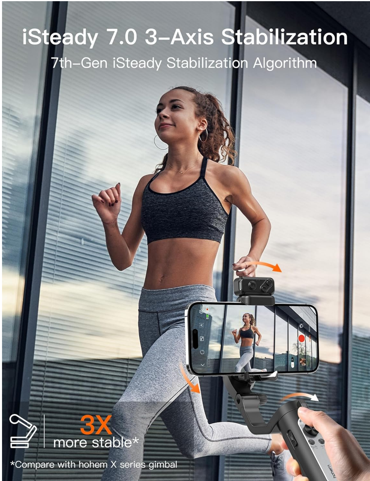
Image: A woman running while using the hohem iSteady XE Kit Gimbal Stabilizer, illustrating the iSteady 7.0 3-axis stabilization system for smooth video capture.