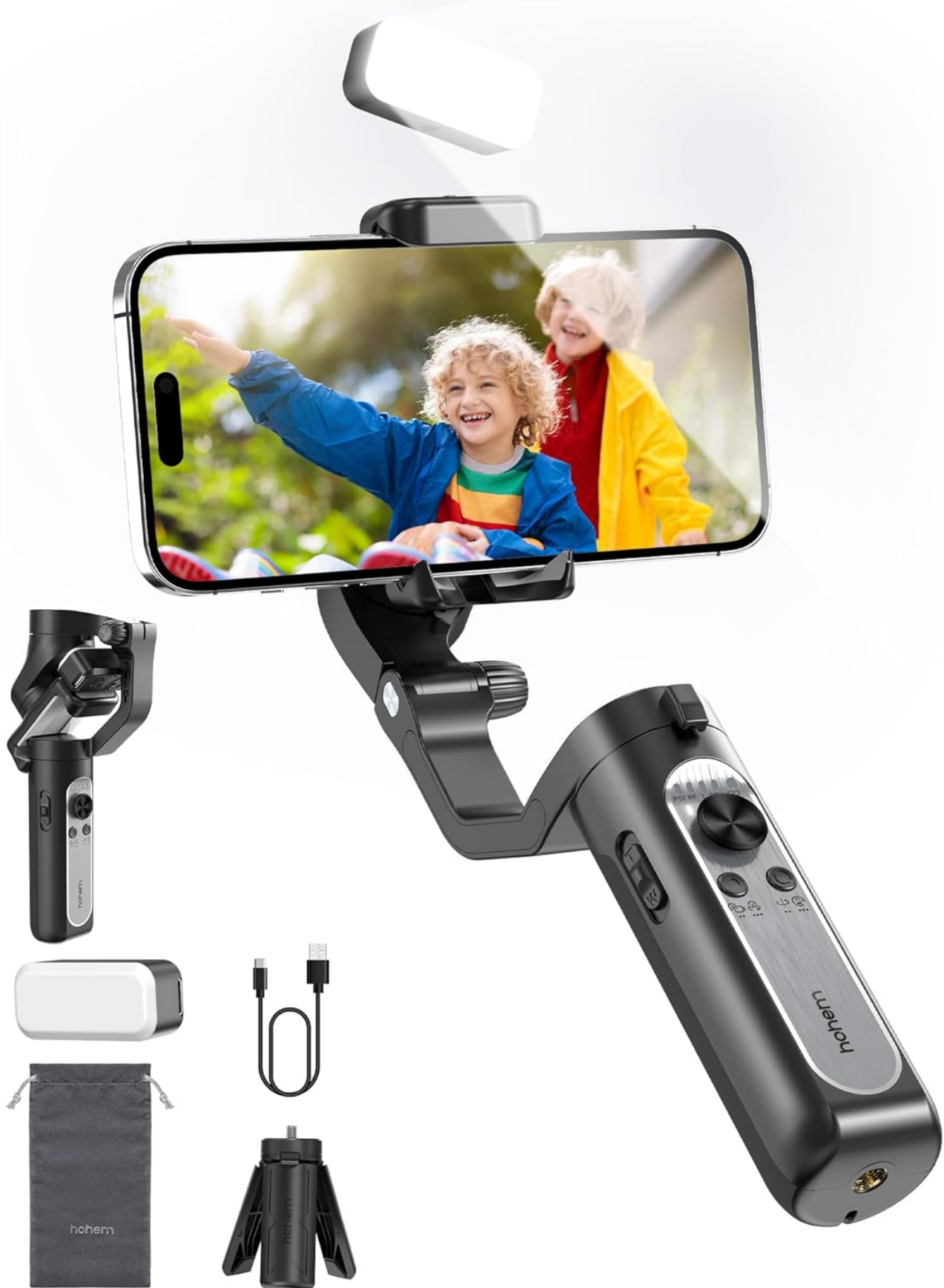
Image: The hohem iSteady XE Kit Gimbal Stabilizer with a smartphone mounted, alongside its accessories including the magnetic fill light, tripod, storage pouch, and USB-C charging cable.

Video: Detailed guide on mounting and balancing a smartphone on the hohem iSteady XE Gimbal Stabilizer.