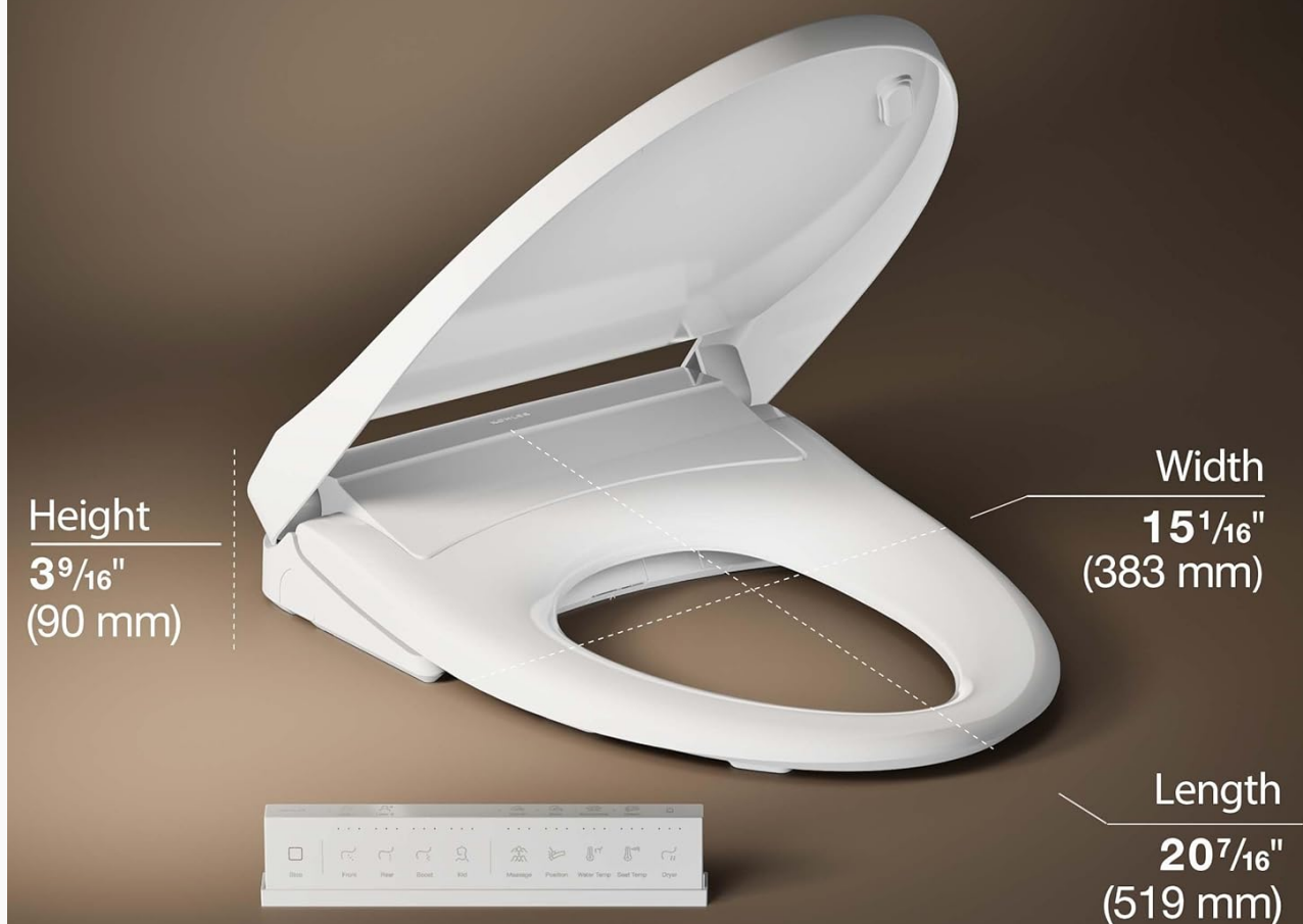
Image: Diagram showing the elongated seat dimensions of the Kohler PureWash E930 Bidet Toilet Seat: Height 3 9/16" (90 mm), Width 15 1/16" (383 mm), Length 20 7/16" (519 mm).