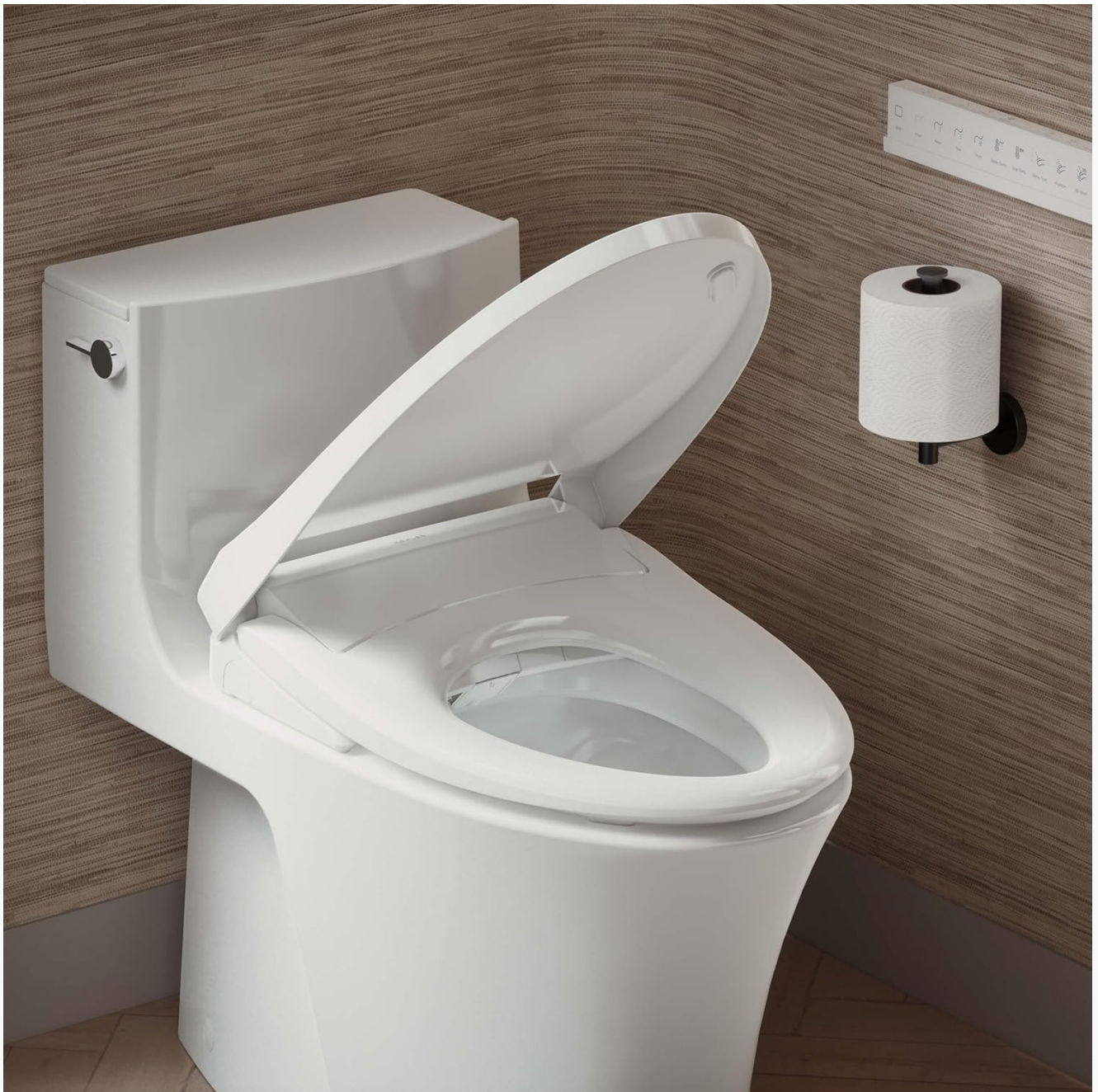
Image: The Kohler PureWash E930 Bidet Seat installed on a toilet with the lid open, showing its sleek design.