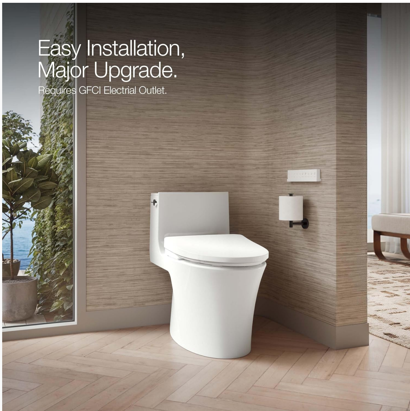
Image: A view of the Kohler PureWash E930 Bidet Seat installed on a toilet, highlighting its easy installation process. A GFCI electrical outlet is required.

Your browser does not support the video tag.