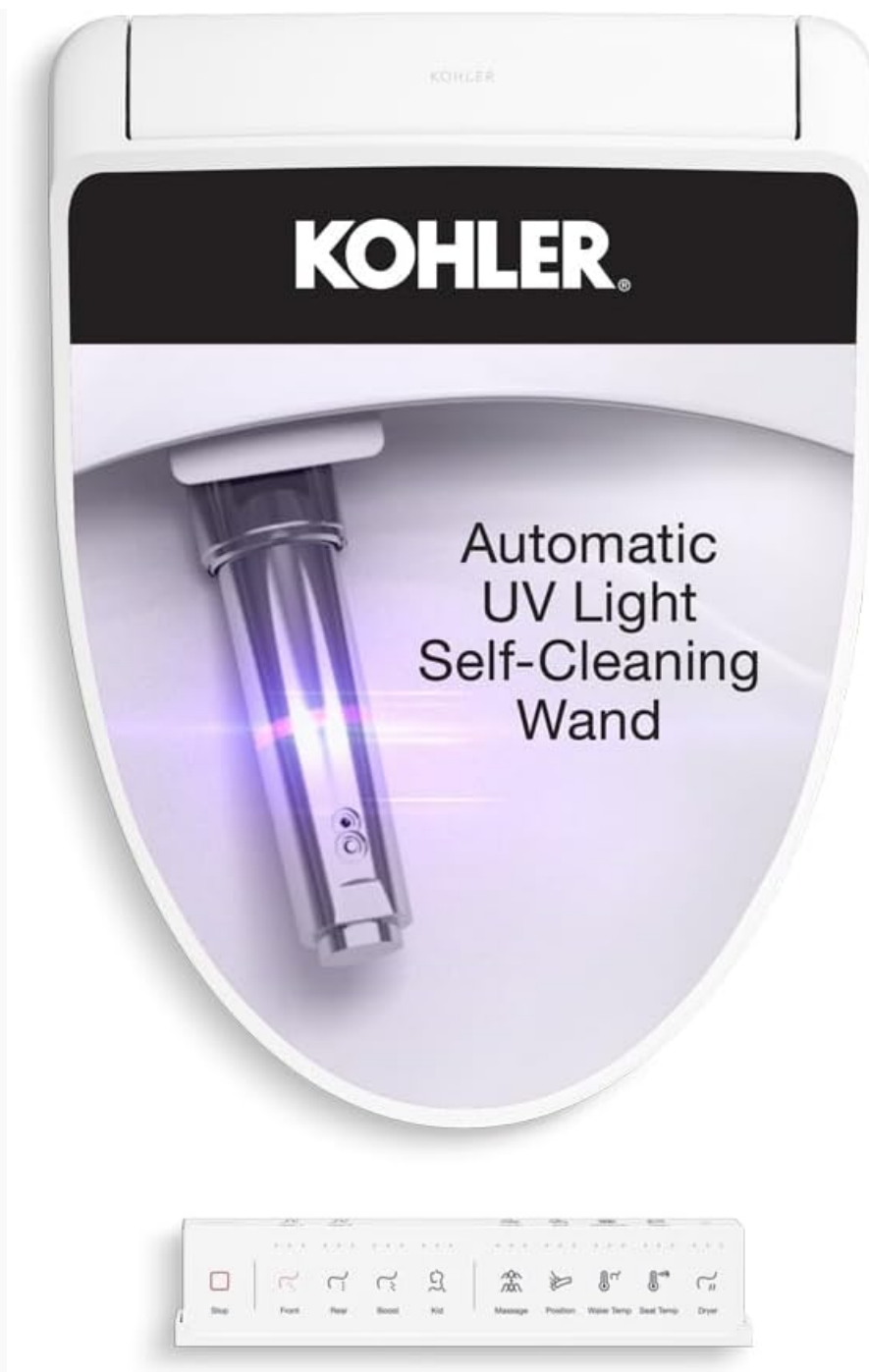
Image: The Kohler PureWash E930 Bidet Seat highlighting its automatic UV light self-cleaning wand for enhanced hygiene.