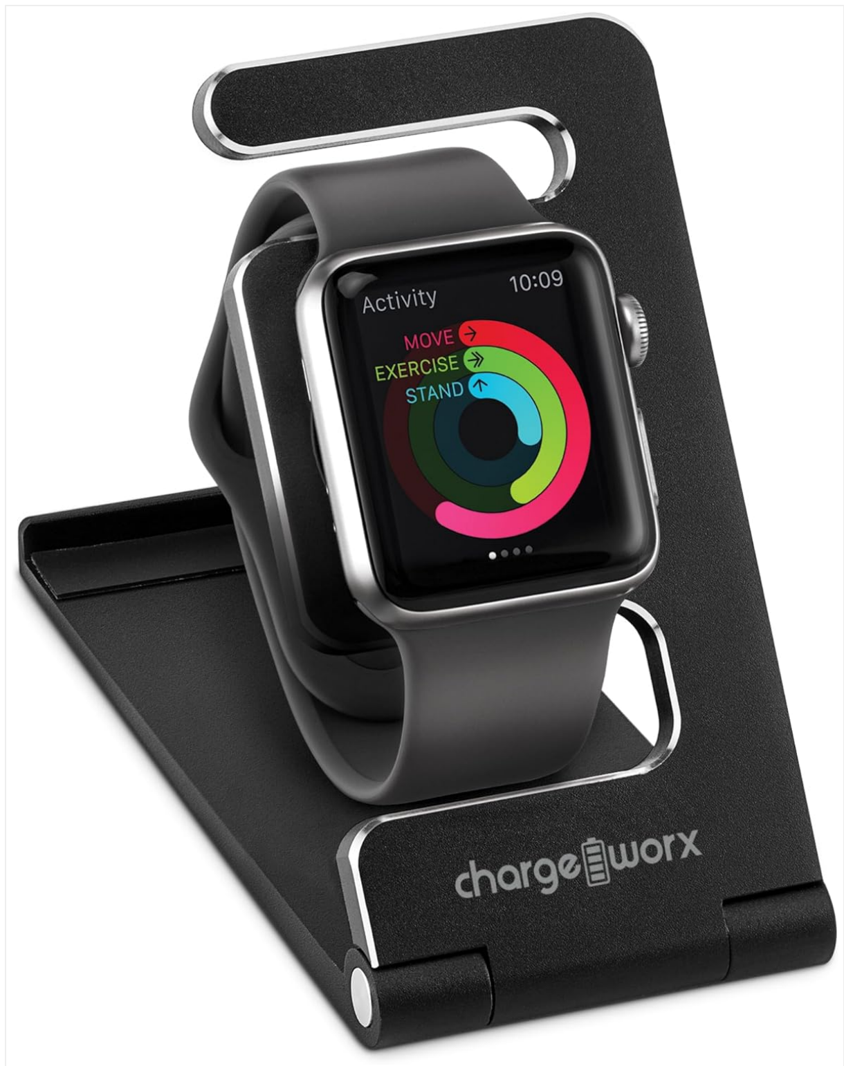
Image: The ChargeWorx Foldable Charger Stand in its open position, holding a smartwatch. The stand is black with a silver accent.