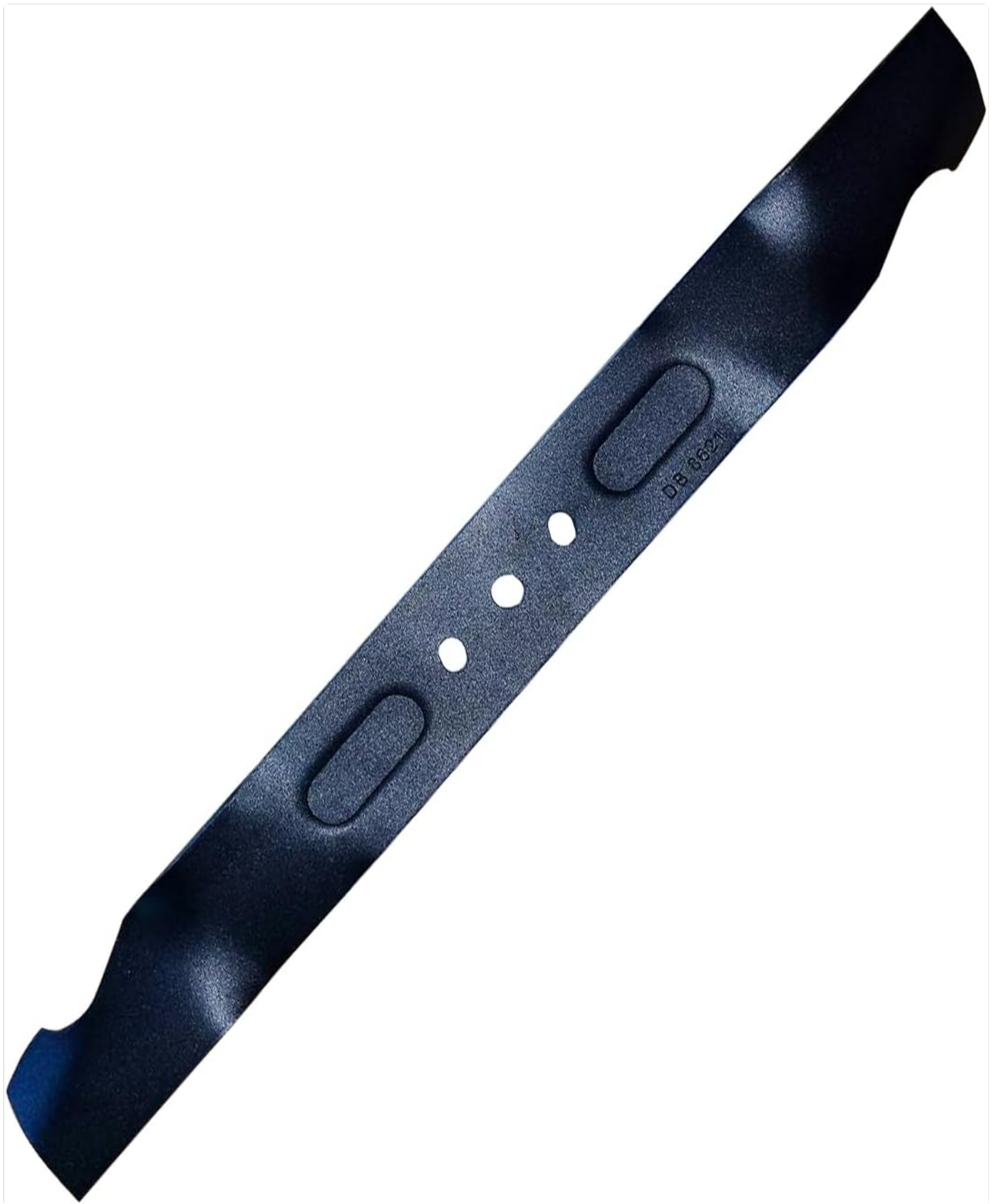
Image: The PowerSmart 21-inch cutting blade, part number 303071037A. This black alloy steel blade features a central mounting hole and two smaller alignment holes, designed for efficient grass cutting.