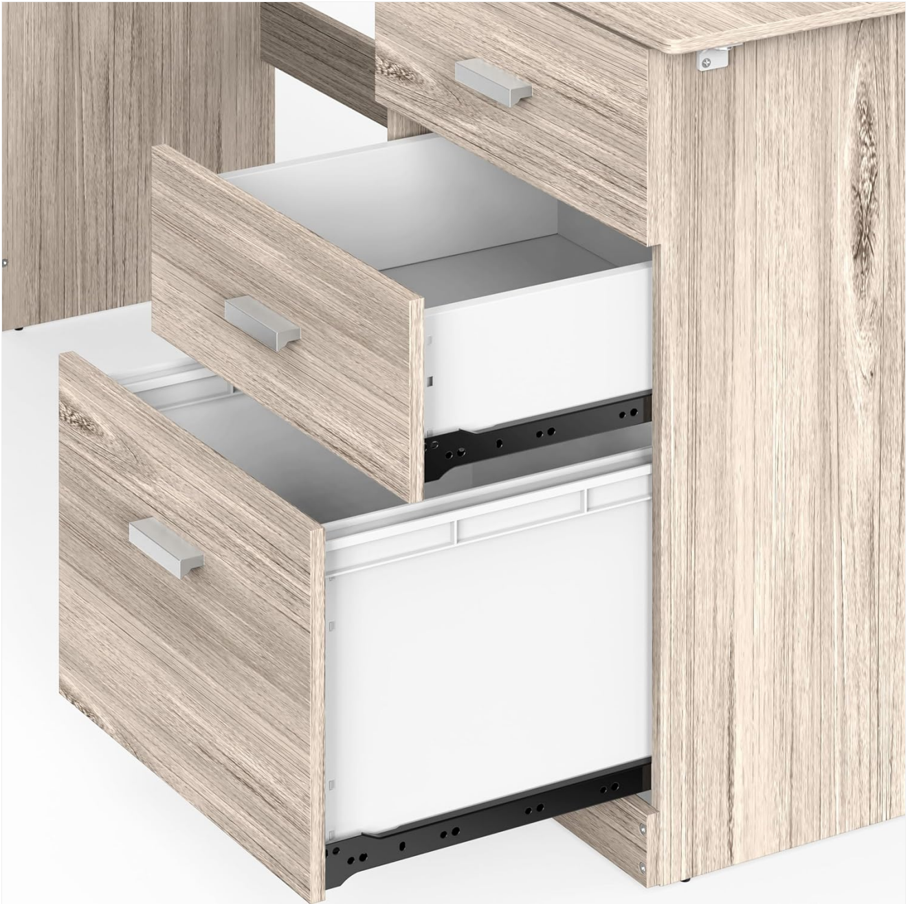
Figure 8: Integrated drawers

The integrated drawer unit includes two smaller box drawers for office supplies and one larger file drawer designed to accommodate letter-size hanging files. Ensure drawers are not overloaded to allow for smooth operation.