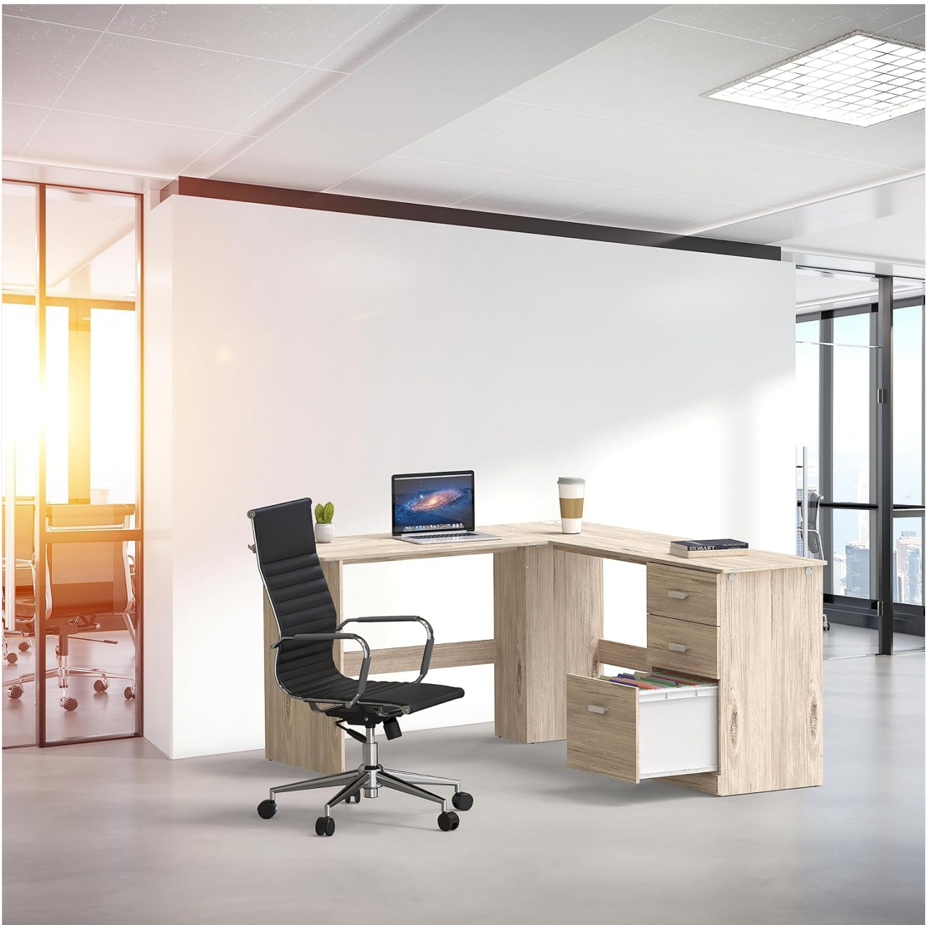
Figure 6: Completed desk in an office setting