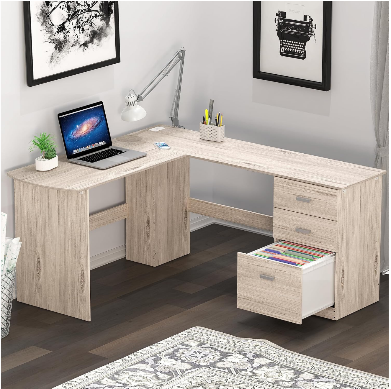
Figure 1: SHW L-Shaped Home Office Desk in Maple