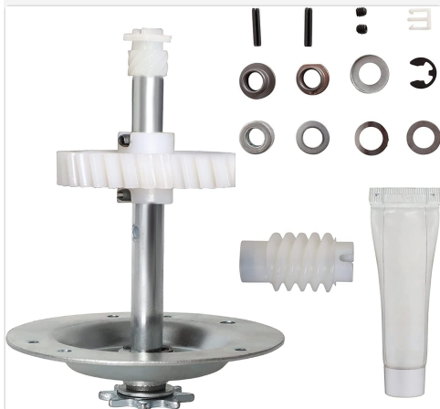
Image: Individual components of one replacement kit.