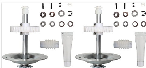
Image: Two complete gear and sprocket replacement kits.