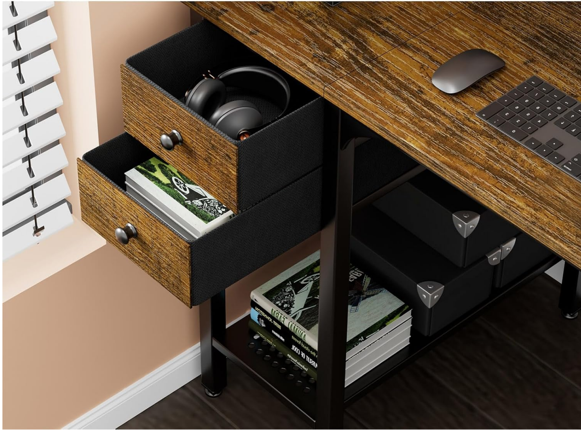
Image 4.3: The two-tier fabric drawers providing storage within the desk structure.