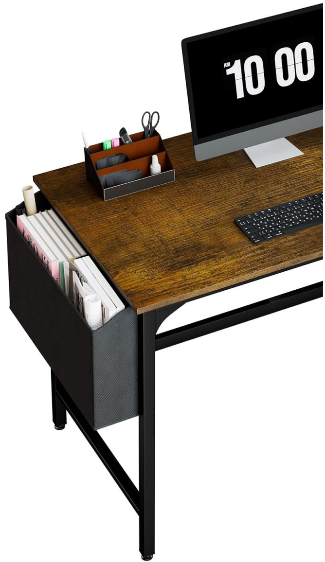
Image 4.5: The side storage bag attached to the desk, illustrating its use for additional storage.