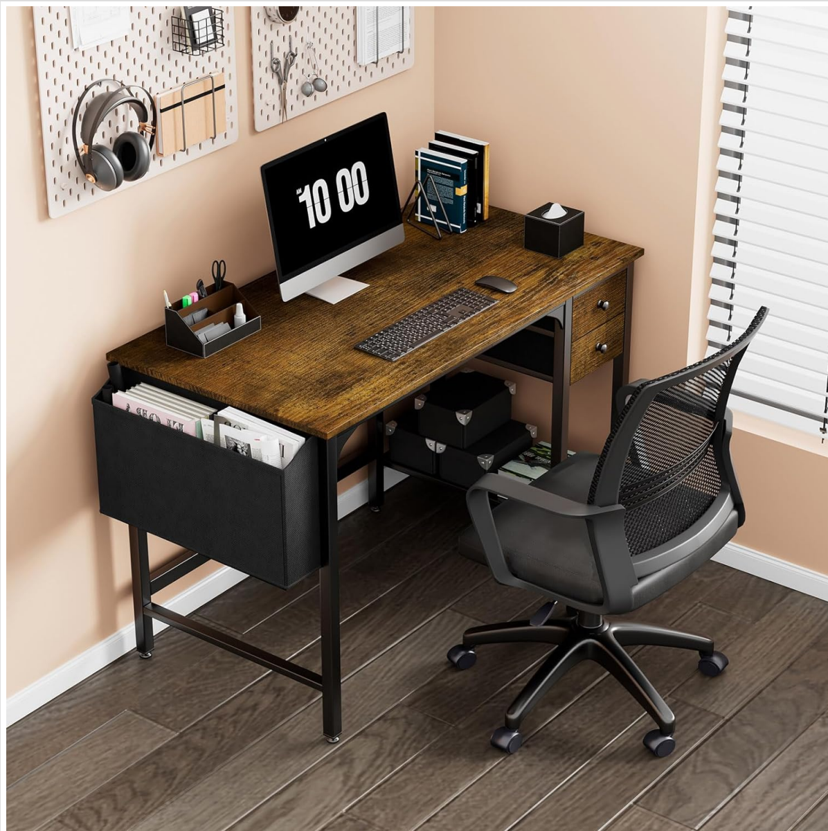
Image 1.1: The Lufeiya 40 inch Computer Desk with Drawers, showcasing its design and functionality in a typical office setup.