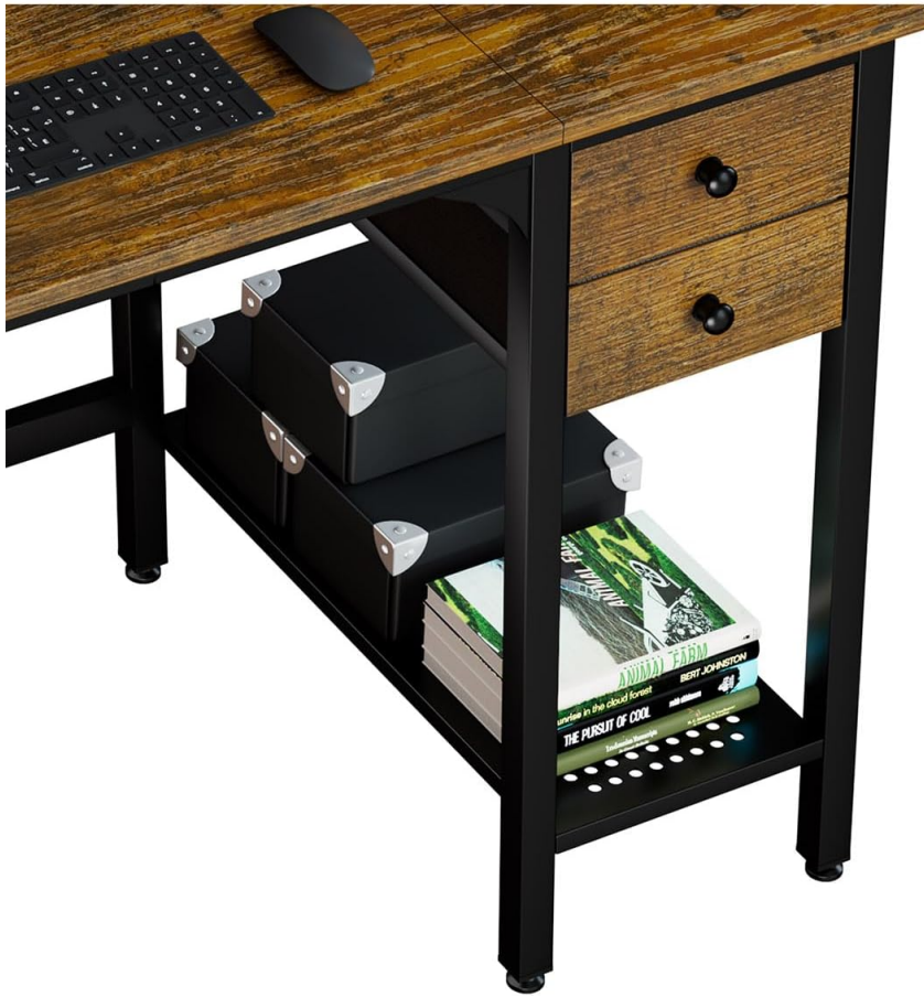
Image 4.2: Detail of the bottom shelf being placed into the desk frame.

Additional storage space for keeping books and other necessities