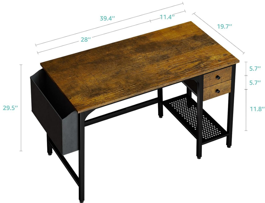
Image 8.1: Detailed product dimensions, including length, width, and height measurements.