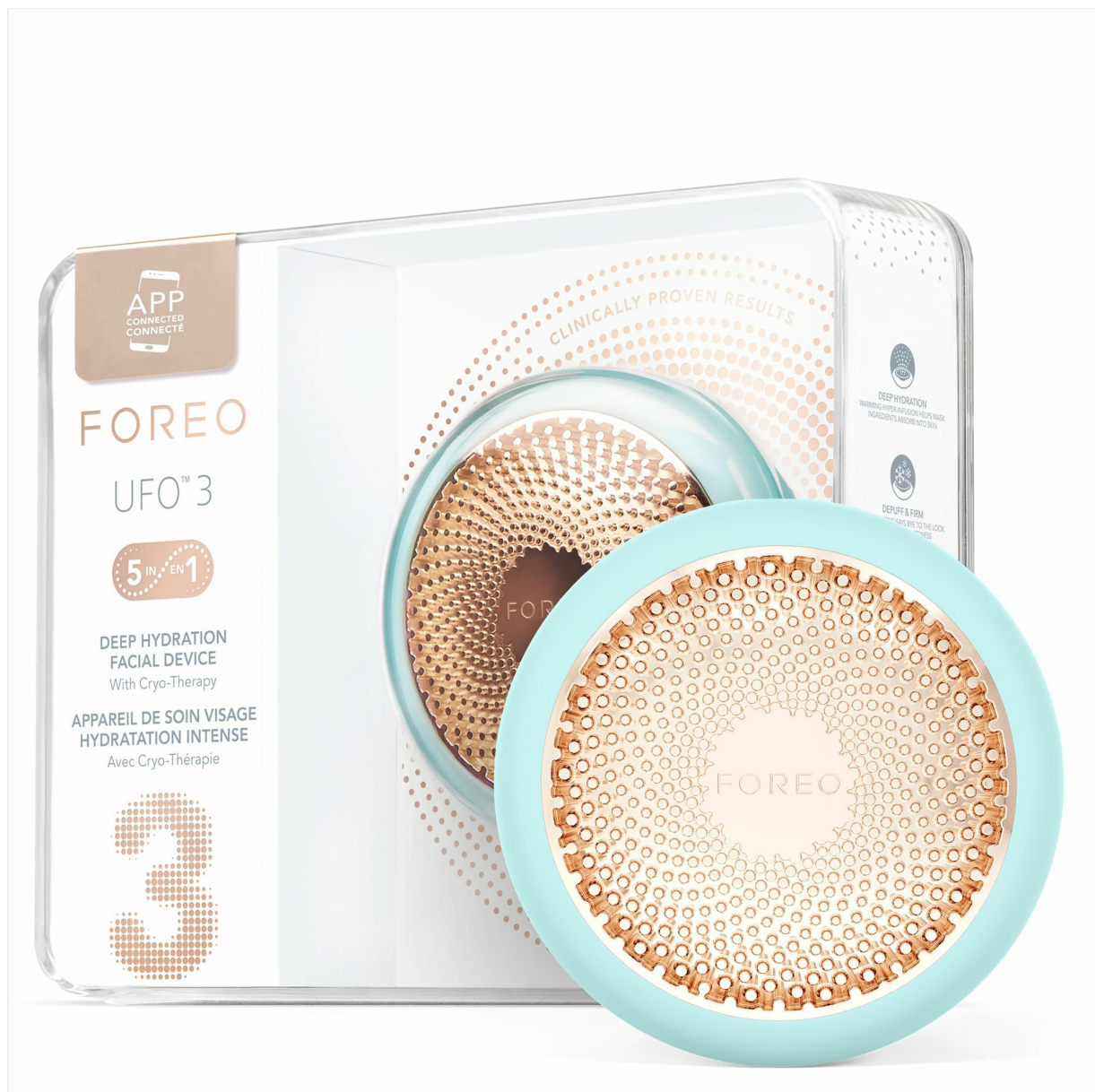
The FOREO UFO 3 device, showcasing its compact and ergonomic design.