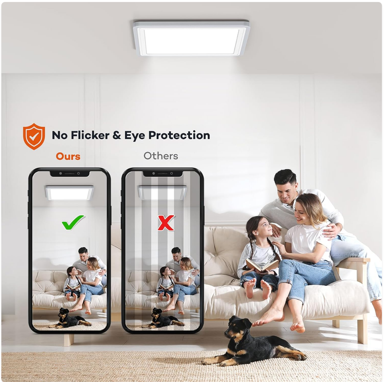
Image: This image visually compares the Annaror Smart LED Ceiling Light, which offers no flicker and eye protection (indicated by a green checkmark), against a conventional light that flickers (indicated by a red 'X'). A family is shown comfortably under the Annaror light.