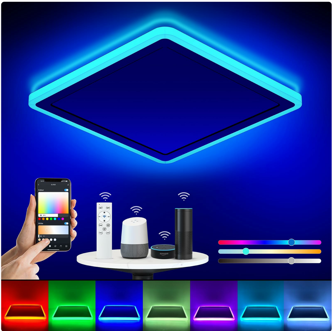
Image: The Annaror Smart LED Ceiling Light installed on a ceiling, illuminating a living room with vibrant RGB colors. A mobile app interface for color selection is visible on the right, demonstrating the light's ability to create diverse atmospheres.