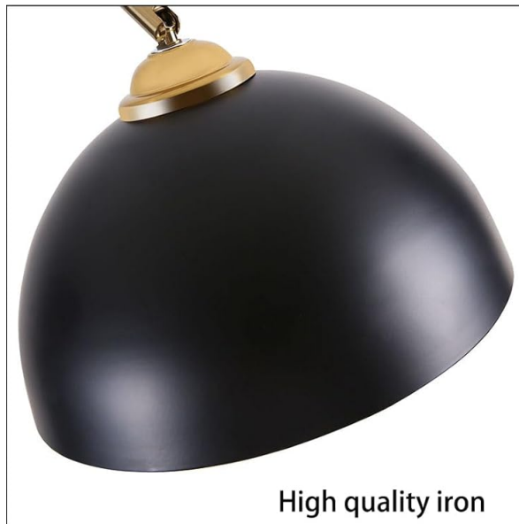
High quality iron