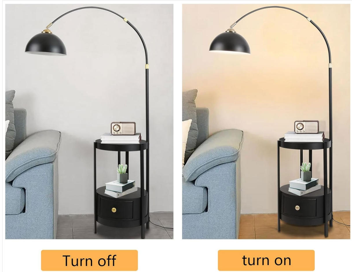
Image: A visual comparison of the lamp in its 'off' state (left) and 'on' state (right), illustrating the illumination provided when active.