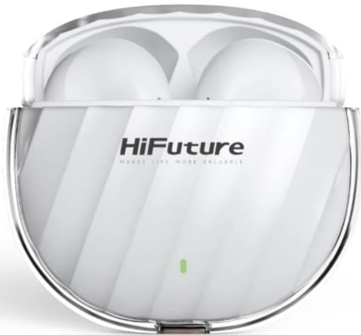
Image: HiFuture FlyBuds3 earbuds in their charging case, ready for charging or use.