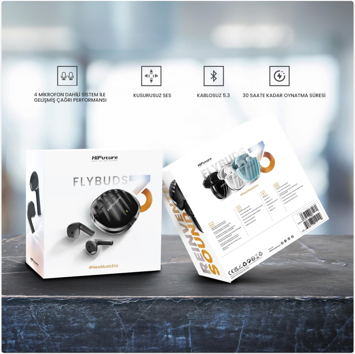
Image: HiFuture FlyBuds3 product packaging highlighting key features and specifications.