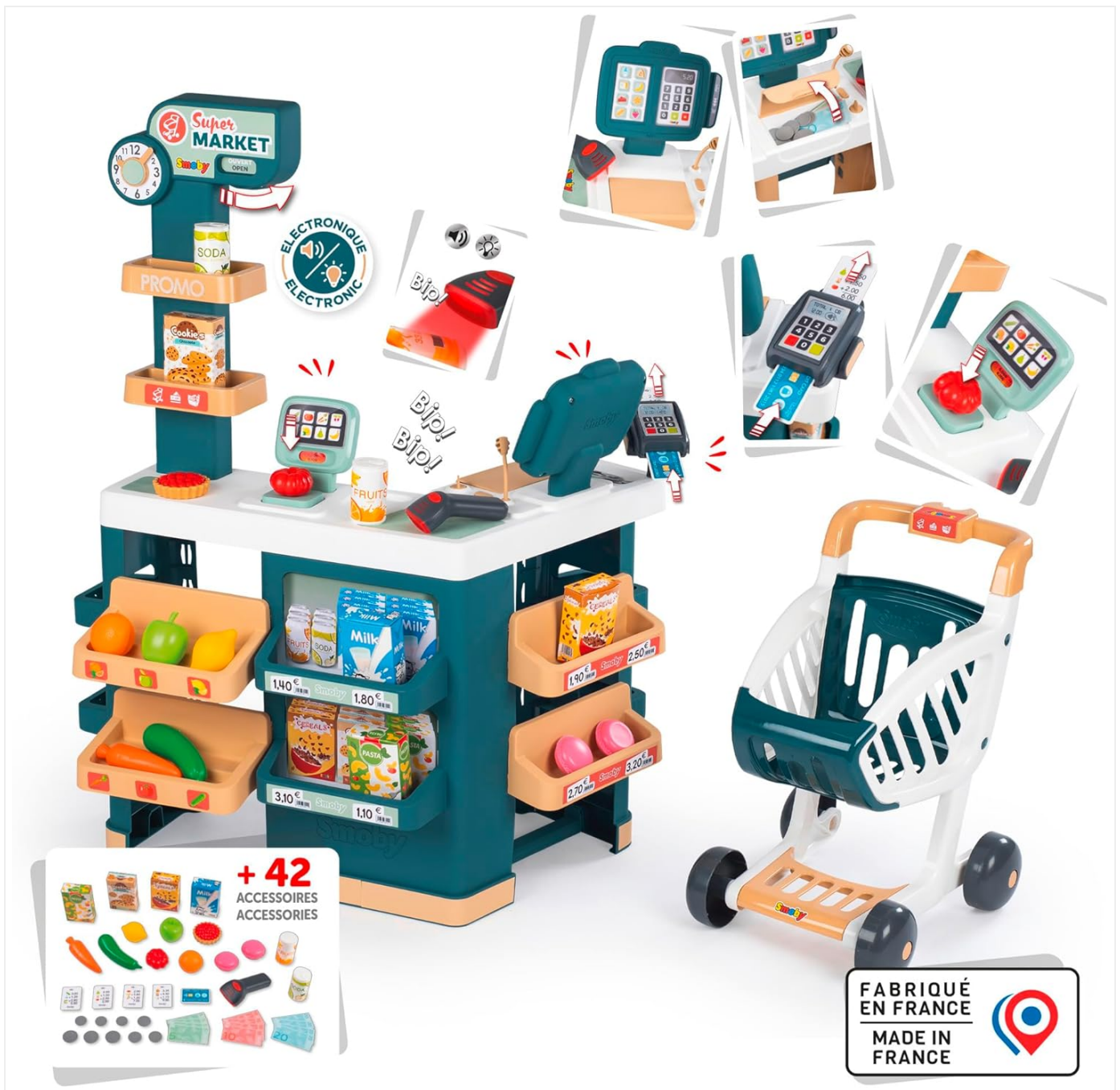
Figure 2: Fully assembled Smoby Supermarket playset.