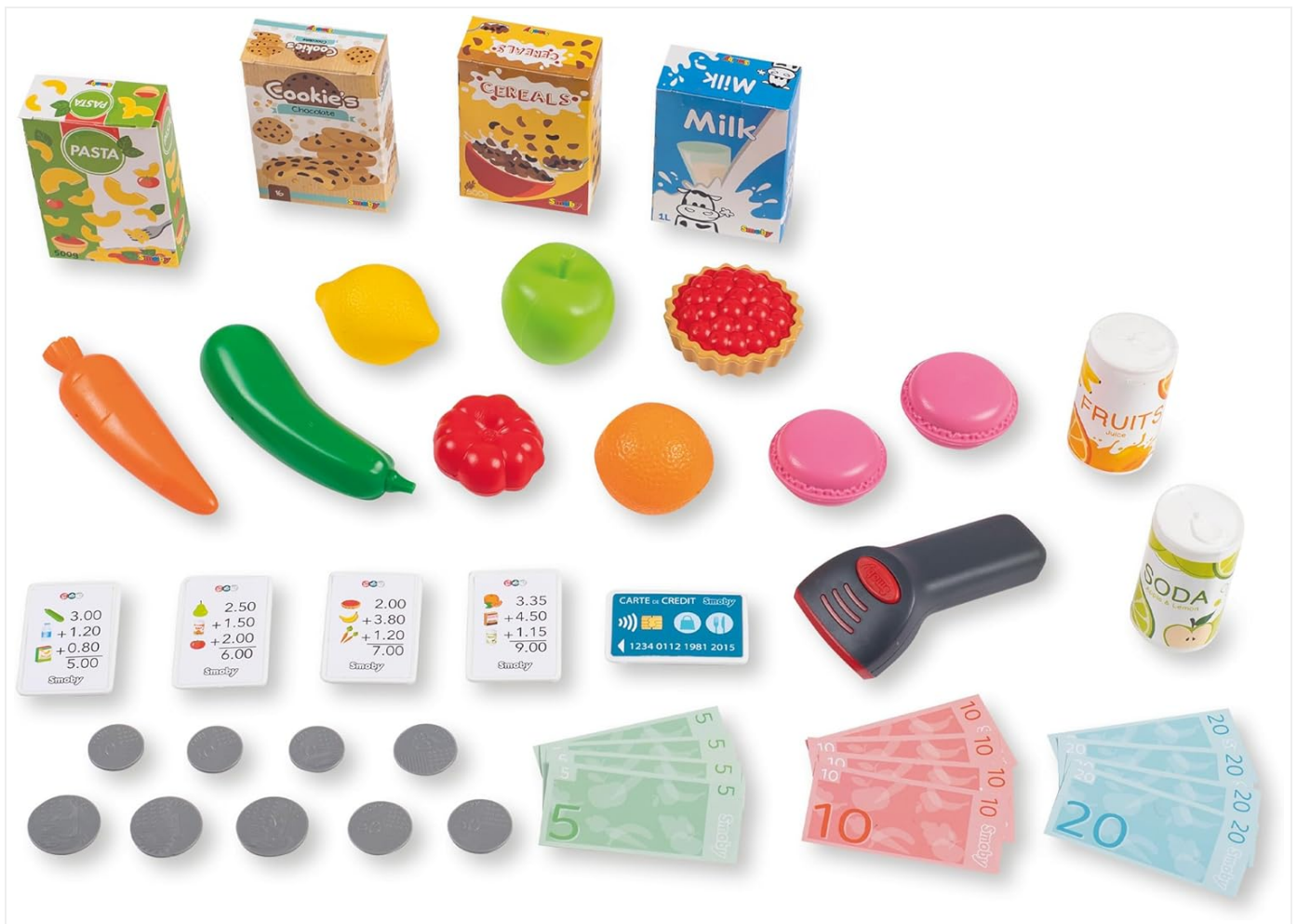
Figure 1: Included accessories. Please check against this image to ensure all parts are present.