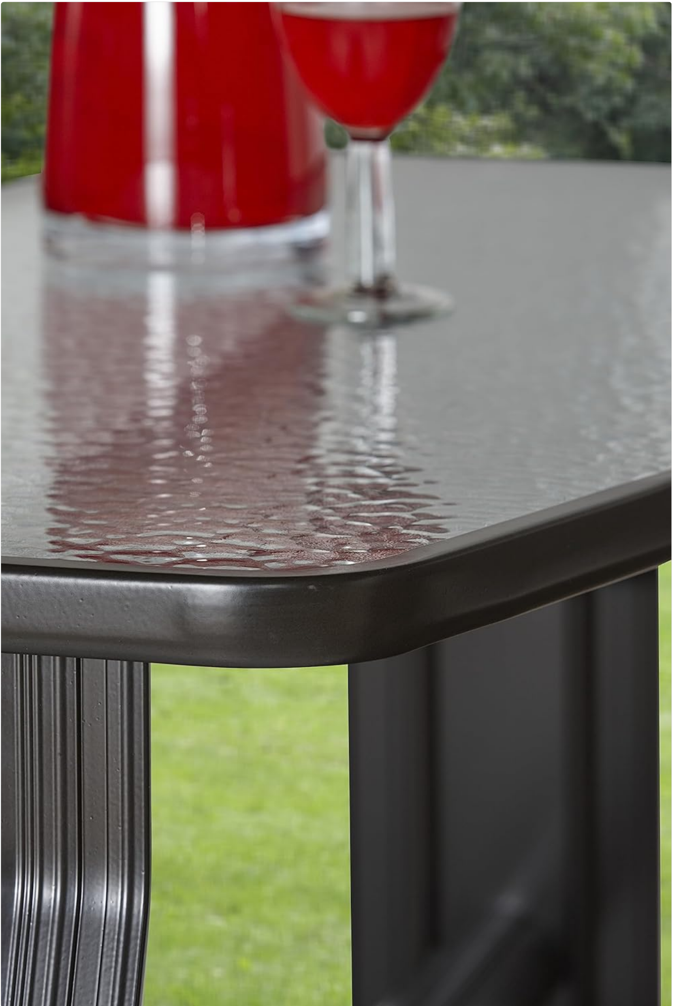
Figure 5.1: Close-up view of the 5 mm water wave tempered glass top table. This image highlights the texture and material of the central table, suitable for holding beverages or small items.