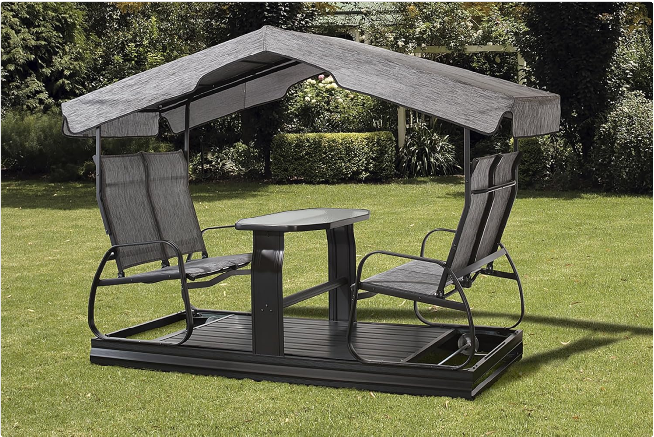
Figure 4.2: The assembled Sojag Eco 4-Seater Garden Swing placed in a garden. This image illustrates the product's appearance in an outdoor environment, highlighting its integration with natural surroundings.