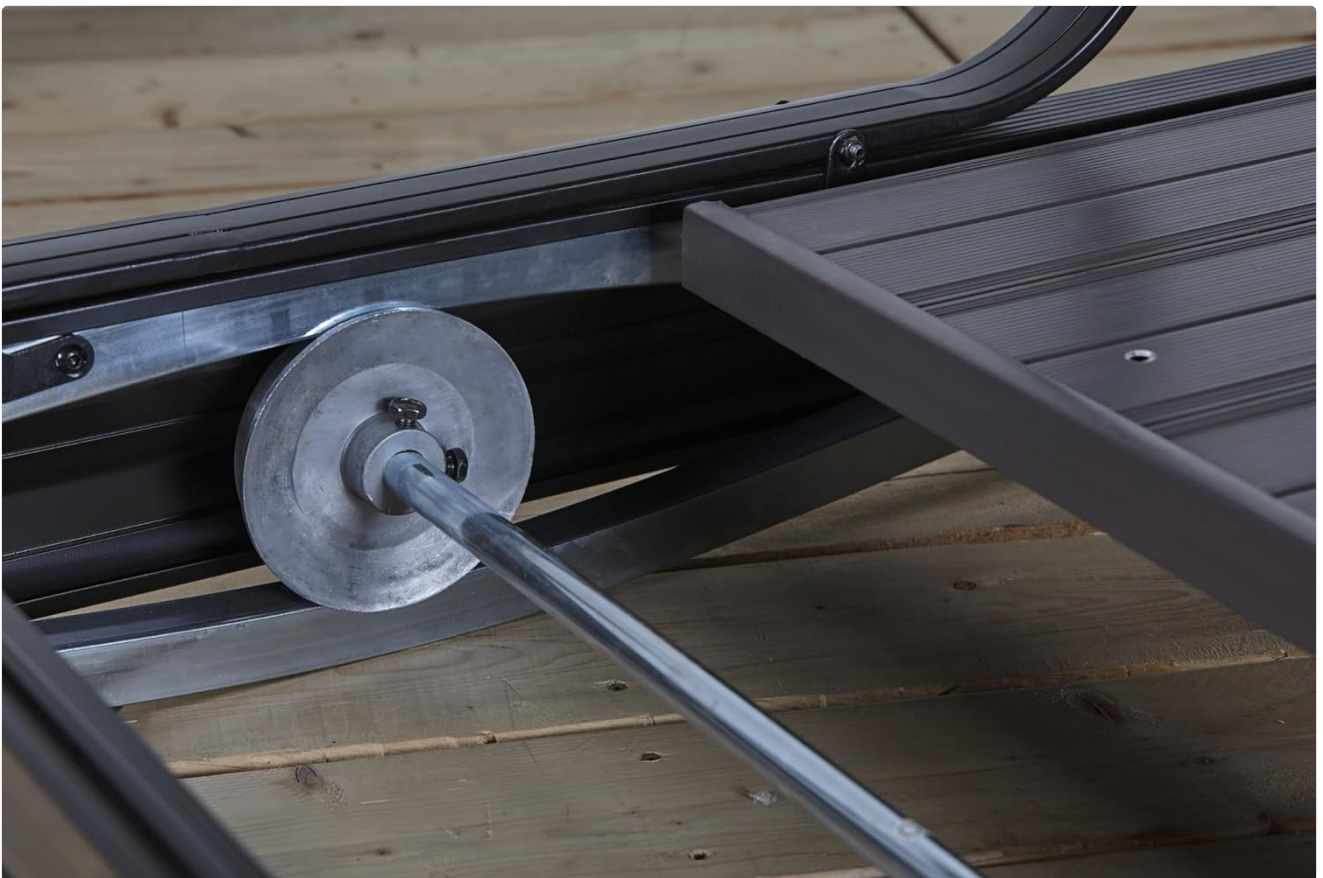
Figure 5.3: Close-up of the gliding mechanism at the base of the swing. This image illustrates the wheel and axle system that allows the seats to move smoothly back and forth.