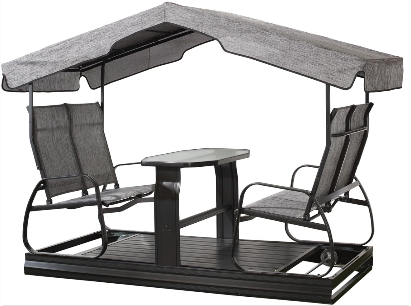
Figure 1.1: The Sojag Eco 4-Seater Garden Swing. This image shows the complete swing set with its canopy, two seating areas, and a central table, designed for outdoor use.