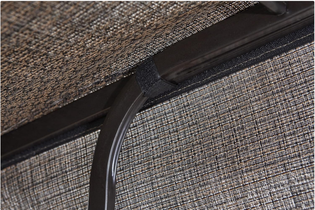
Figure 6.2: Detailed view of the canopy attachment point to the frame. This image illustrates how the canopy is secured, which is important for removal during winter storage.