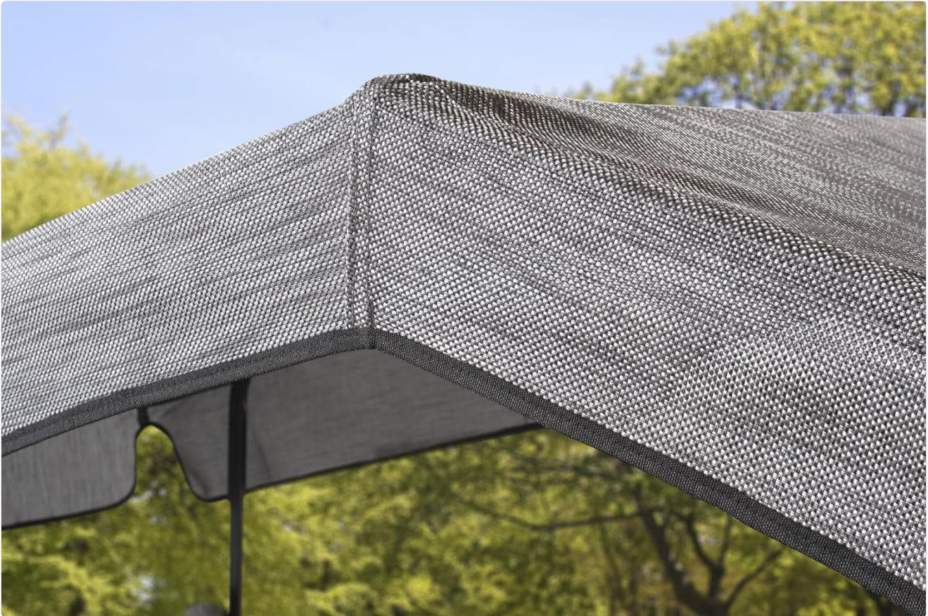
Figure 6.1: Close-up of the roof canopy fabric. This image shows the texture and weave of the PVC-coated polyester material used for the canopy, designed for sun protection.