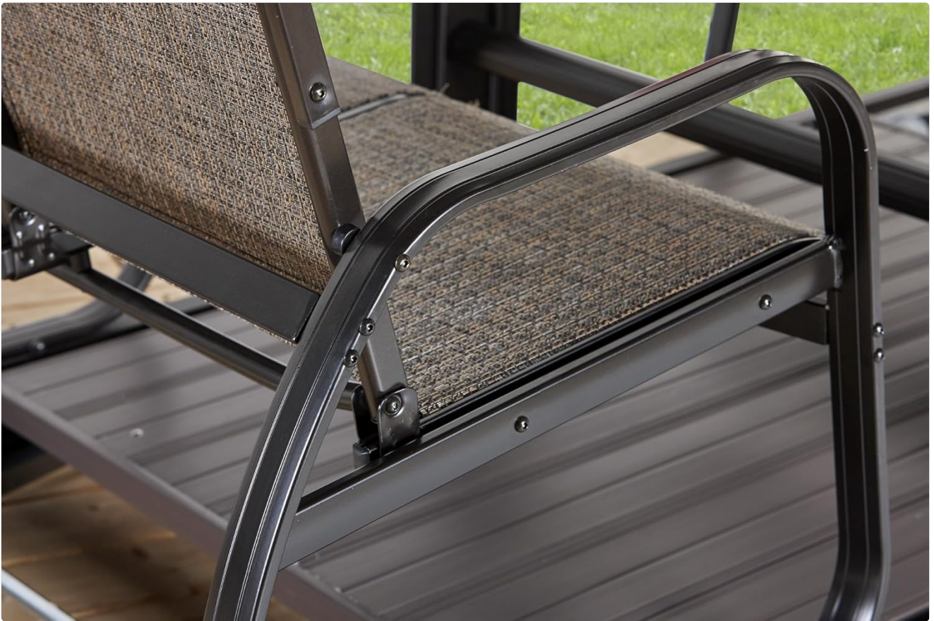
Figure 5.2: Detailed view of the swing seat and armrest. This image shows the texture of the PVC-coated polyester seat fabric and the sturdy aluminum frame of the seating unit.