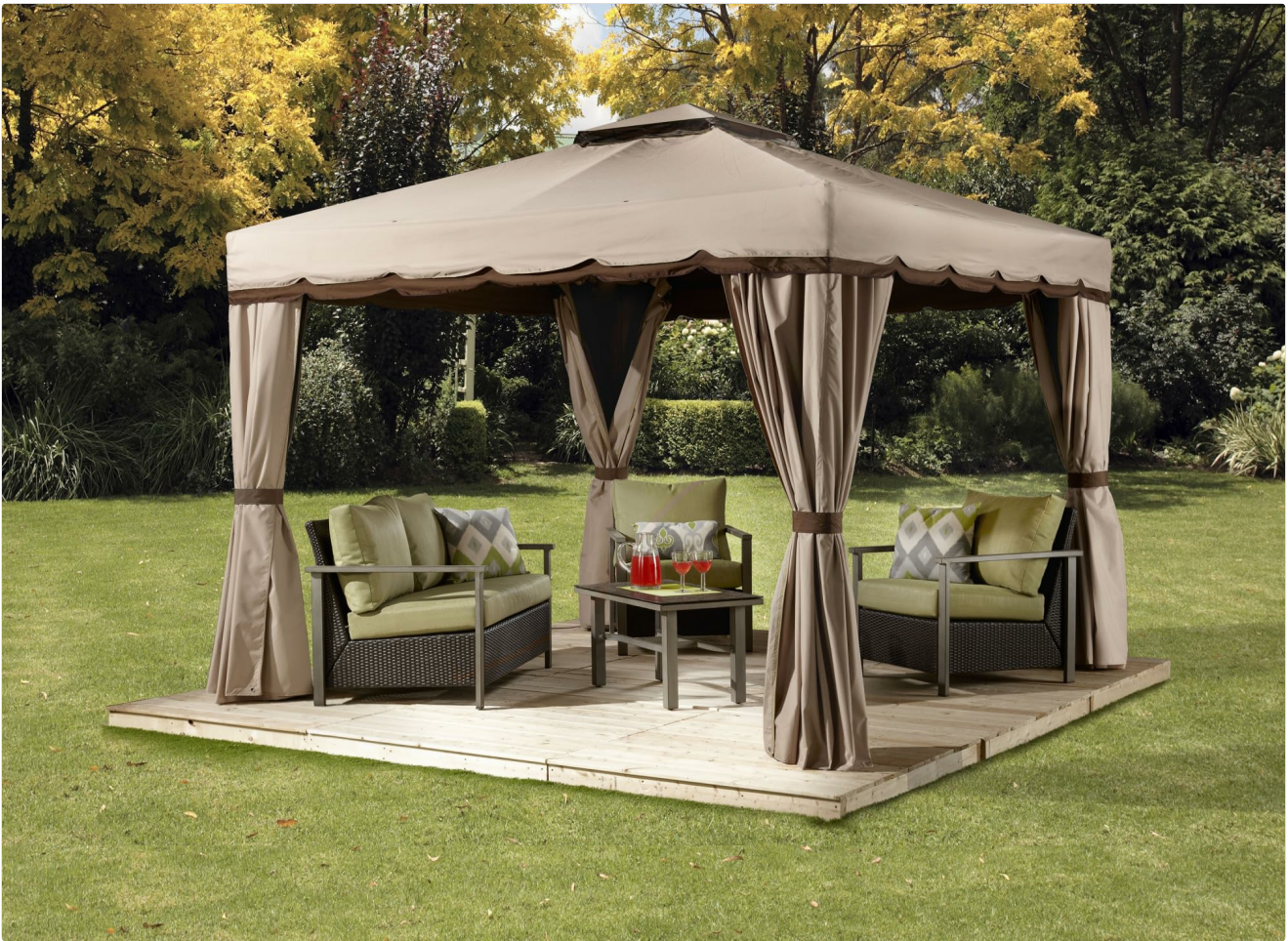
Figure 7: The fully assembled and secured Sojag Roma Gazebo.