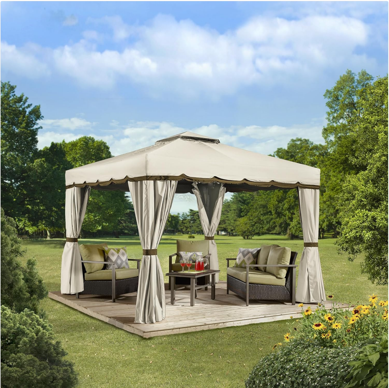
Figure 1: Assembled Sojag Roma 8 ft. x 8 ft. Gazebo with curtains and netting tied back.