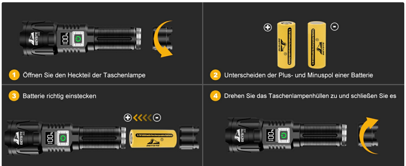
Image: A four-step visual guide demonstrating how to open the flashlight, identify battery polarity, insert the battery correctly, and re-secure the tail cap.