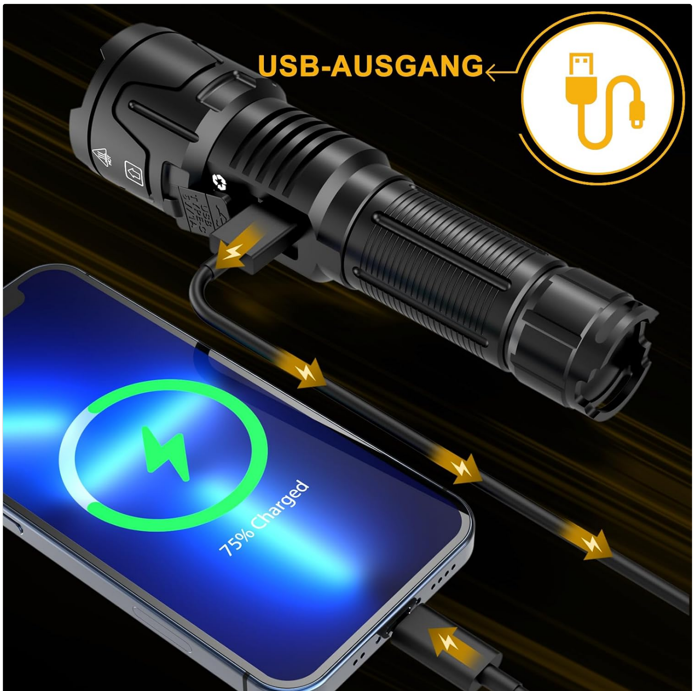
Image: The BEYSTE A09 flashlight connected to a smartphone via its USB-A output, demonstrating its functionality as an emergency power bank.