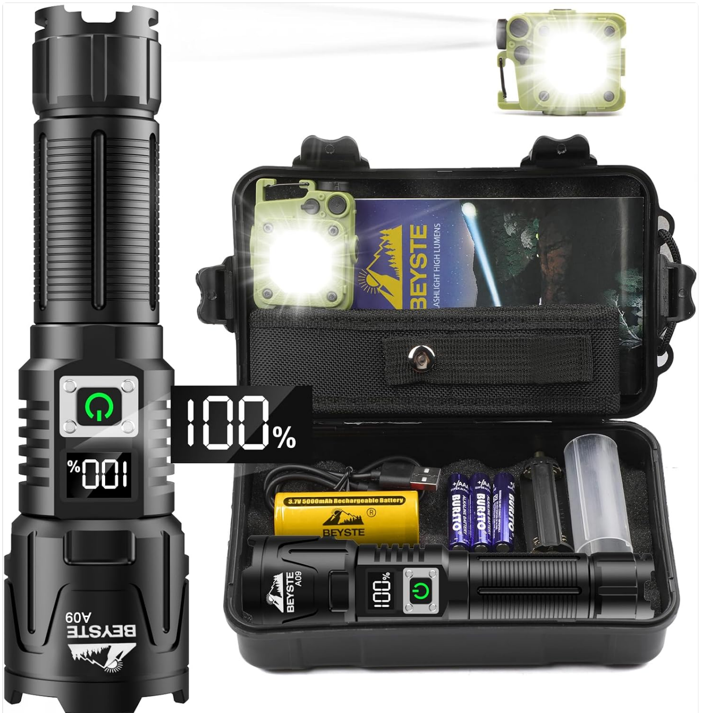
Image: The BEYSTE A09 LED Rechargeable Flashlight, its mini keychain flashlight, and included accessories neatly organized in a protective carrying case.