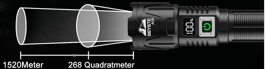
Image: An illustration demonstrating the BEYSTE A09 flashlight's ability to focus its beam up to 1520 meters and illuminate an area of 268 square meters.

Beleuchtet mühelos eine Fläche von 268 Quadratmetern