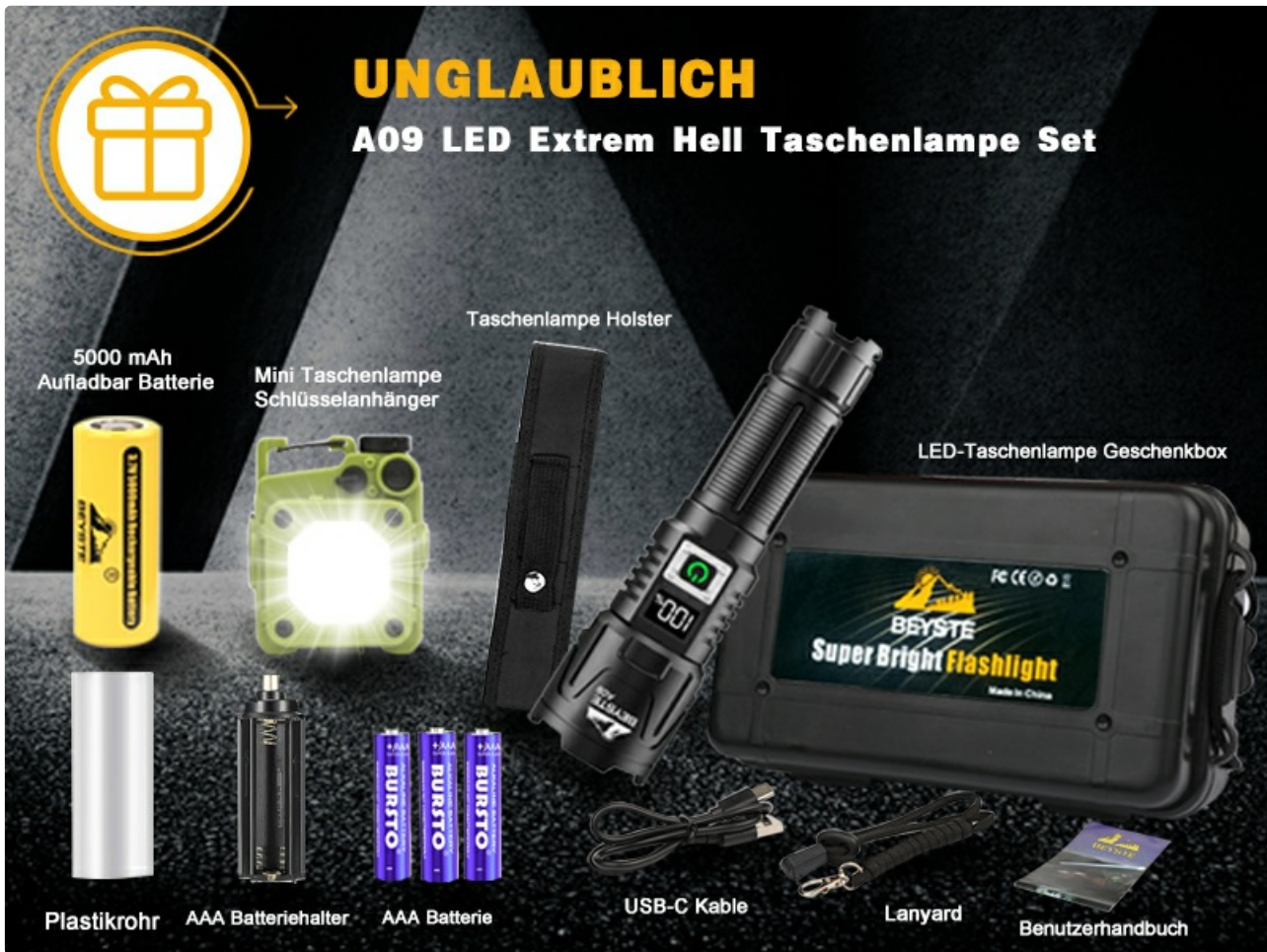
Image: A visual representation of all components included in the BEYSTE A09 LED Flashlight kit, including the main flashlight, mini flashlight, battery, cables, and accessories.