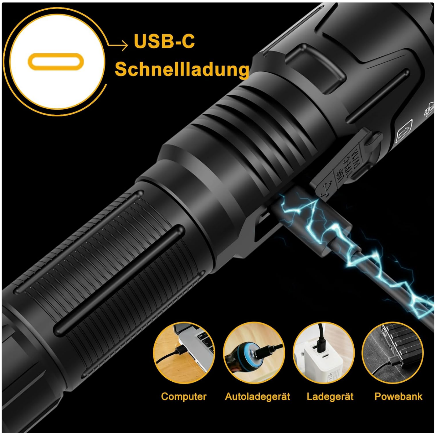
Image: The BEYSTE A09 flashlight connected via a USB-C cable to a power source, illustrating the charging process.