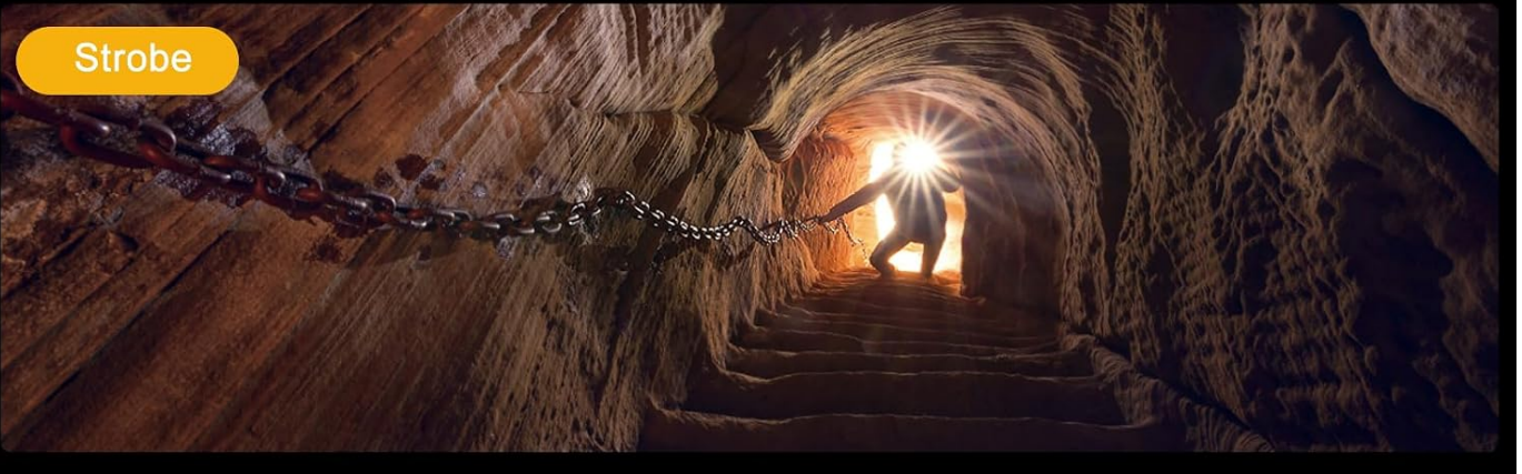
Image: The BEYSTE A09 flashlight showcasing its High, Low, and Strobe modes, along with an explanation of the quick power-off feature.