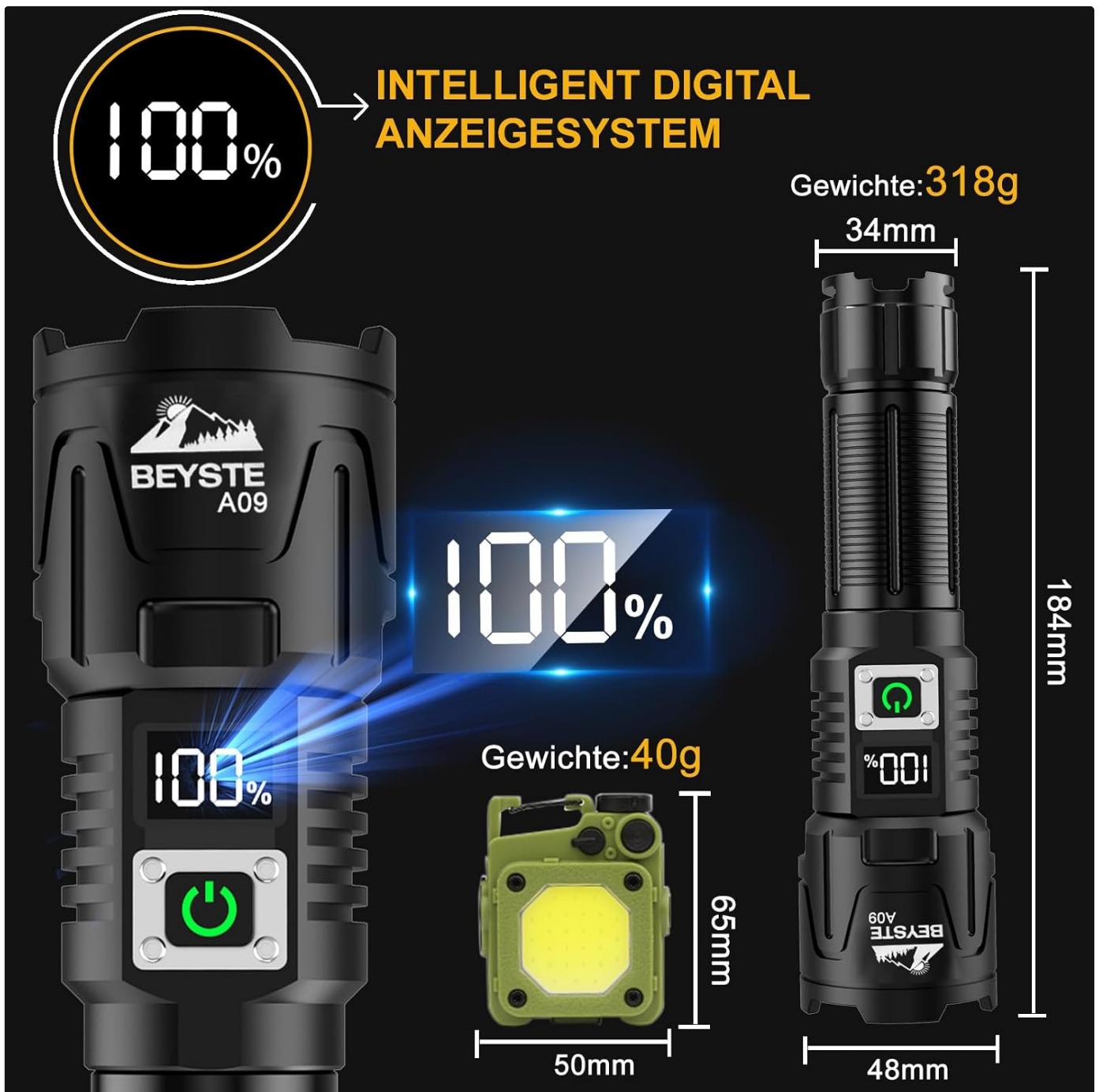
Image: A visual representation of the dimensions and weights for both the BEYSTE A09 main flashlight and the mini keychain flashlight.