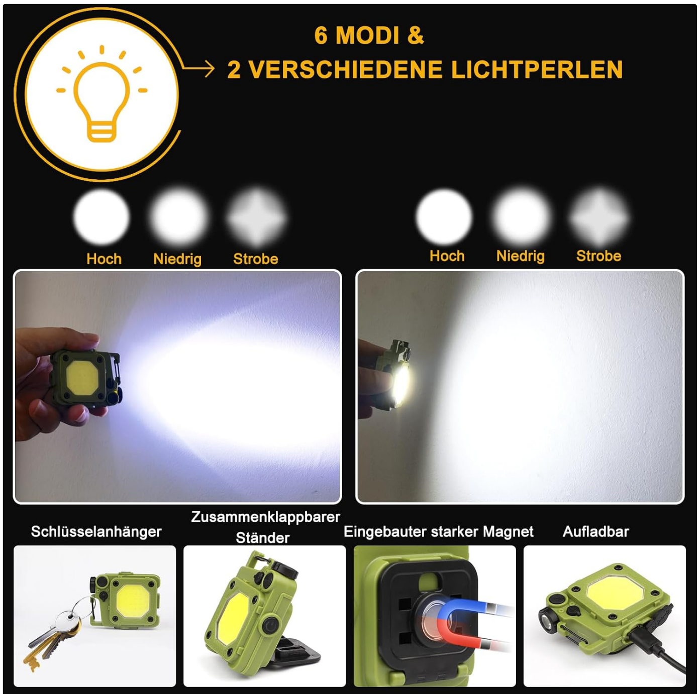
Image: A detailed view of the BEYSTE mini keychain flashlight, highlighting its 6 modes, foldable stand, built-in strong magnet, and USB-C charging port.