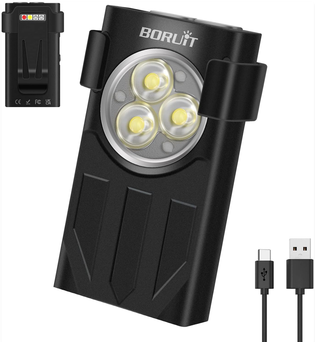
Image: BORUIT V7 flashlight and its Type-C charging cable.