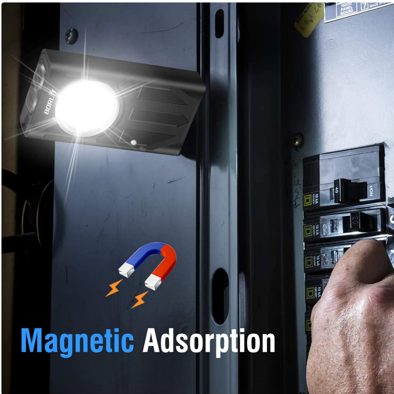
Image: BORUIT V7 flashlight utilizing its magnetic adsorption feature.