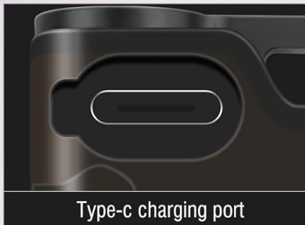
Type-c charging port