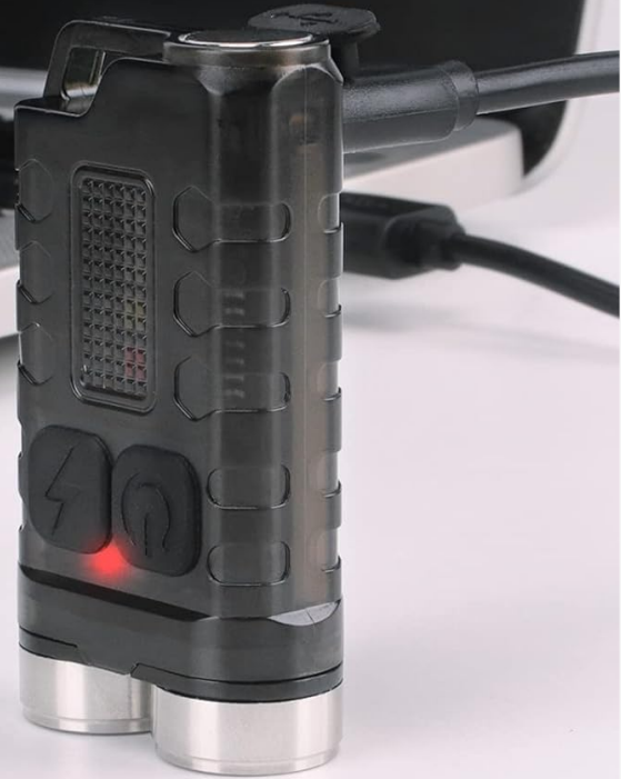
Image: BORUIT V3 flashlight charging via Type-C cable, with a red indicator light visible.