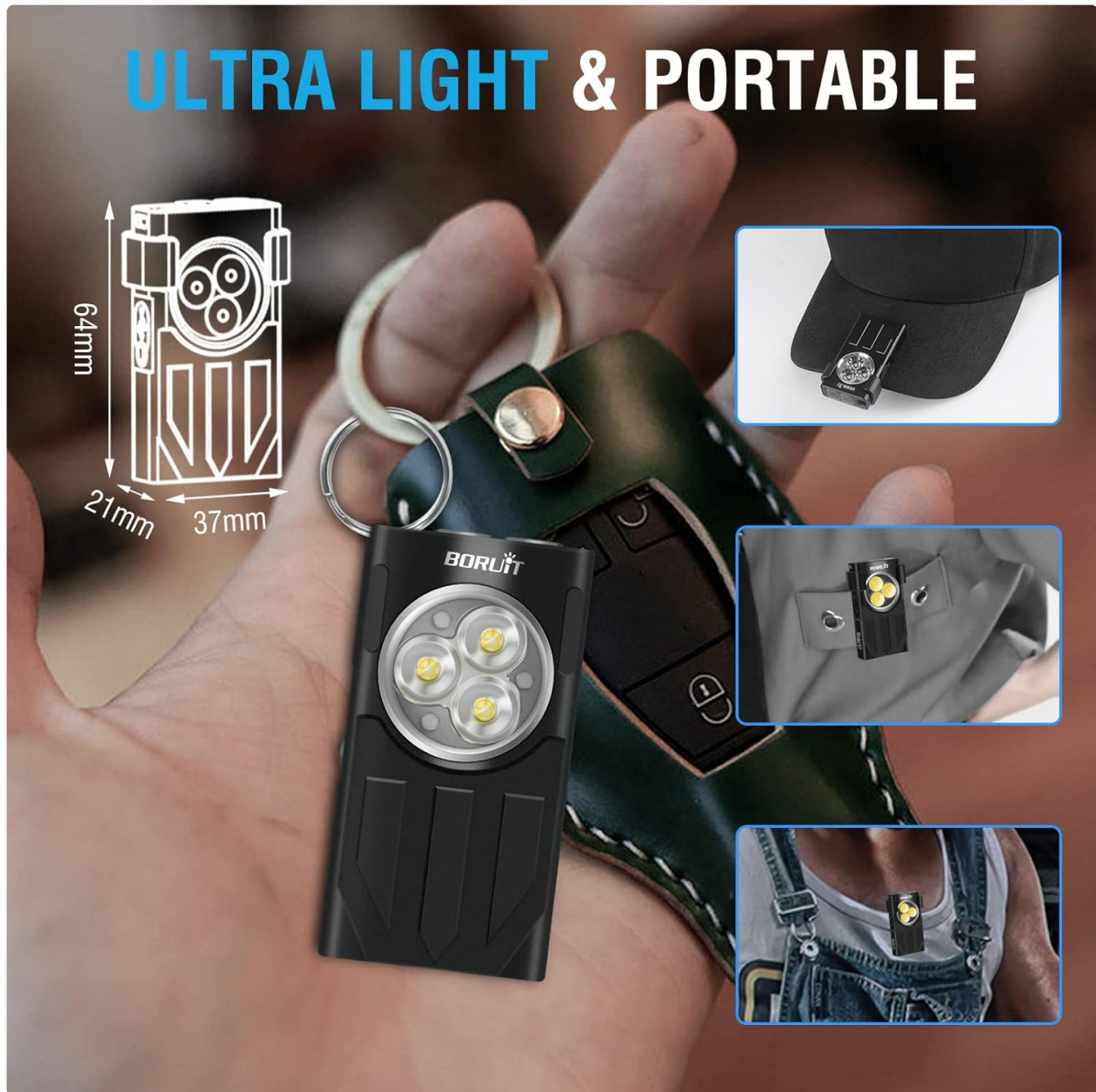
Image: BORUIT V7 flashlight demonstrating its ultra-light and portable design with clip and keychain.

The V7 flashlight includes a magnetic tail, allowing it to be attached to metallic surfaces for hands-free operation. A clip on the back enables secure attachment to pockets, straps, or hats.