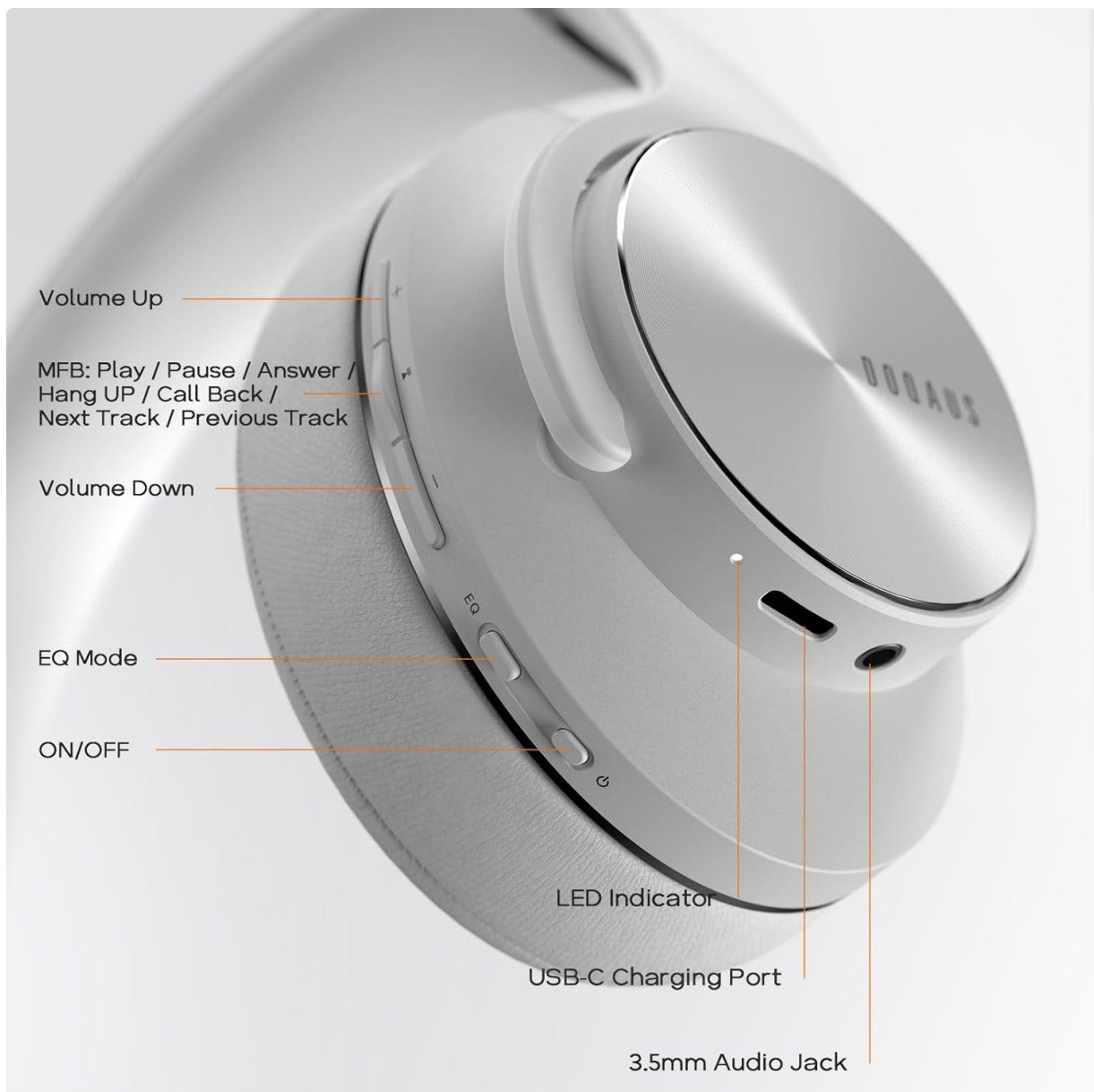
Image: Detailed view of the right earcup, highlighting the control buttons and ports including Volume Up/Down, Multi-Function Button (MFB), EQ Mode button, ON/OFF switch, LED indicator, USB-C charging port, and 3.5mm audio jack.