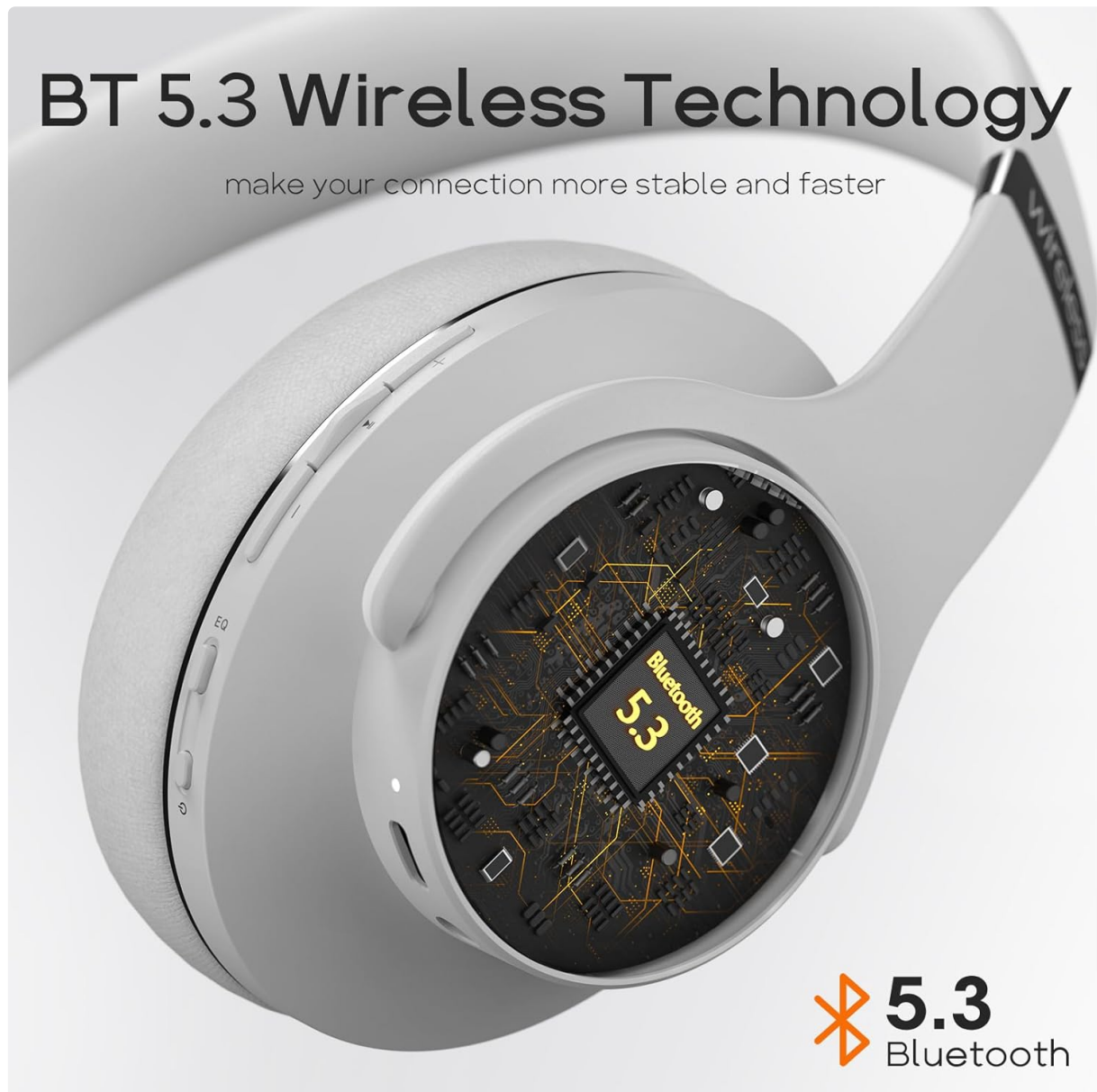
Image: Illustration of DOQAUS LIFE 3 headphones connecting via Bluetooth 5.3 to a mobile device, emphasizing stable and faster connection.

The DOQAUS LIFE 3 headphones feature Bluetooth 5.3 for stable transmission and enhanced audio quality. They also support multi-device pairing.