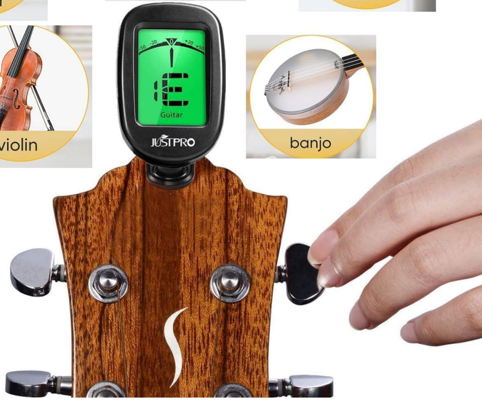
Image: The JUSTPRO JP-Gre Clip-On Tuner, a compact device with a digital display, is shown clipped onto the headstock of an acoustic guitar. The tuner's screen is visible, indicating its readiness for use.