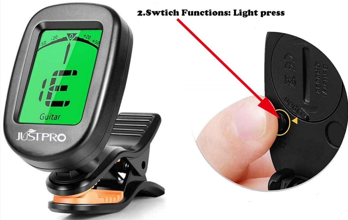
Image: The JUSTPRO JP-Gre tuner's display shows different instrument modes, including guitar, ukulele, bass, violin, and banjo, demonstrating its multi-instrument compatibility.