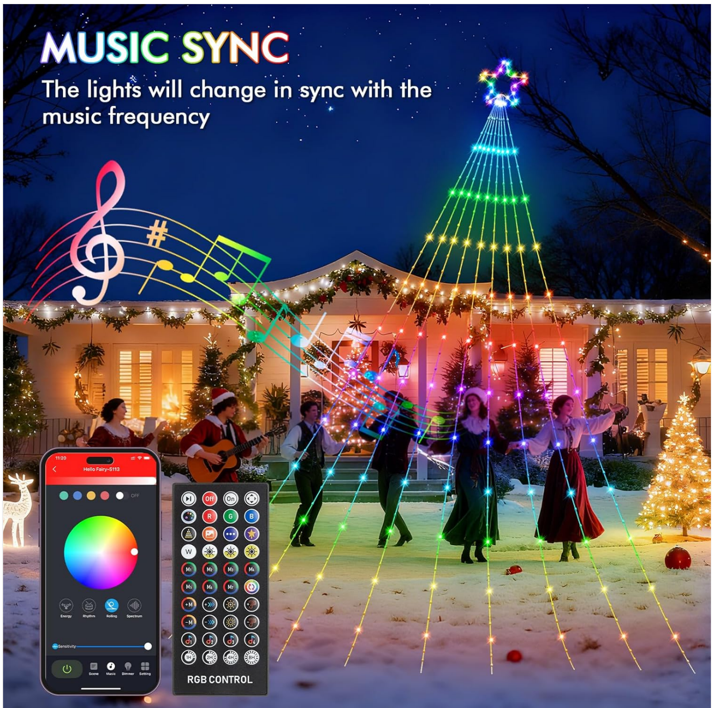
Image: HOLILLUMA Waterfall String Lights displaying a music sync effect, with musical notes overlaid on the image. The lights change rhythmically with music, creating a dynamic display.

Your browser does not support the video tag.