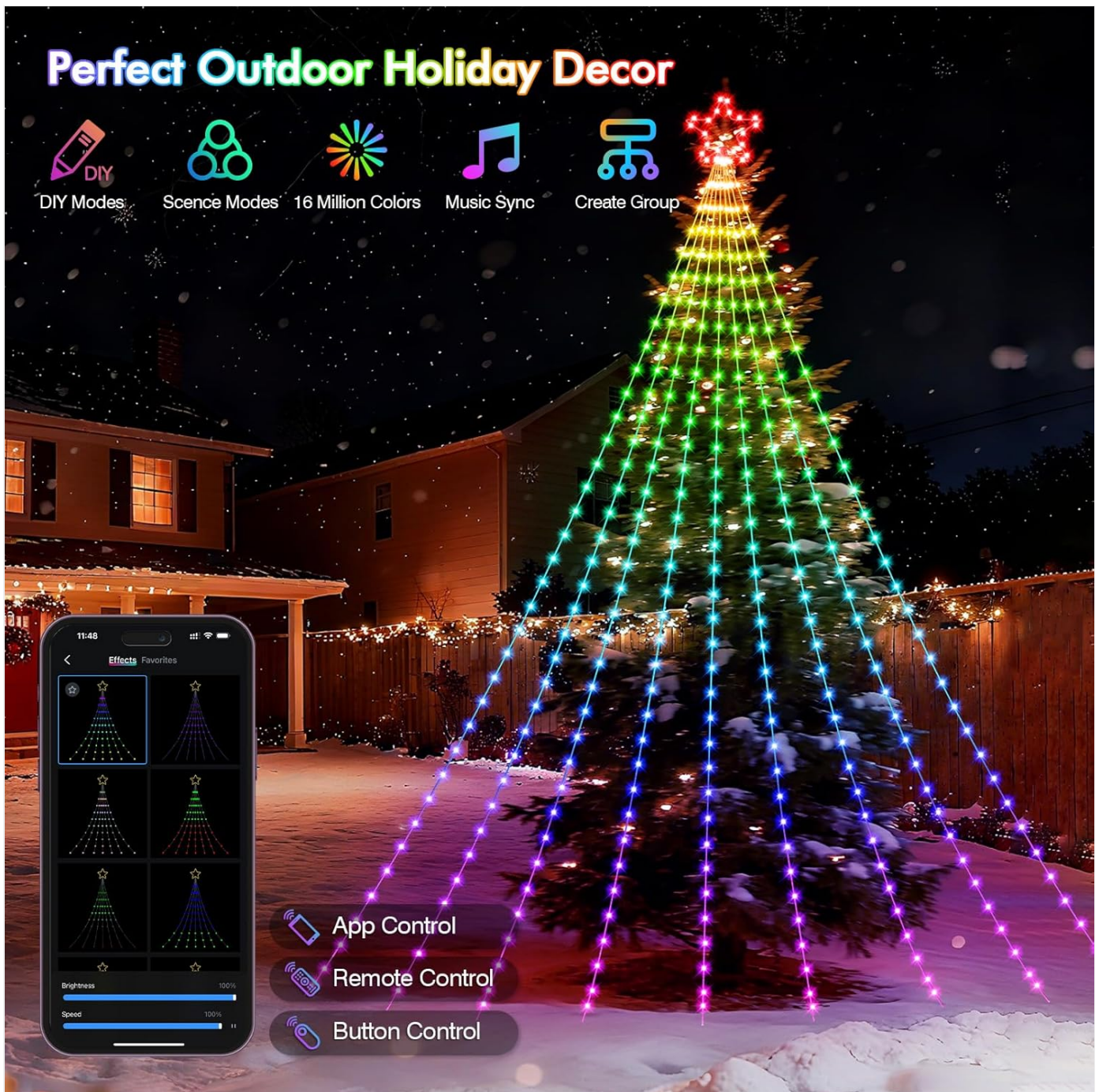
Image: HOLLILUMA 11.8FT Smart RGB Color Changing Christmas Waterfall String Lights installed on a tree at night, showing app and remote control options. The lights are arranged in a tree shape, with a smartphone displaying the "Hello Fairy" app interface and a physical remote control.