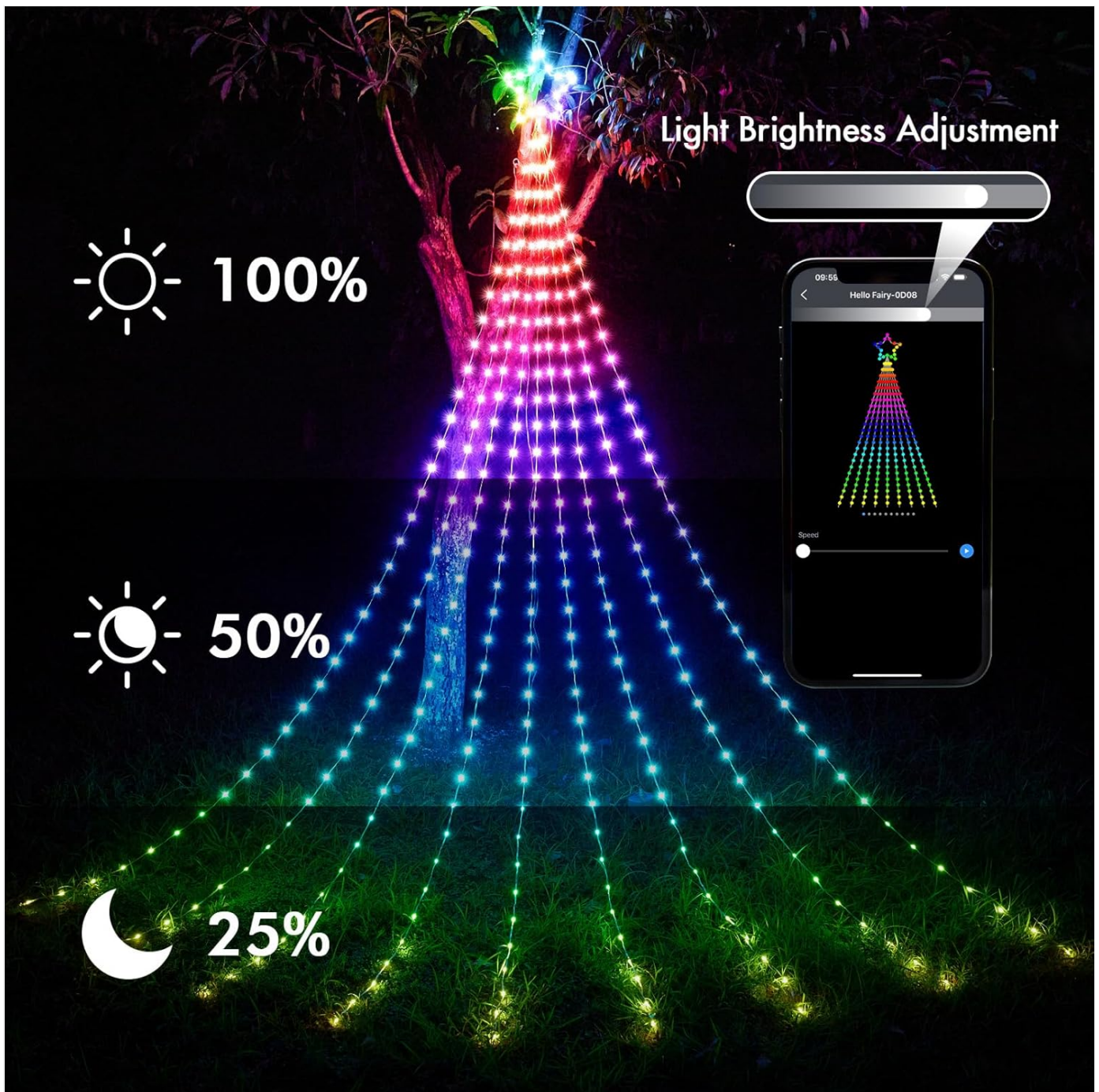
Image: HOLILLUMA Waterfall String Lights with the star topper displaying different colors, indicating independent control. The star can be set to warm white or synchronize with the main lights.