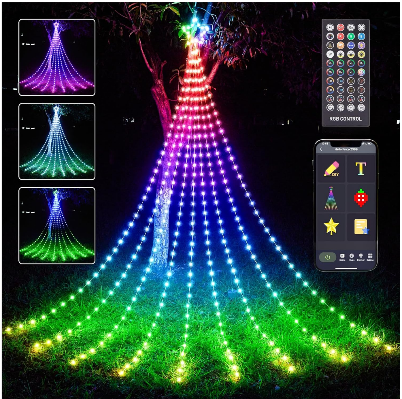
Image: HOLILLUMA 11.8FT Smart RGB Color Changing Christmas Waterfall String Lights installed on a tree at night, showcasing various color patterns. The image displays the star topper and the cascading light strands.