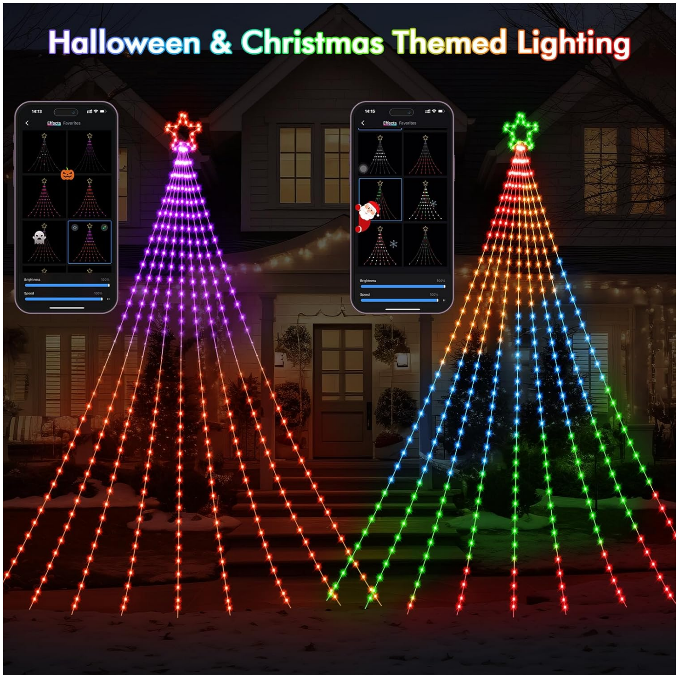
Image: Smartphone screen showing the 'Hello Fairy' app interface with various DIY and preset lighting options for the HOLILLUMA Waterfall String Lights. The app allows for customization of colors, patterns, and effects.