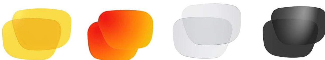
Image: OhO Camera Glasses with various interchangeable lenses, including blue, yellow, red, clear, and dark polarized options.