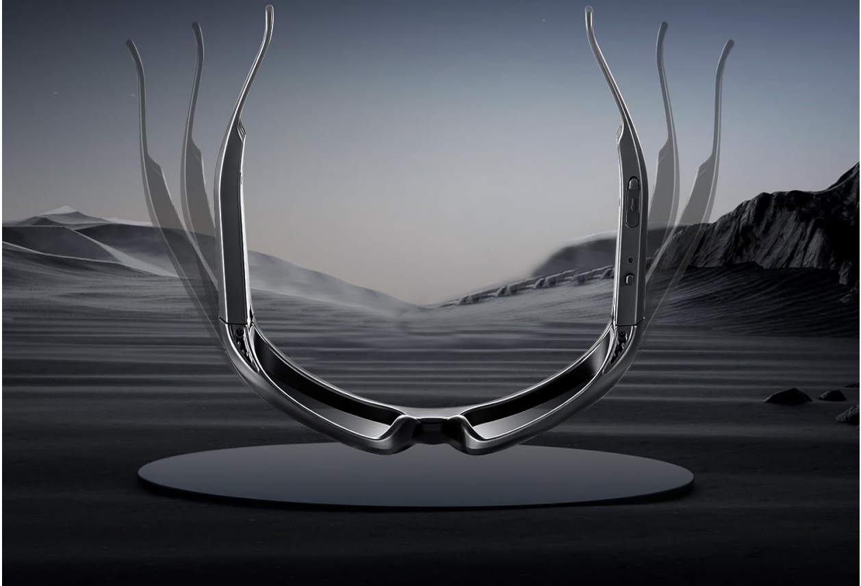
Image: The frame of the OhO Camera Glasses bending to show the flexibility of the TR90 Technical Material, designed for light and comfortable wear.

New Technology Material to Keep Glasses Light and Flexible to Wear All Day