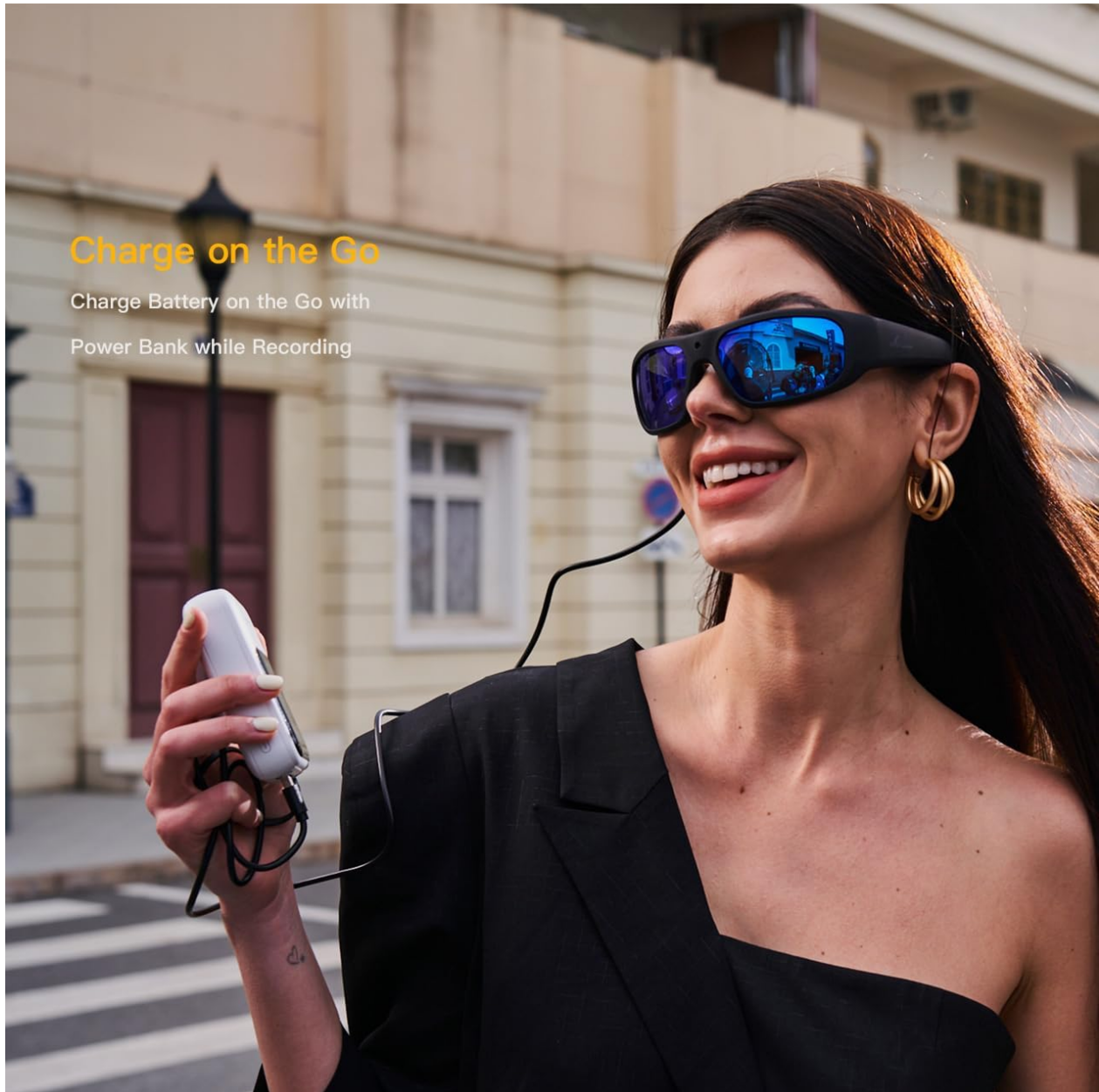
Image: A woman wearing the OhO Camera Glasses, connecting them to a white power bank via a cable, demonstrating the 'Charge on the Go' feature.

Before first use, fully charge your OhO Camera Glasses. Connect the included USB cable to the charging port on the glasses and to a power source. The battery has a working life of approximately 30 minutes on a single charge. The camera can operate while being recharged using a power bank.