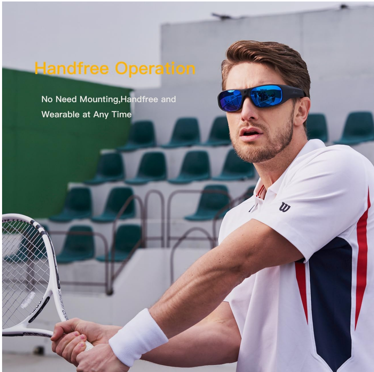
Image: A man wearing the OhO Camera Glasses while playing tennis, highlighting the handfree operation feature.

The OhO Camera Glasses feature a simple one-button touch operation for ease of use. A single touch allows you to turn the device on, turn it off, or take a picture. When the camera starts, takes pictures, or stops, the sunglasses provide a vibration alert and an LED light indicator for feedback.