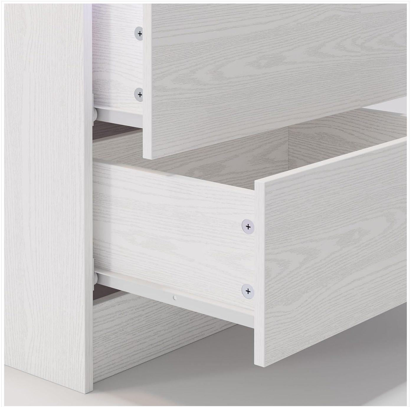
Image: A close-up view of the nightstand's drawer, showing the smooth glide mechanism and internal construction.