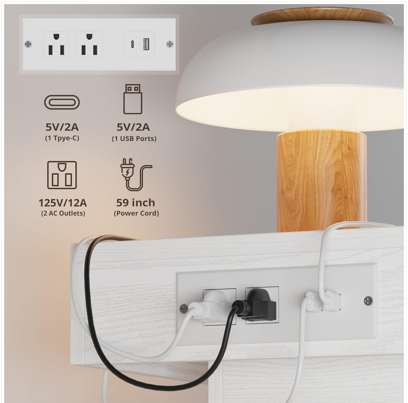
Image: Detailed view of the nightstand's charging station, showing two AC outlets, one USB-A port, and one USB-C port.