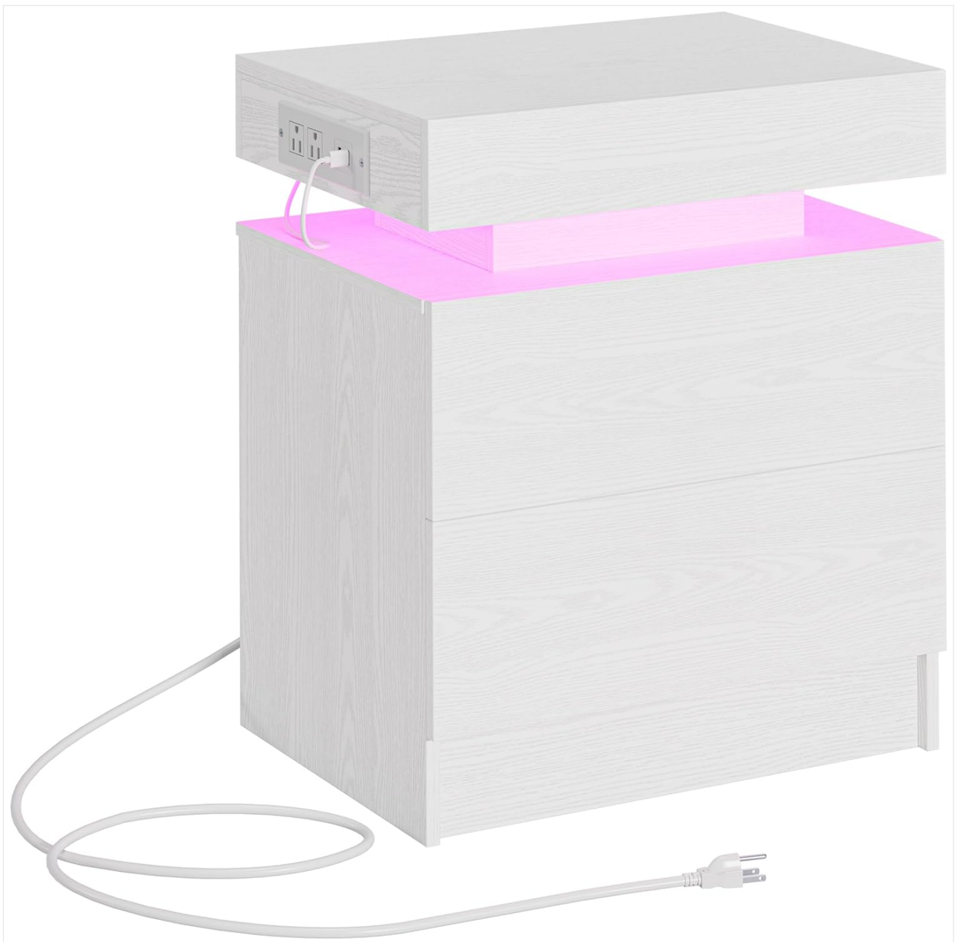
Image: The LIKIMIO Night Stand with Charging Station, featuring a white finish and integrated LED lighting.