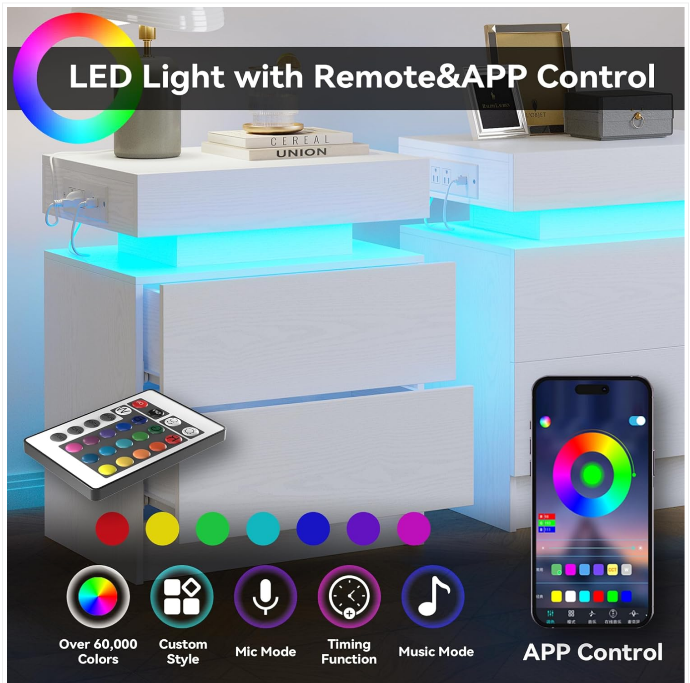
Image: The nightstand showcasing its LED lighting, alongside the remote control and a smartphone displaying the control app interface.