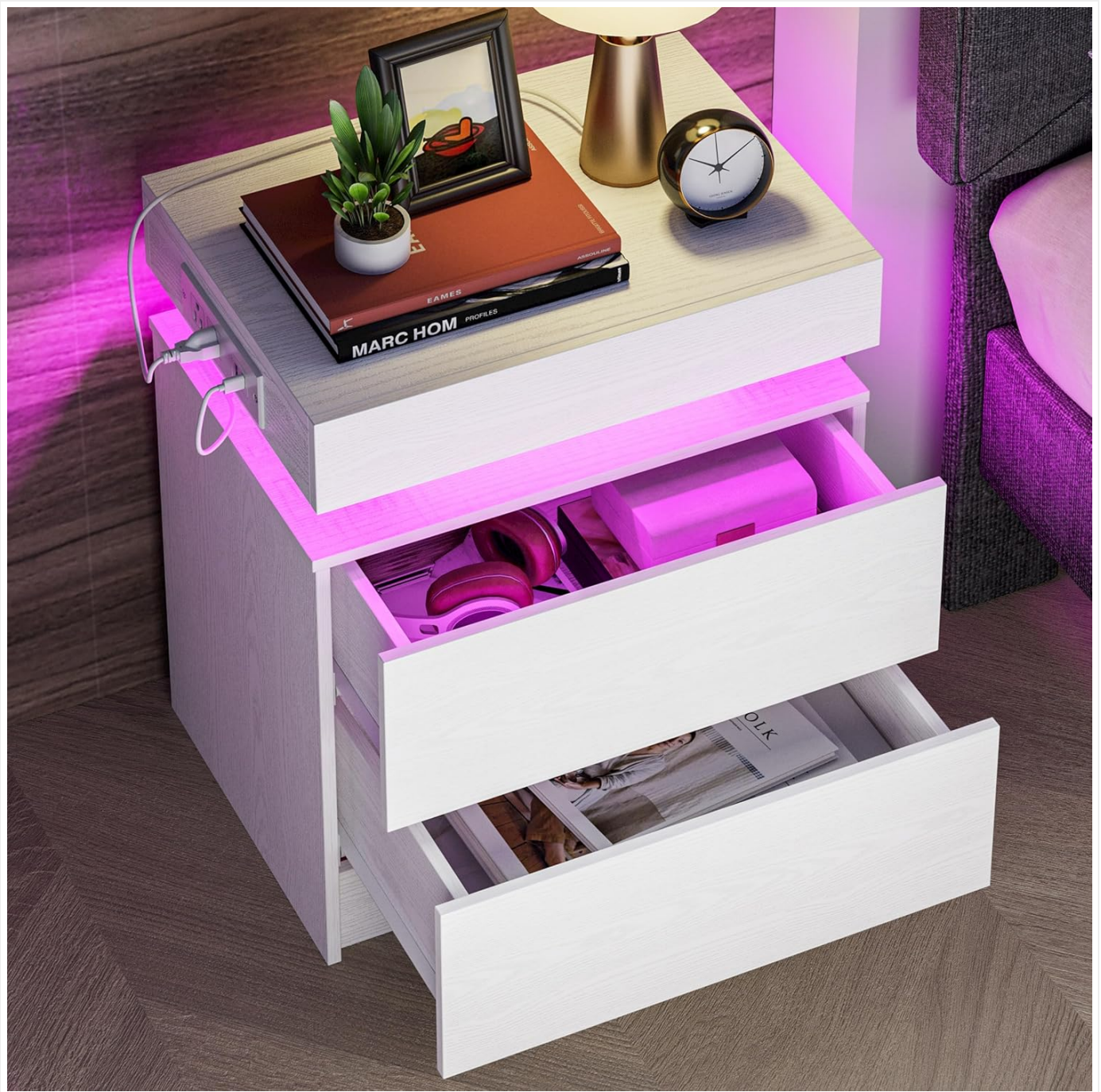
Image: The nightstand with both drawers partially open, revealing interior storage space and items like headphones and books.