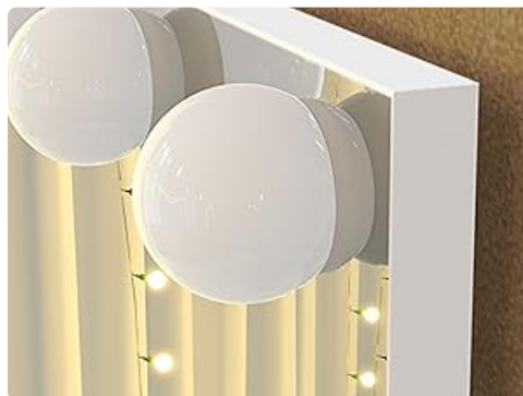
Image: A close-up of the 10x magnifying mirror, showing its suction cup attachment to the main mirror for detailed viewing.

The included 10x magnifying mirror can be attached to the main mirror surface using its suction cups for detailed makeup application or grooming. It can be easily removed and repositioned as needed.