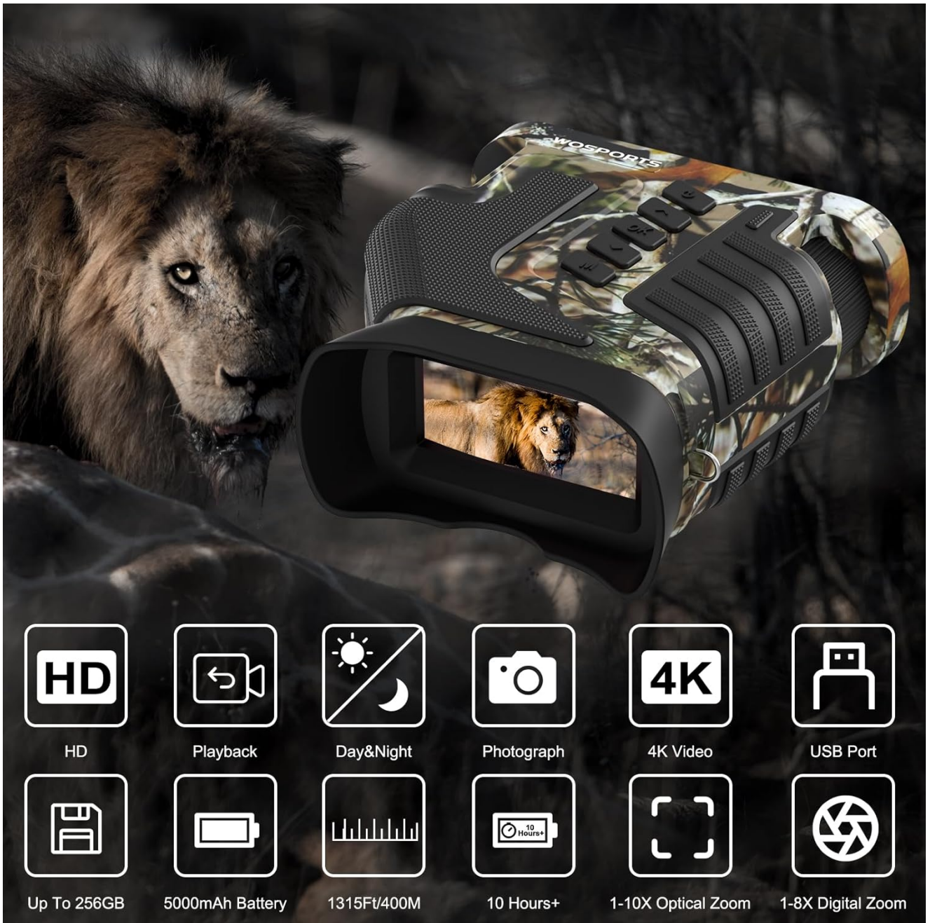
Image: Overview of key features including 4K video, 16MP photos, and zoom capabilities.