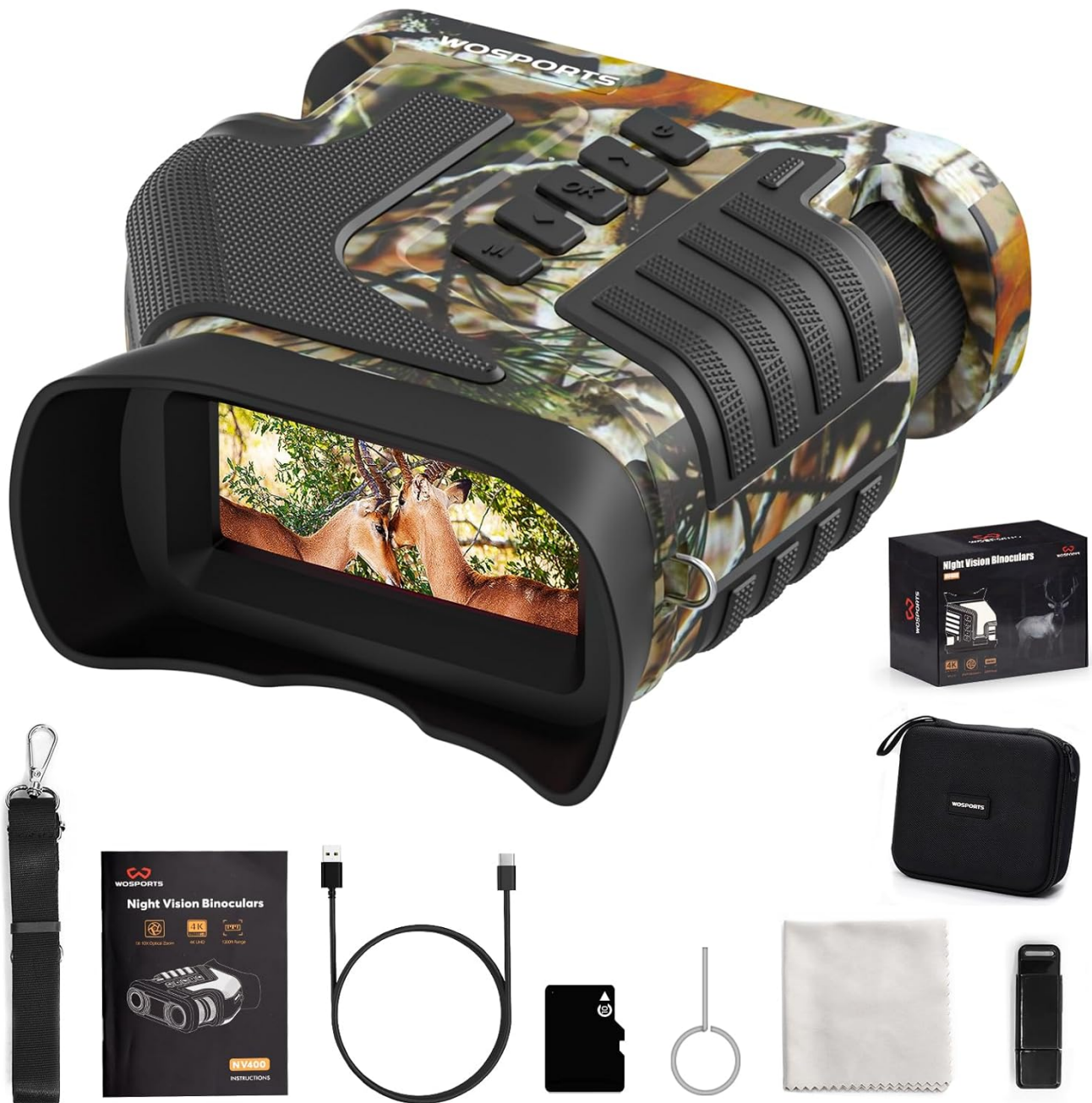
Image: WOSPORTS NV400-CAMO Night Vision Binoculars with all components.