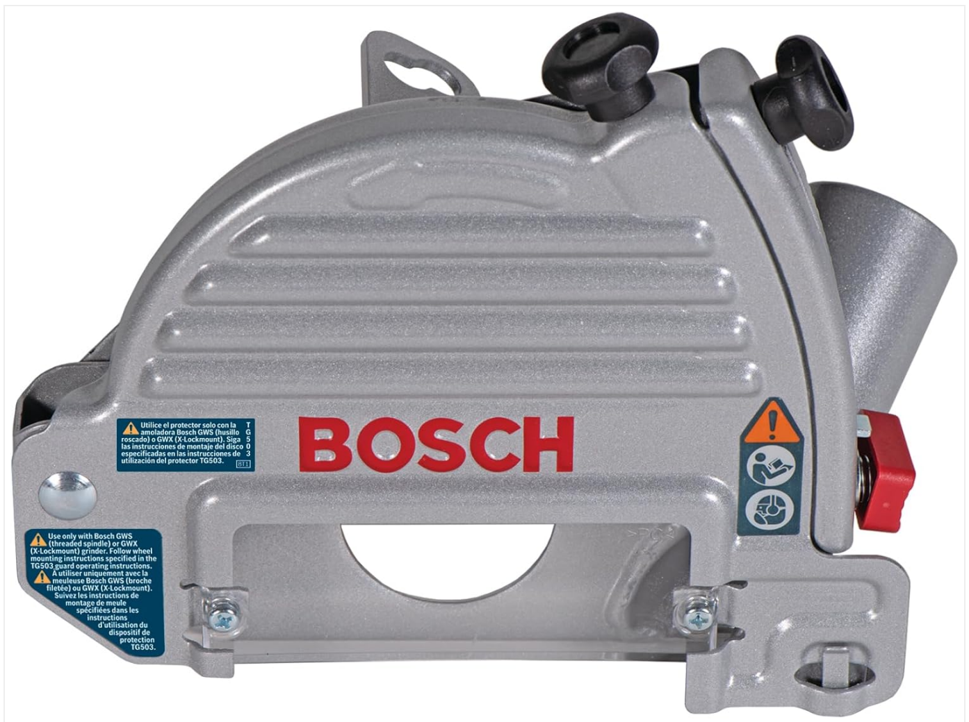
Figure 2: Side view of the BOSCH TG503 Tuckpointing Dust Guard, highlighting the spring-loaded mechanism and adjustment knobs.