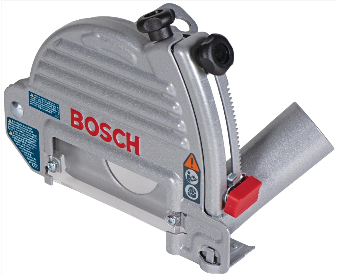
Figure 1: Front view of the BOSCH TG503 Tuckpointing Dust Guard, showing the Bosch logo and dust port.