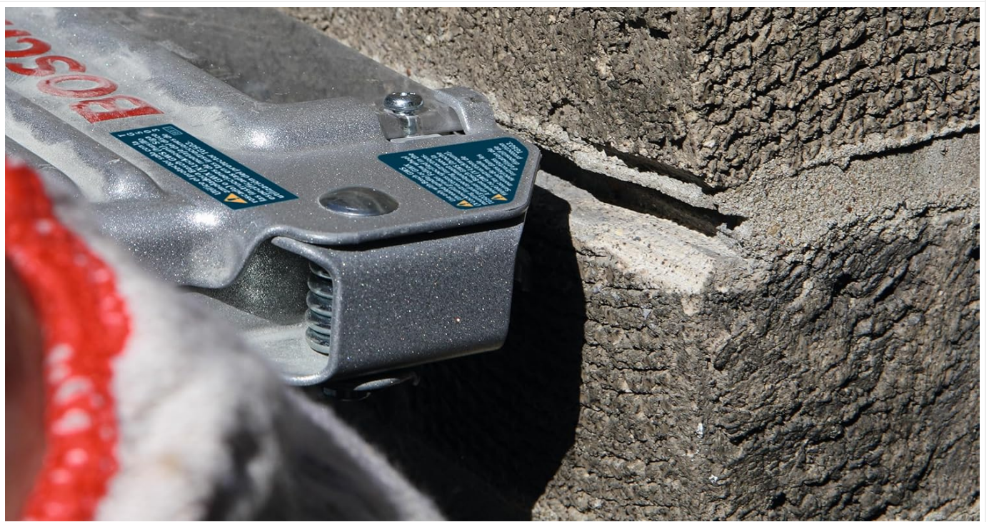
Figure 5: A close-up view demonstrating the precision of a tuckpointing cut being made with the BOSCH TG503 dust guard, showing the clean line created.