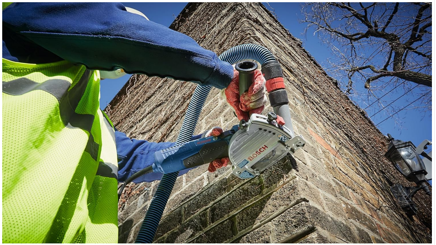
Figure 3: An operator using the BOSCH TG503 dust guard attached to an angle grinder, connected to a dust extractor, performing tuckpointing on a brick wall.