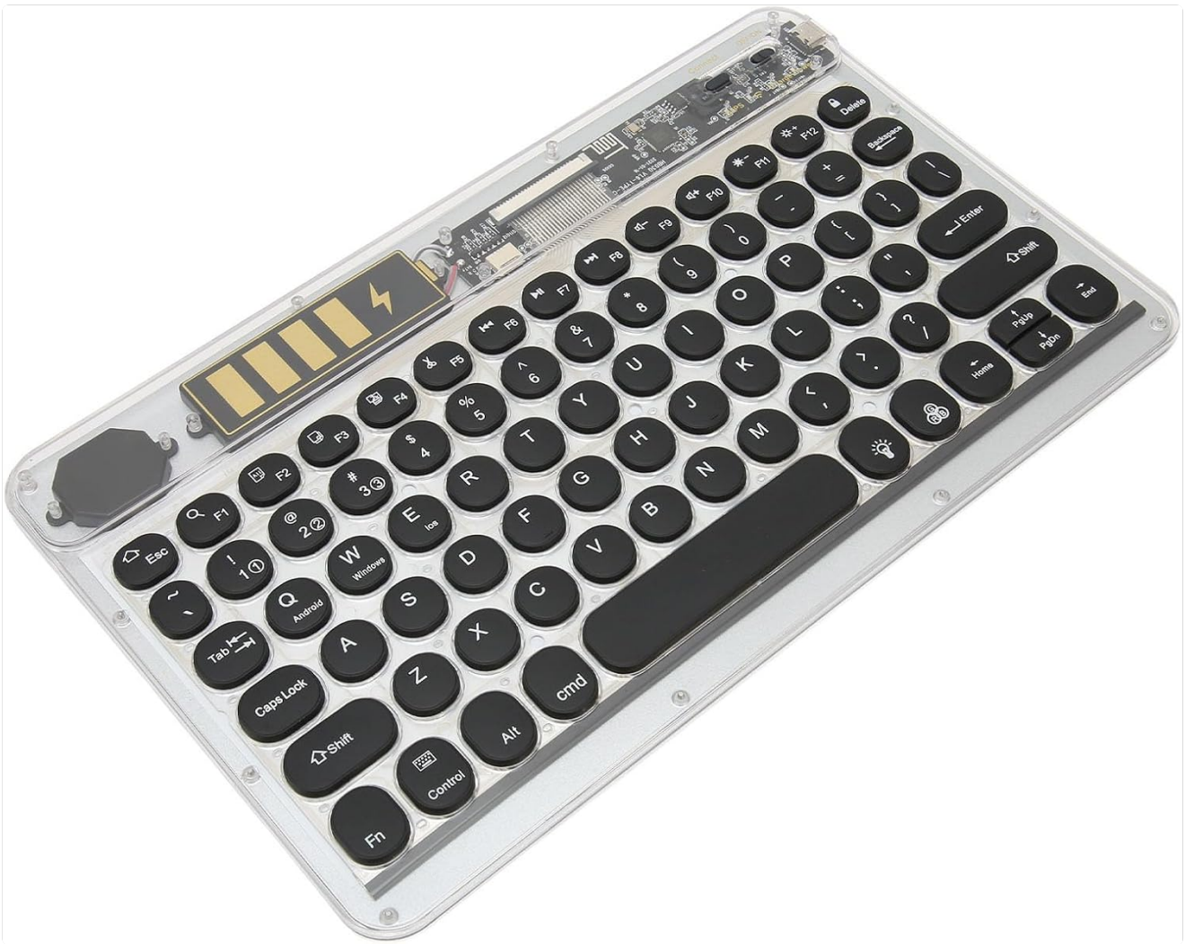
Figure 2.1: Top-down view of the keyboard, showcasing its transparent design and key layout.