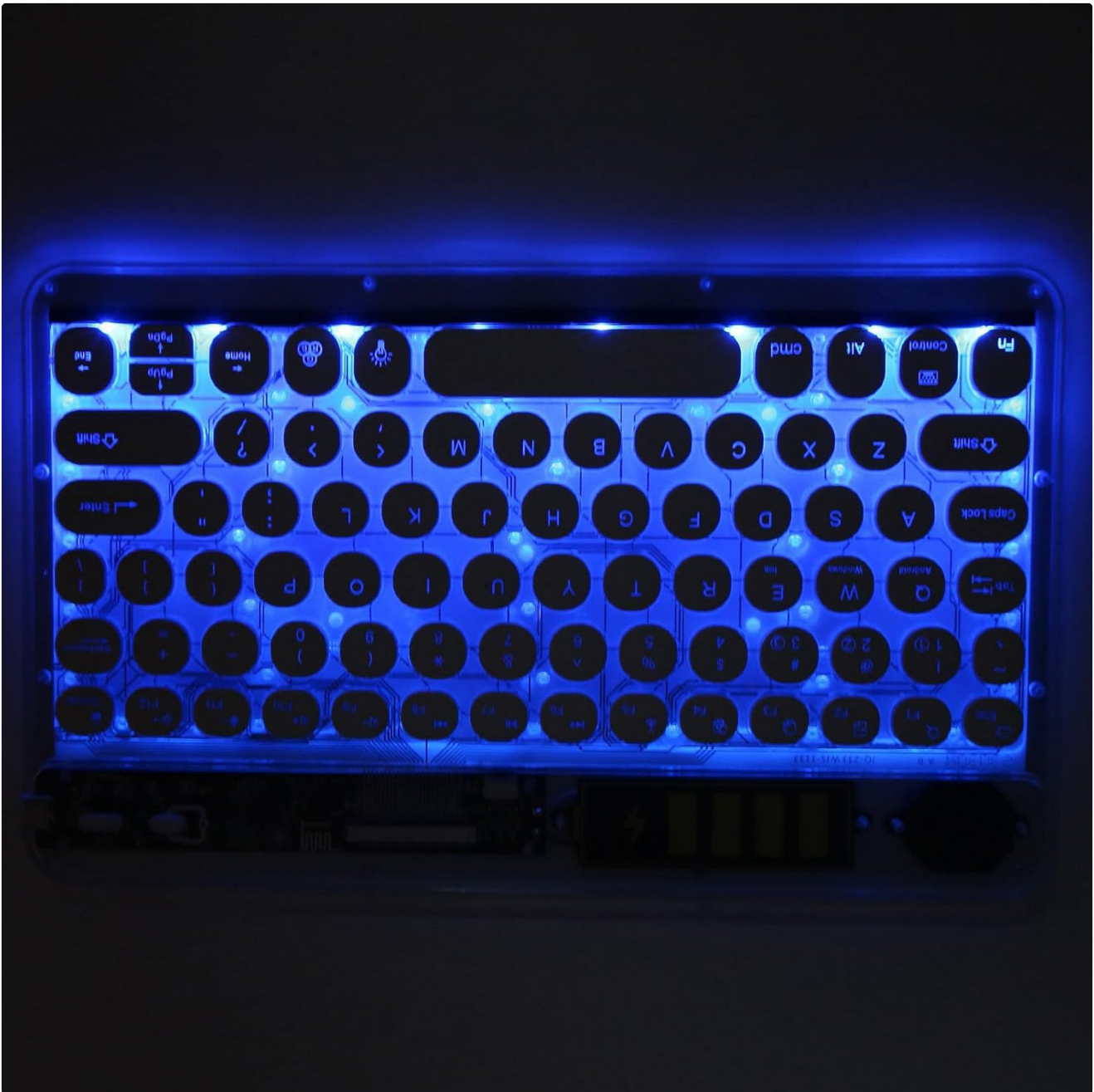
Figure 2.6: The keyboard with its RGB backlighting illuminated in blue.