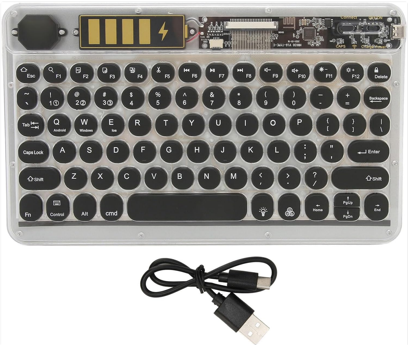
Figure 2.9: The keyboard displayed next to its included USB charging cable.