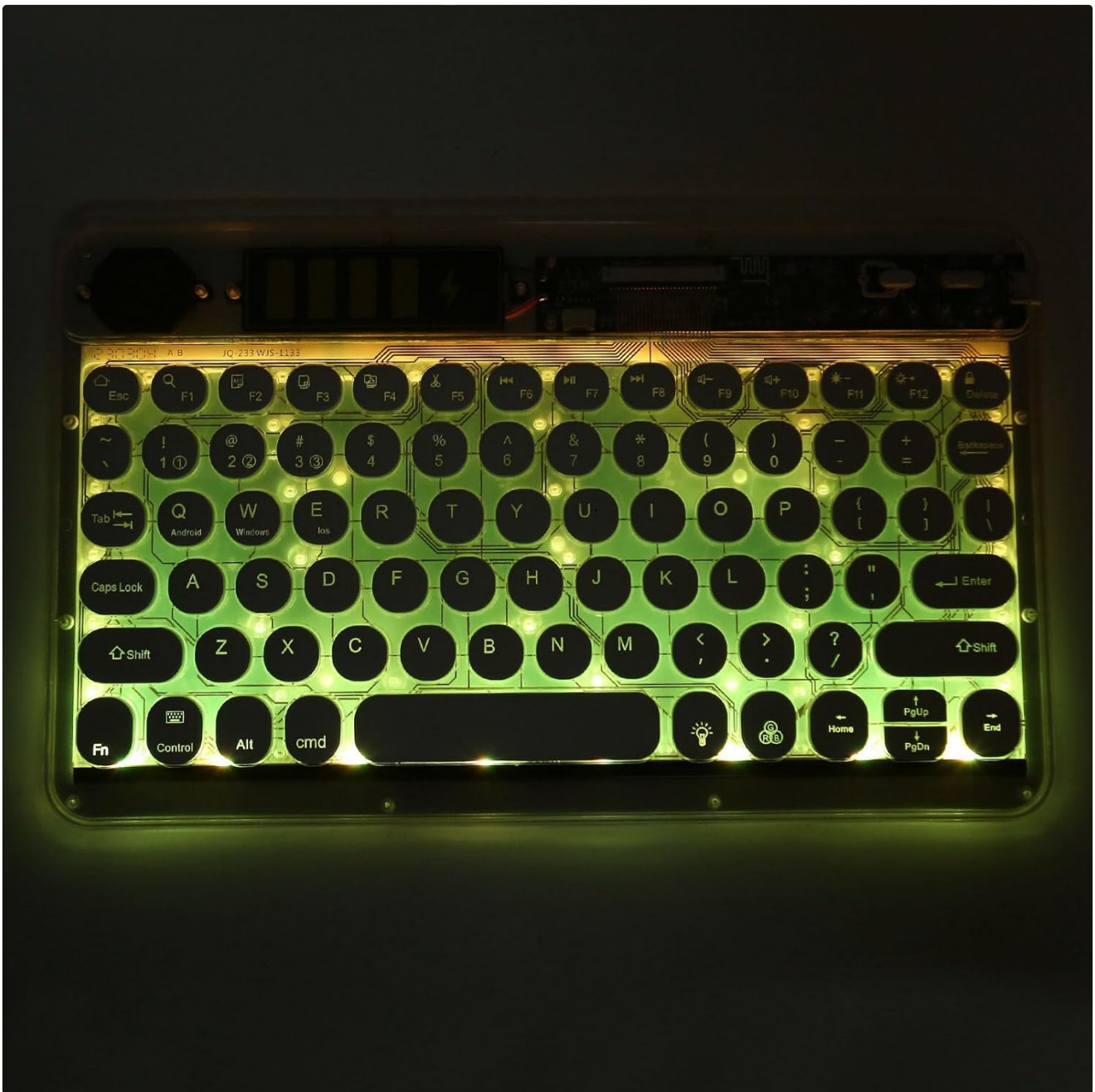
Figure 2.5: The keyboard with its RGB backlighting illuminated in green.