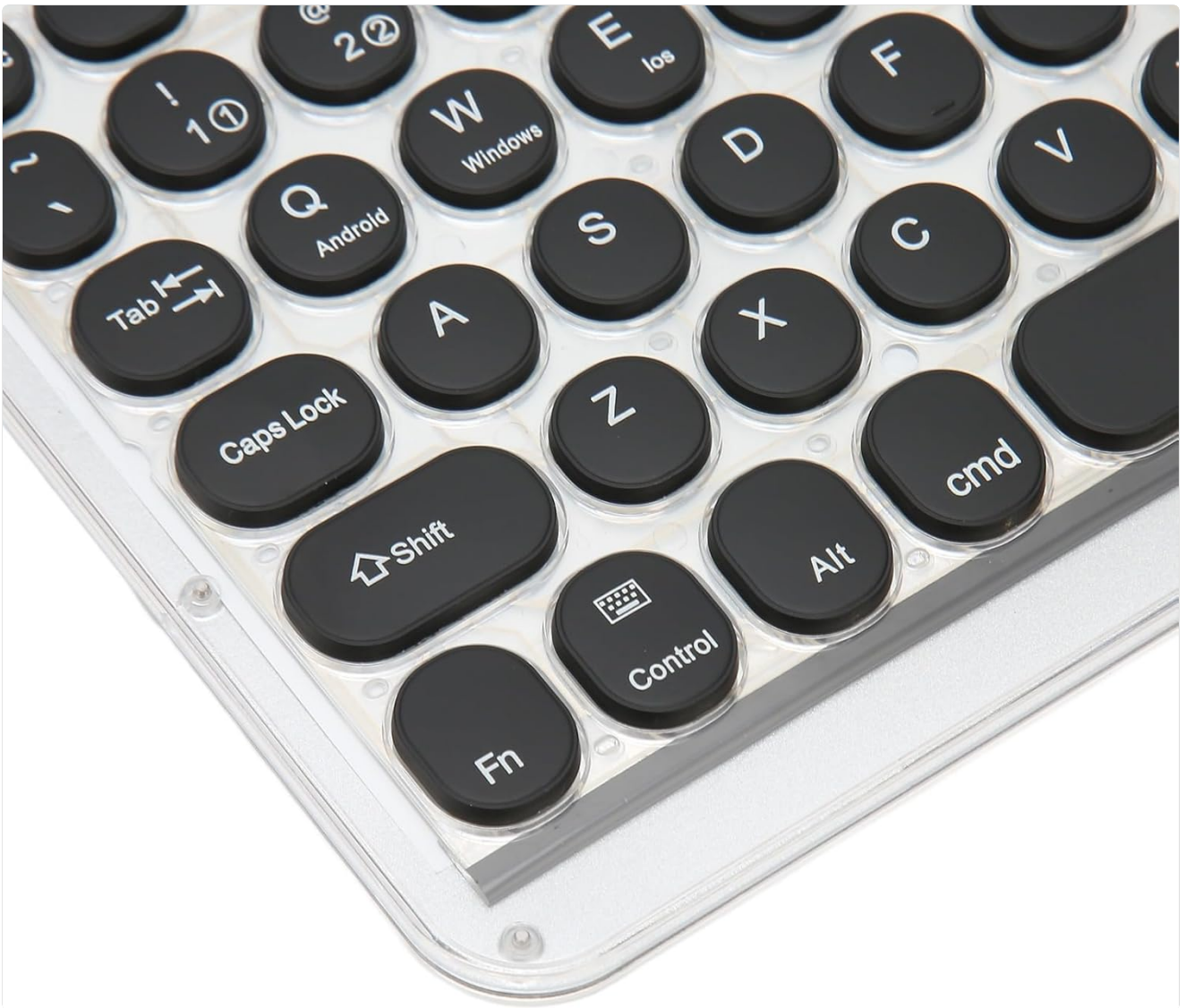
Figure 2.7: Close-up view of the keyboard's transparent keycaps and the rounded black keys.