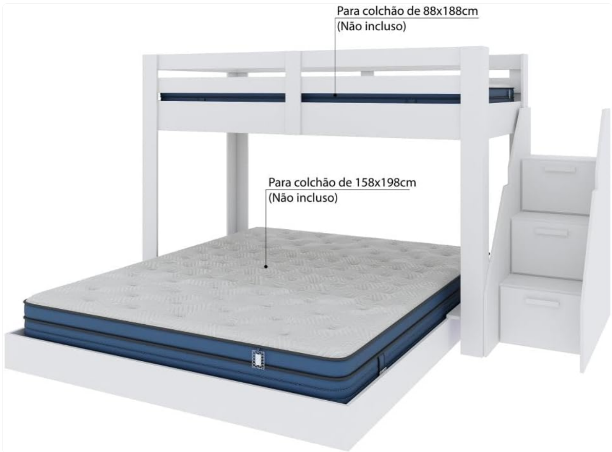
Figure 5.2: Recommended mattress sizes.