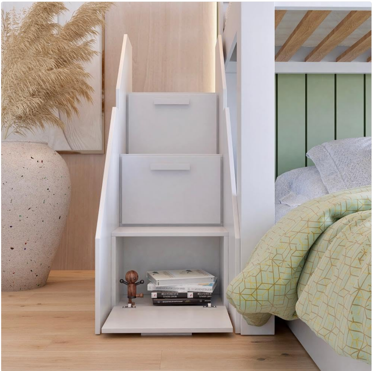
Figure 5.3: Integrated staircase with open storage compartments.