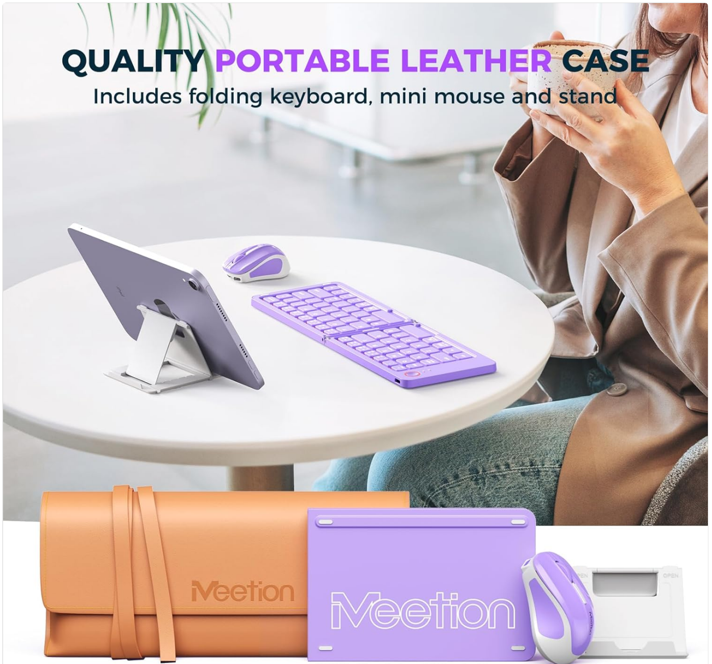
Image: The individual components of the MEETION Foldable Keyboard and Mouse Combo laid out, including the purple foldable keyboard, purple mini mouse, white stand holder, and brown portable leather case.

Includes folding keyboard, mini mouse and stand