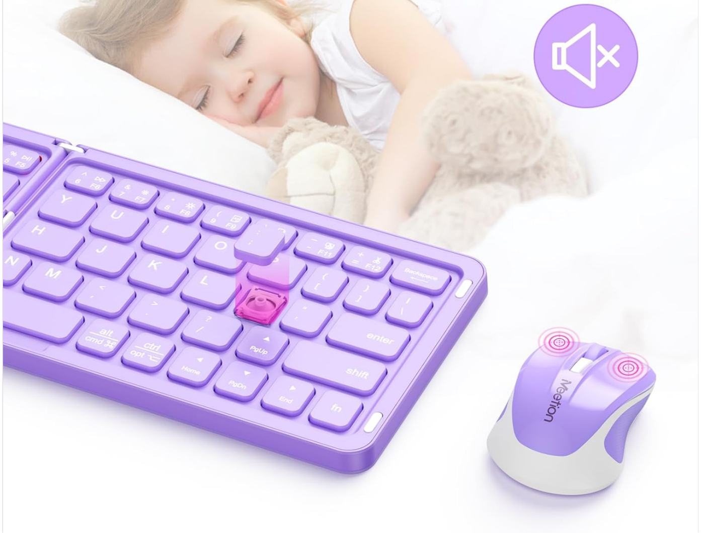
Image: A close-up of the purple foldable keyboard and mini mouse, emphasizing their quiet typing and clicking features, with a graphic indicating silence and a sleeping child in the background.