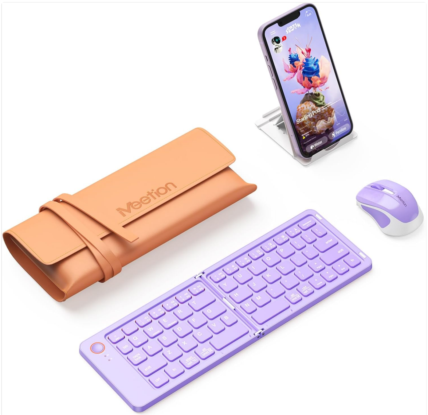
Image: The complete MEETION Foldable Keyboard and Mouse Combo, including the purple foldable keyboard, purple mini mouse, a brown leather carrying case, and a white phone/tablet stand, alongside a smartphone.