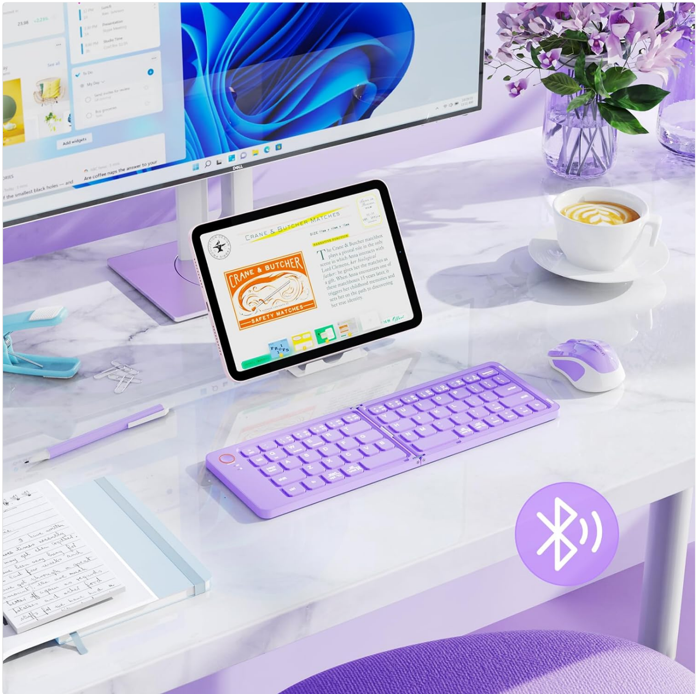
Image: The purple foldable keyboard and mini mouse in use on a desk, connected via Bluetooth to a tablet placed on the stand holder, with a desktop monitor in the background.