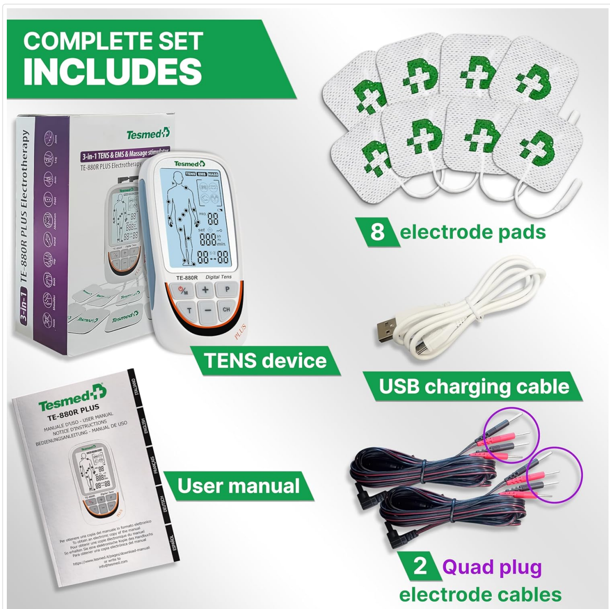
Figure 3.1: Contents of the TESMED TE-880R Plus package, including the TENS device, user manual, two quad plug electrode cables, eight electrode pads, and a USB charging cable.