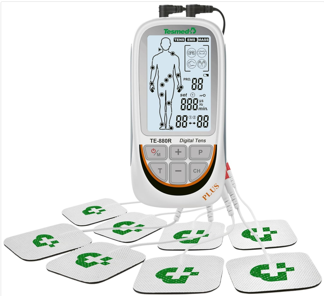
Figure 4.1: TESMED TE-880R Plus TENS unit with eight electrode pads connected, showcasing the device's main display and multiple connection points.