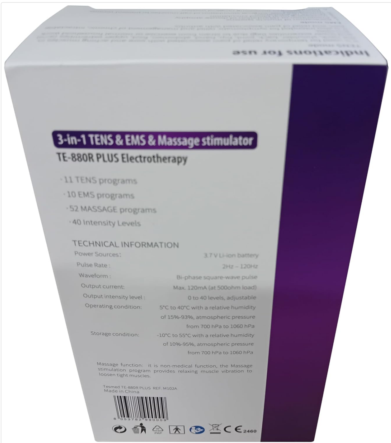
Figure 9.1: Side view of the TESMED TE-880R Plus product box, displaying technical specifications such as power source, pulse rate, waveform, output current, intensity levels, and operating/storage conditions.