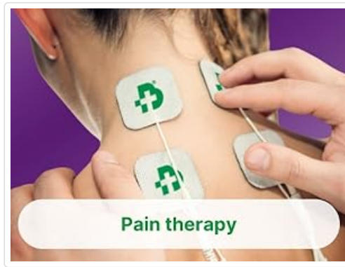
Figure 6.2: Image showing electrode placement on the neck and shoulders for pain therapy.