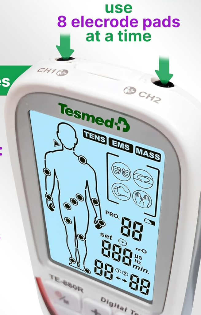
Figure 5.2: Close-up of the TESMED TE-880R Plus device showing its intuitive screen and two independent quadripolar channels for connecting electrodes.