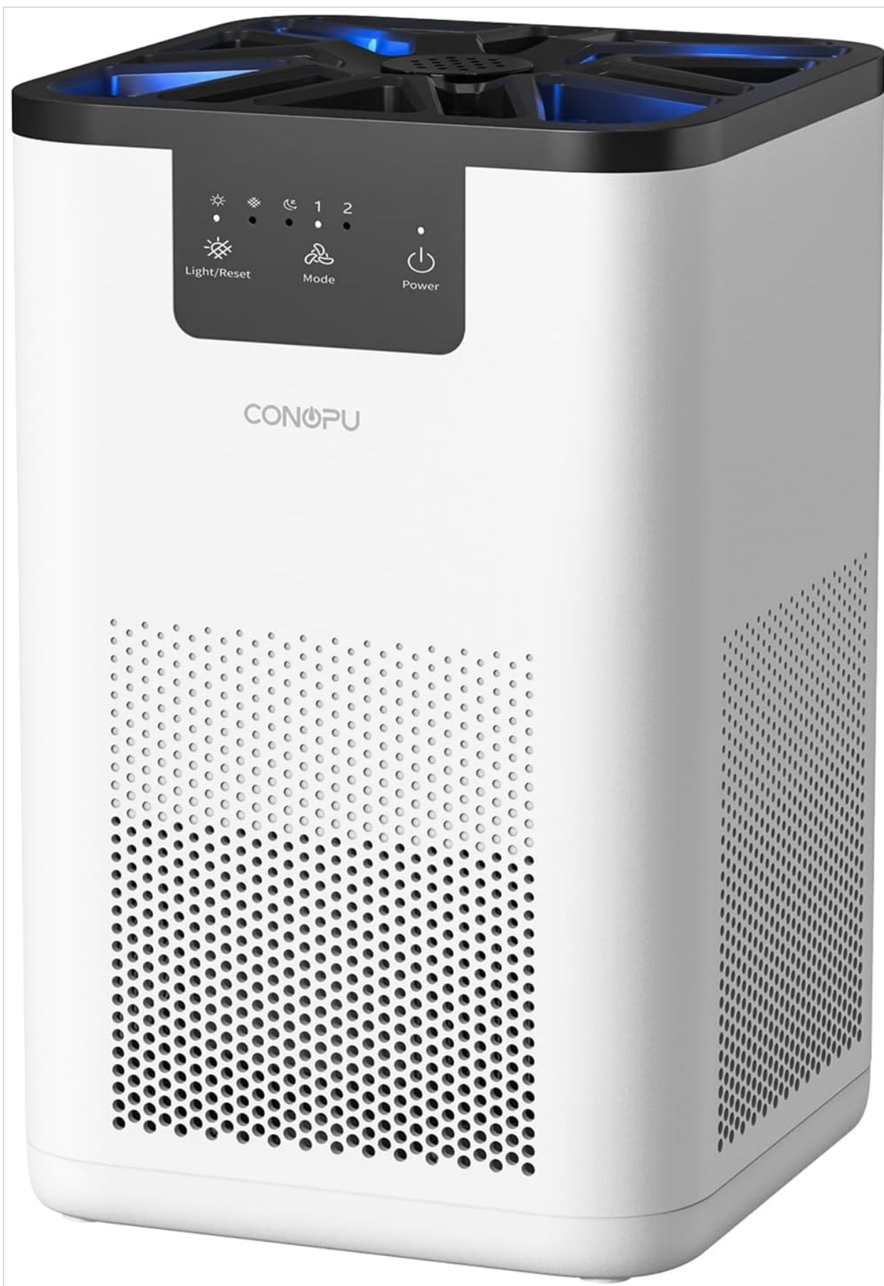
Figure 5.1: Close-up of the control panel with Power, Mode, and Light/Reset buttons.