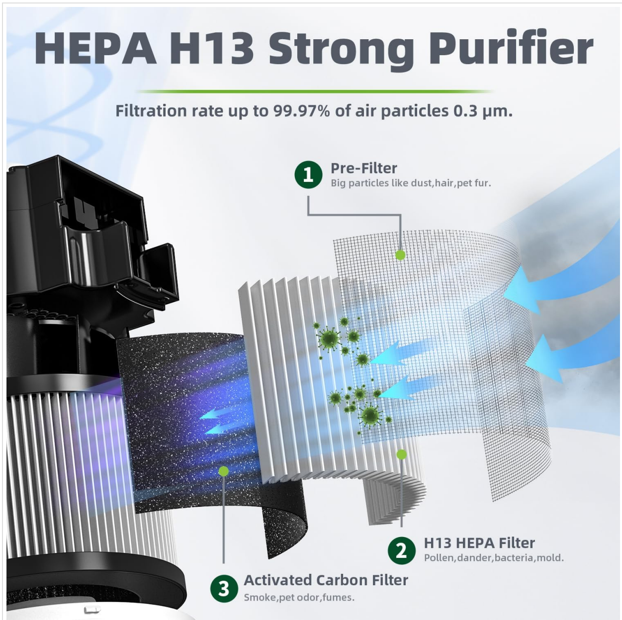
Figure 3.1: Illustration of the 3-stage filtration process, showing the Pre-Filter, H13 HEPA Filter, and Activated Carbon Filter.