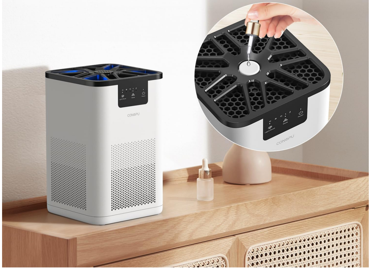
Figure 3.3: Demonstrates how to add essential oils to the dedicated aromatherapy slot on top of the unit.

Add your favorite essential oil (not included) to fill the room with fragrance, alongside purified air.