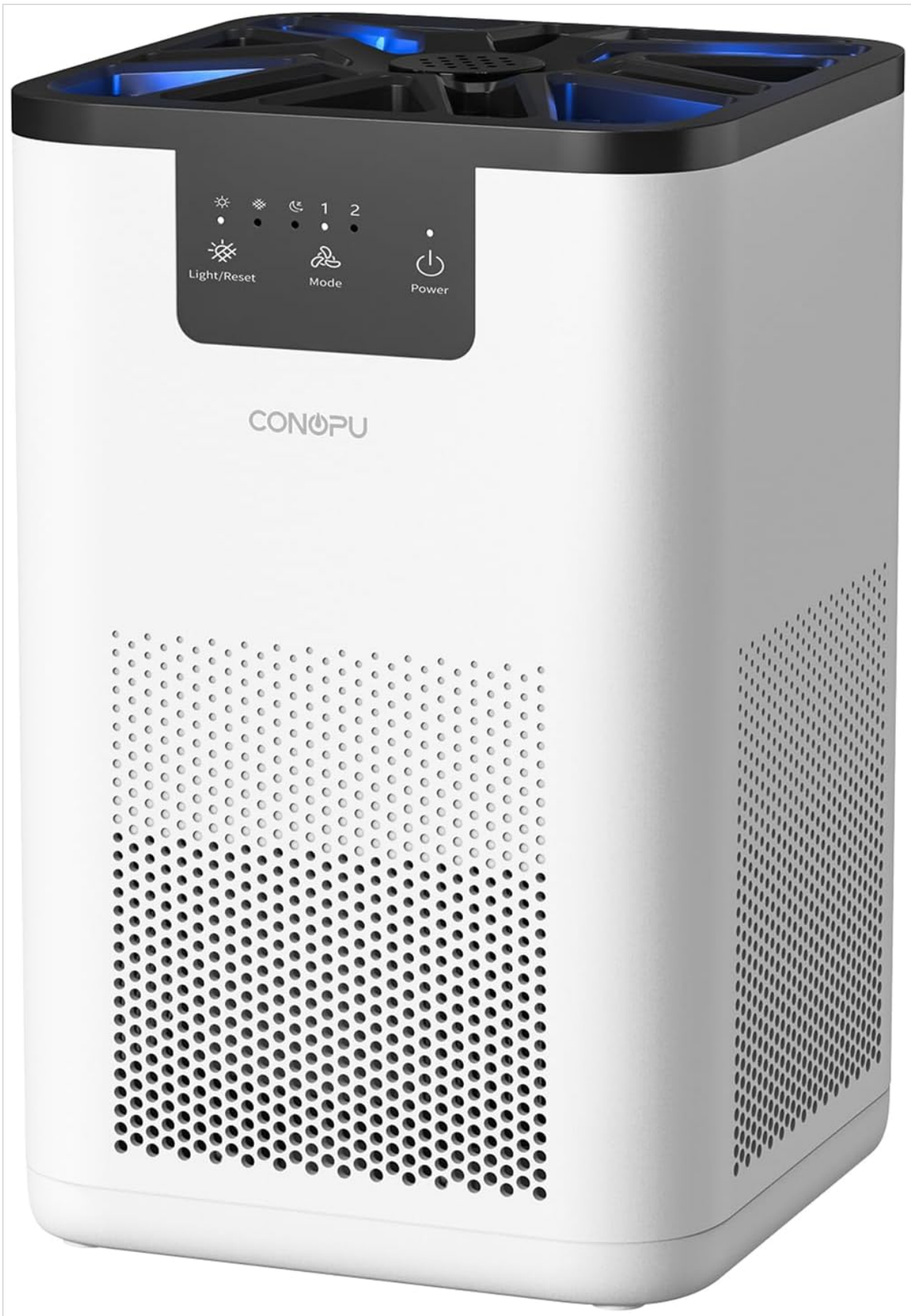
Figure 2.1: Front view of the CONOPU Air Purifier, showing the control panel and air intake vents.