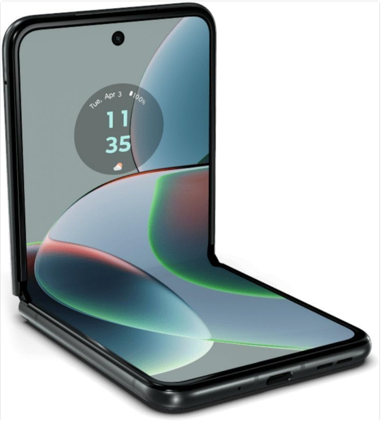
Image: Motorola Razr 40 smartphone fully unfolded, showcasing its large internal display.