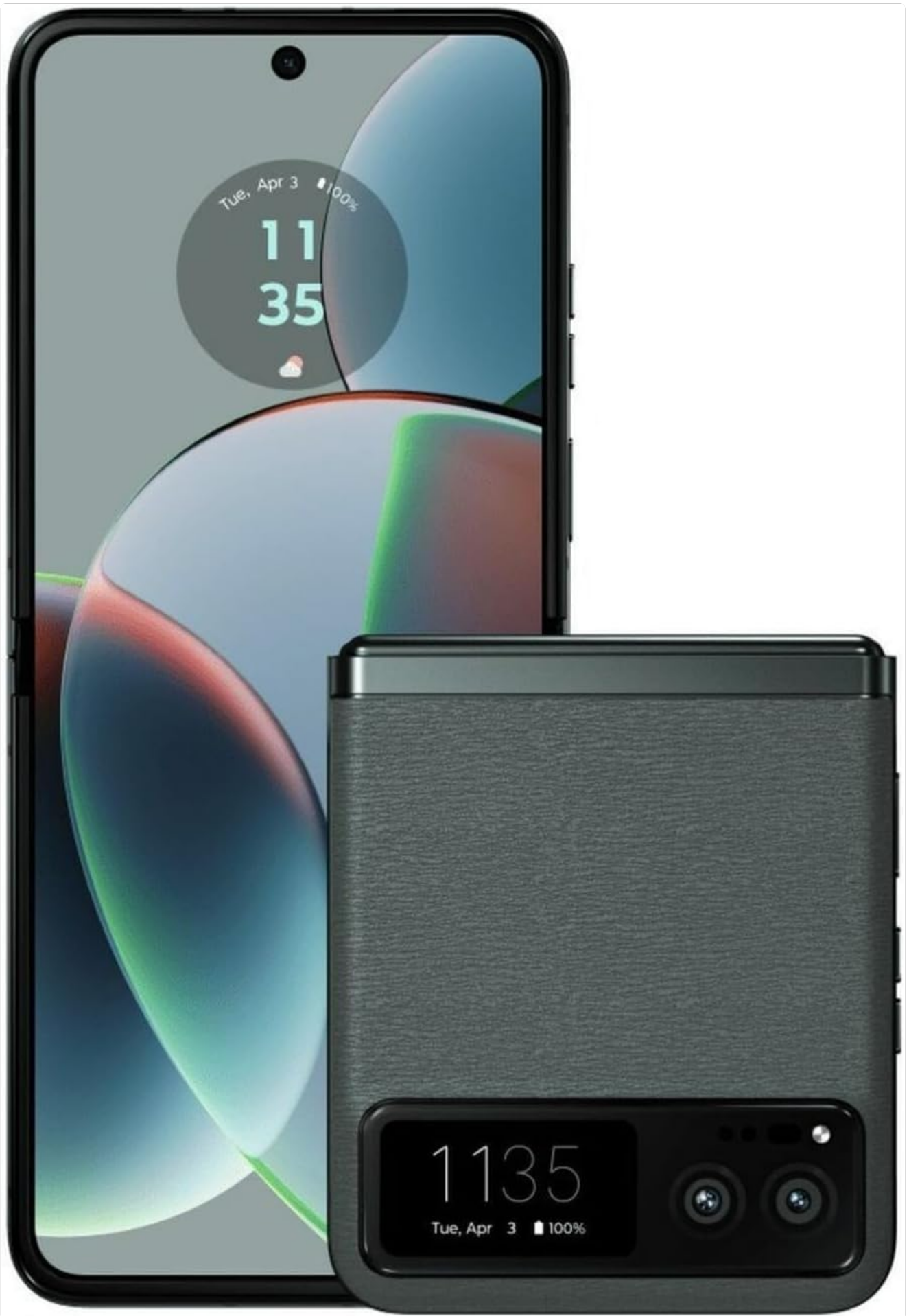
Image: Motorola Razr 40 smartphone, shown both unfolded and folded, displaying the main screen and the external display.