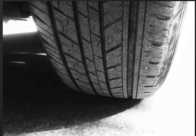
4 Uneven wear on tires