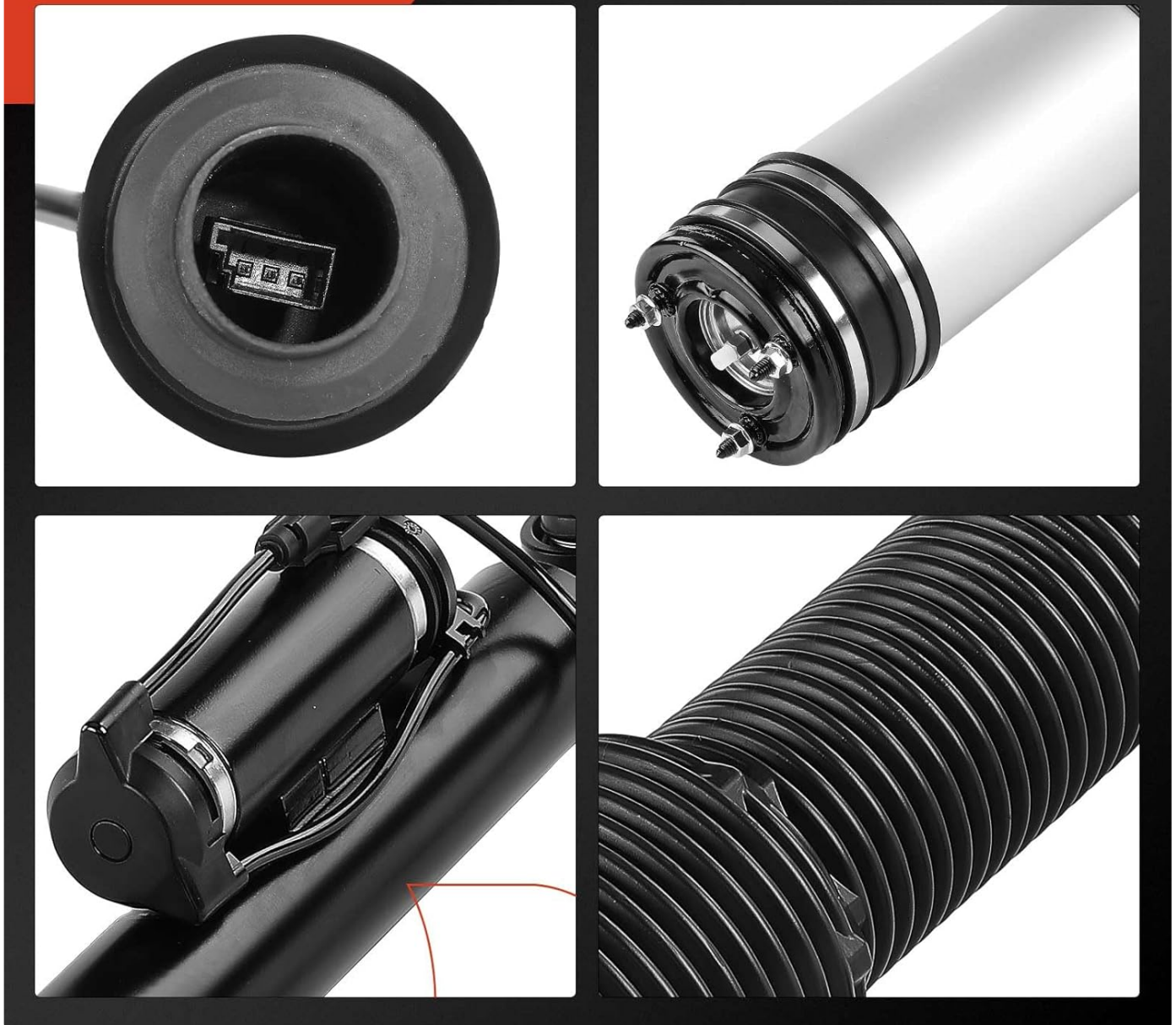
Image 4.2: Detailed close-up views of various parts of the strut, showcasing the quality and design of the fastening bolt, power supply interface, aluminum shell, working cylinder, bellows, and installation bracket.