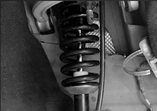
3 Air leakage