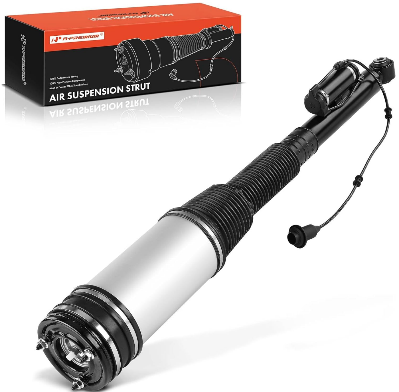
Image 1.1: A-Premium Rear Left or Right Air Suspension Strut Assembly in its product packaging.