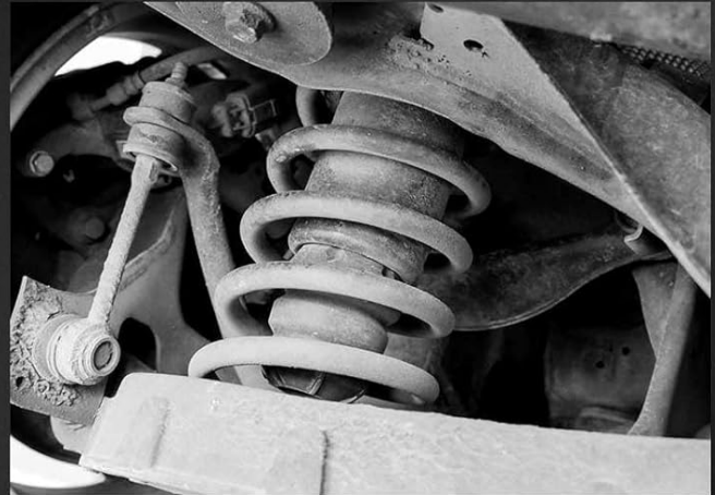
2 Abnormal noise