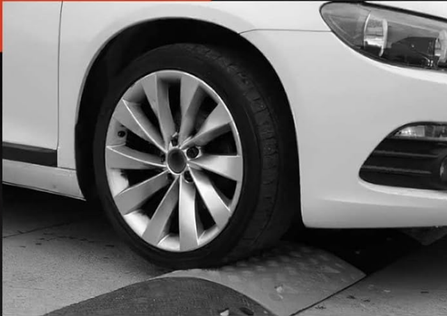
1 Excessive vibration