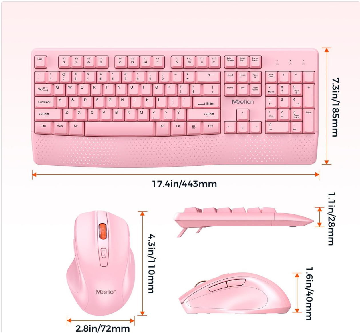
Image: Detailed diagram showing the precise dimensions of both the MEETION wireless keyboard and mouse in inches and millimeters.