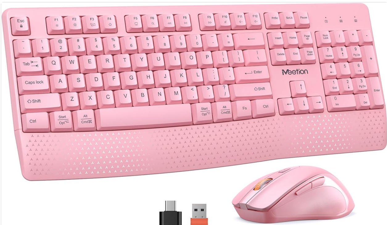
Image: The MEETION wireless keyboard and mouse combo, featuring a full-sized pink keyboard with wrist rest, a matching pink mouse, and the USB-A receiver and USB-C adapter.

Thank you for choosing the MEETION Wireless Keyboard and Mouse Combo. This full-sized cordless keyboard with an integrated wrist rest and a 3-DPI adjustable mouse is designed to provide a comfortable and efficient computing experience. Utilizing advanced 2.4G wireless technology, it ensures a reliable and seamless connection without interference. This manual provides detailed instructions for setup, operation, maintenance, and troubleshooting to help you get the most out of your new device.