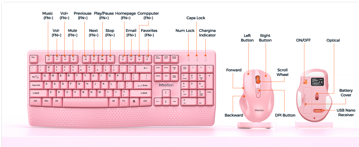
Image: An overhead view of the keyboard and mouse, with labels pointing to various keys and buttons, including multimedia functions and mouse controls.