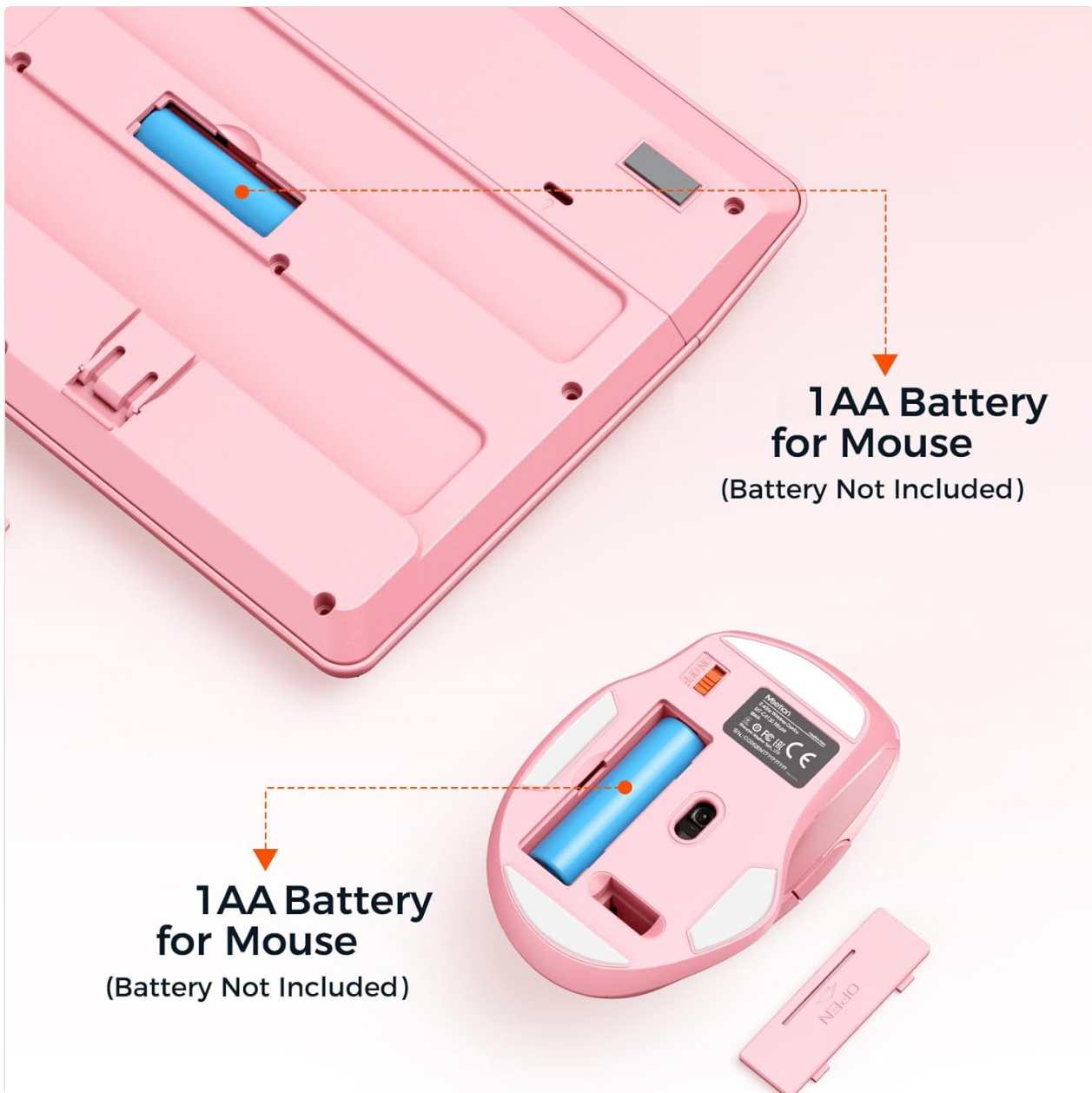
Image: Diagram showing the battery compartments for both the keyboard and mouse, indicating where to insert the AA batteries.