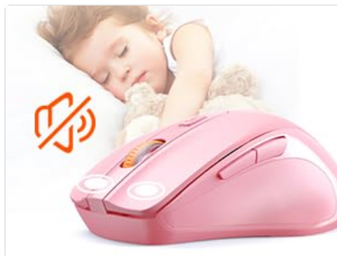
Image: The mouse with a 'no sound' icon, emphasizing its quiet click feature, ideal for quiet environments.