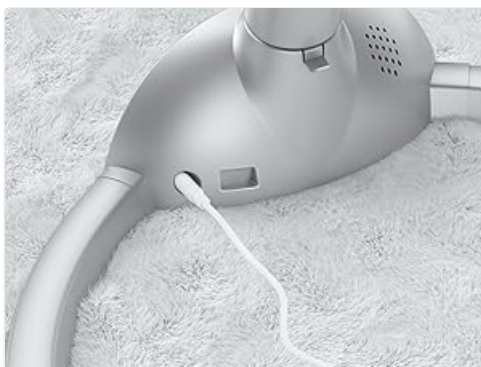
Image 4.1: Illustrates the power adapter connection point on the swing's base, highlighting how to provide power for indoor use.