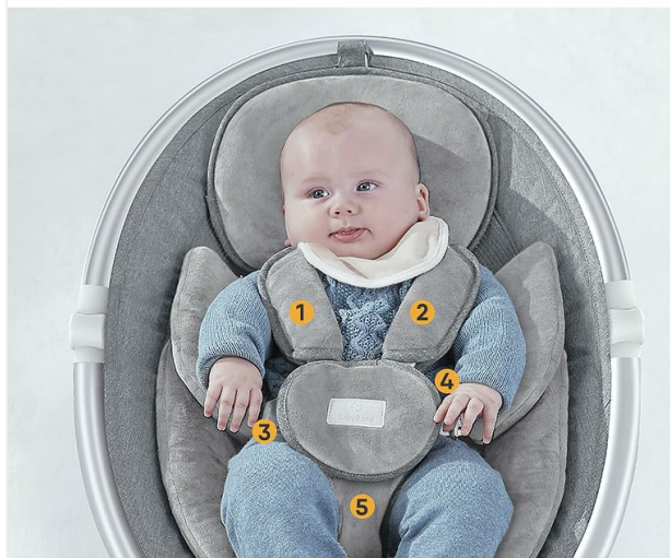
5 Point Harness