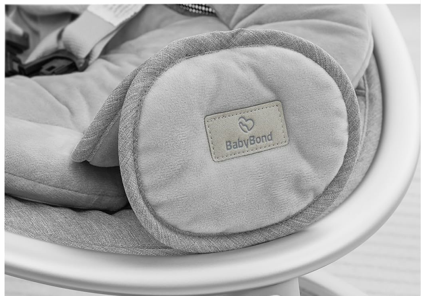
Image 6.1: Highlights the premium, ultra-soft, breathable, and washable fabric used for the swing's cushion, demonstrating its ease of maintenance.