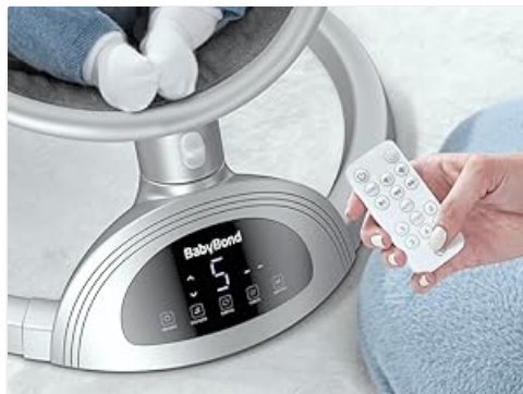
Image 5.4: A close-up view of the remote control, showing its various buttons for power, speed adjustment, timer settings, and music control.