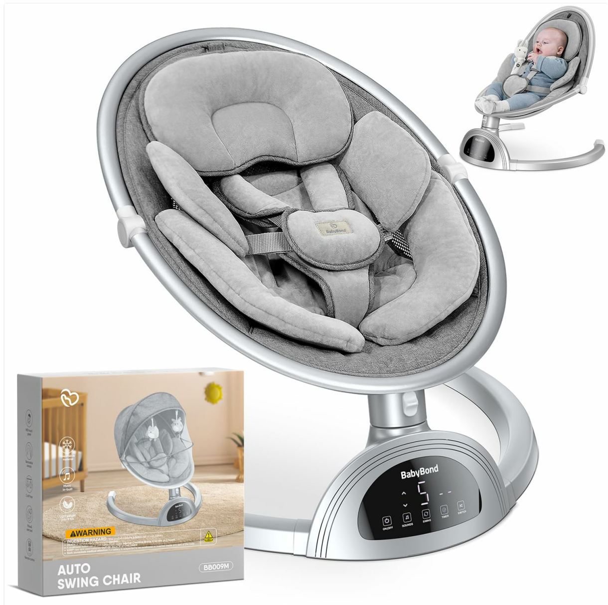
Image 3.1: The BabyBond Infant Swing, showcasing its sleek design, integrated control panel, and included remote control. The packaging box is also visible, indicating the model number BB009M.

Familiarize yourself with the main parts of your BabyBond Infant Swing.