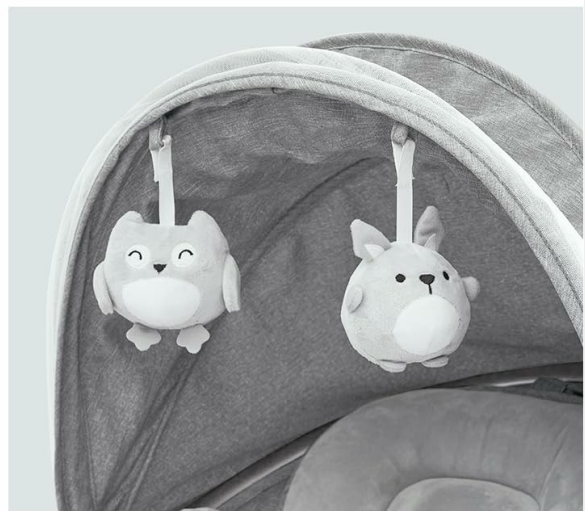
lovely toys Mosquito nets