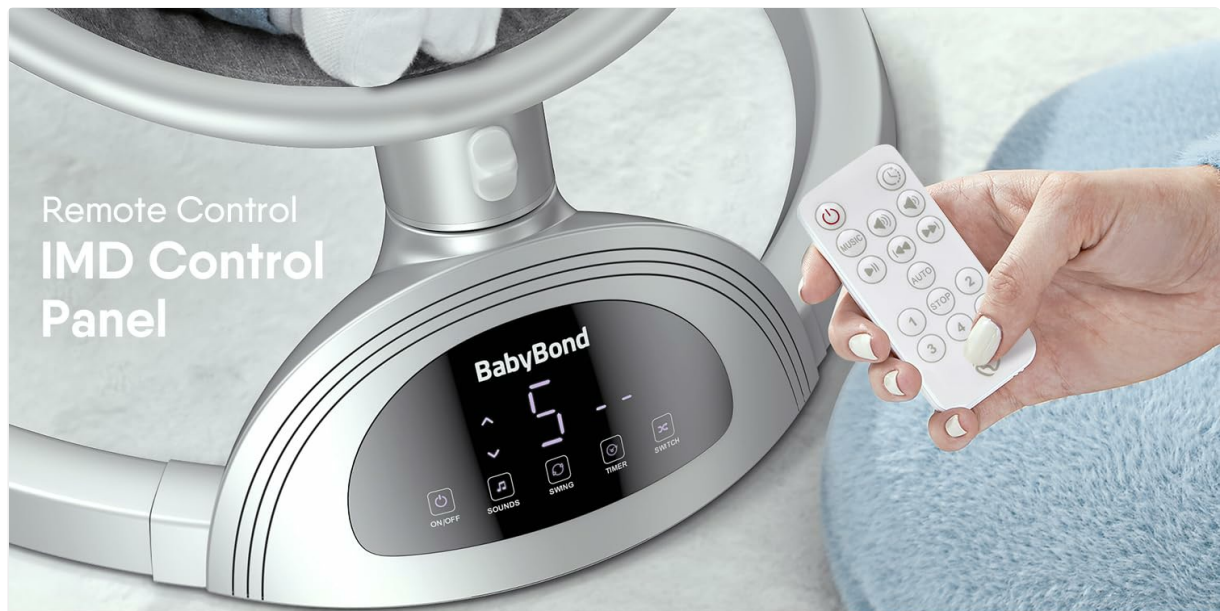
Remote Control IMD Control Panel