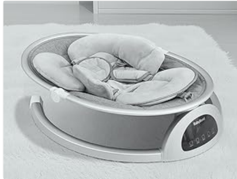
Image 6.3: The BabyBond Infant Swing shown in its folded, compact state, demonstrating its portability and ease of storage.