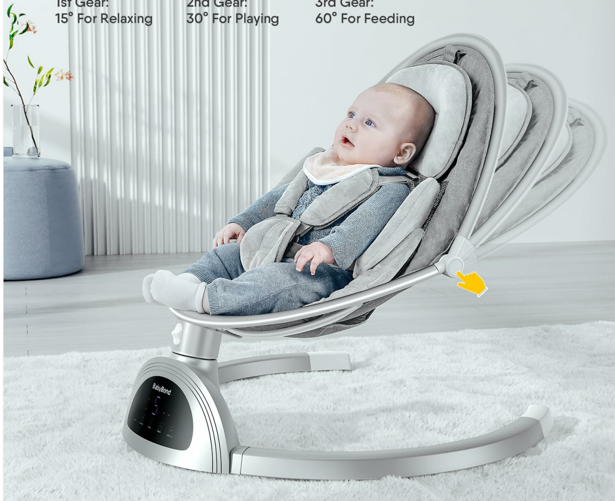
Image 5.2: Shows the three distinct seat positions: 15° for relaxing, 30° for playing, and 60° for feeding, illustrating how to adjust the seat angle.