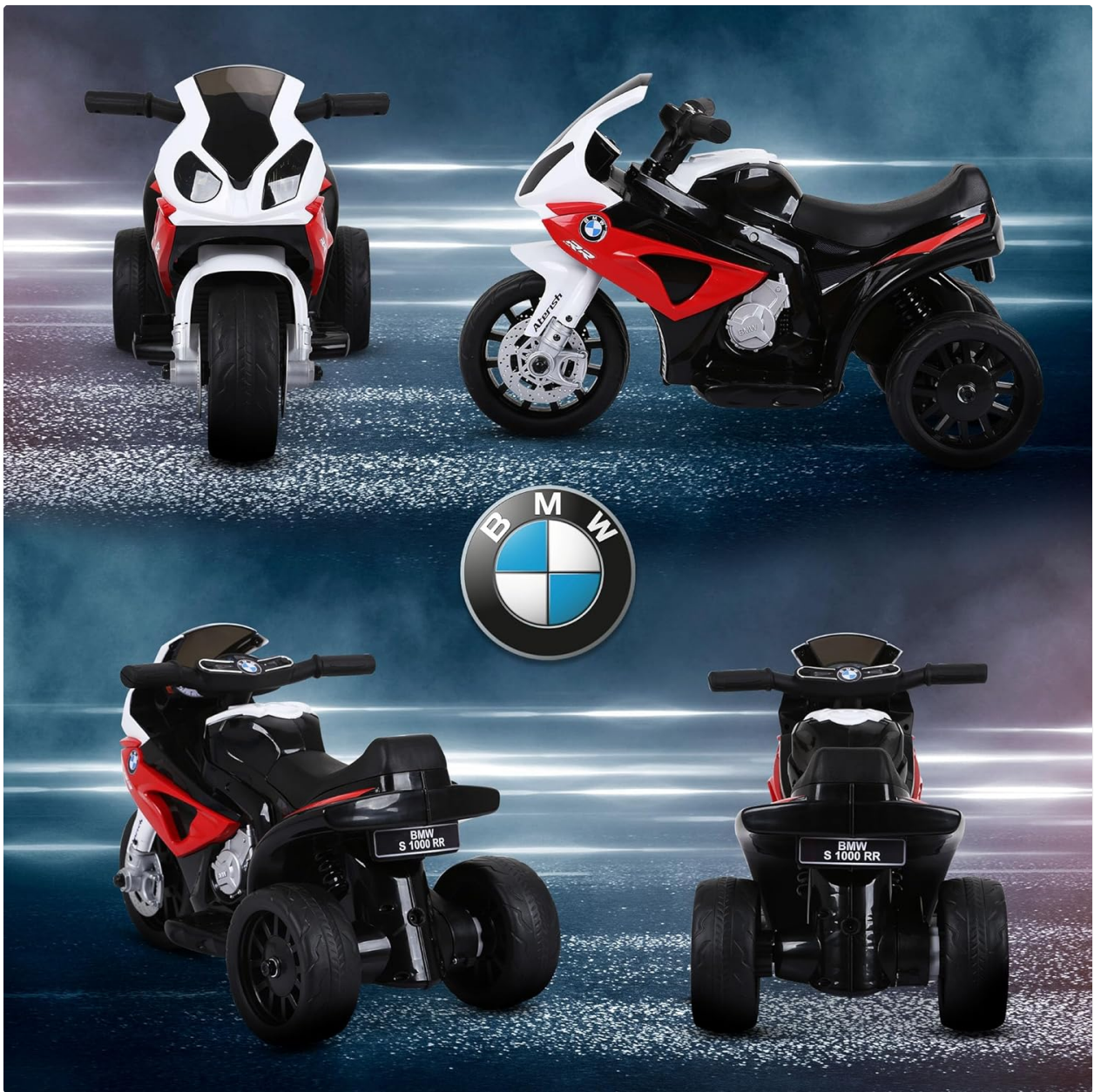
Image: Various angles of the Aosom 6V Licensed BMW S1000RR Kids Electric Motorcycle, showcasing its design.