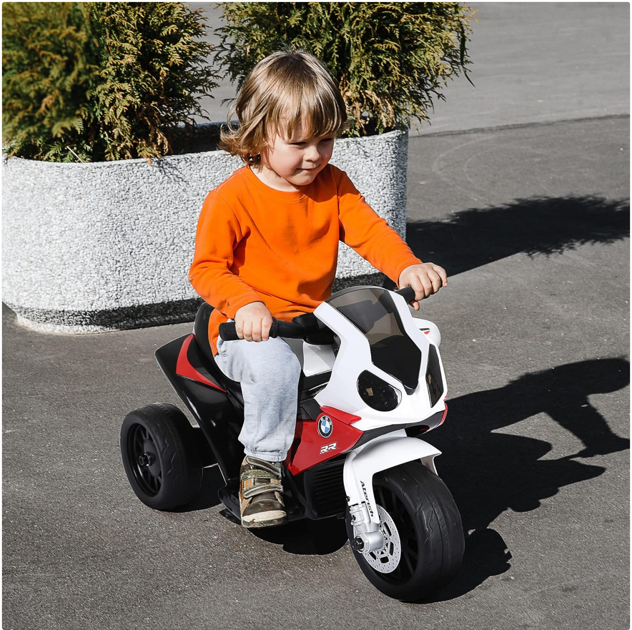
Image: A young child riding the Aosom 6V Licensed BMW S1000RR Kids Electric Motorcycle outdoors.