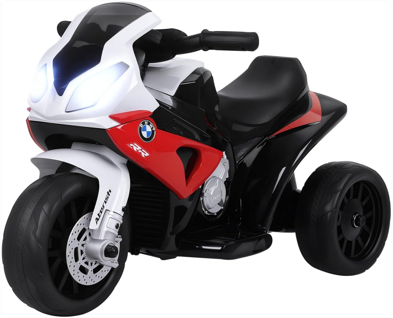
Image: The Aosom 6V Licensed BMW S1000RR Kids Electric Motorcycle in Red.

The Aosom 6V Licensed BMW S1000RR Kids Electric Motorcycle provides a realistic and enjoyable riding experience for toddlers. This 3-wheeled electric motorcycle features working headlights, built-in music, and a stable design for safe play.