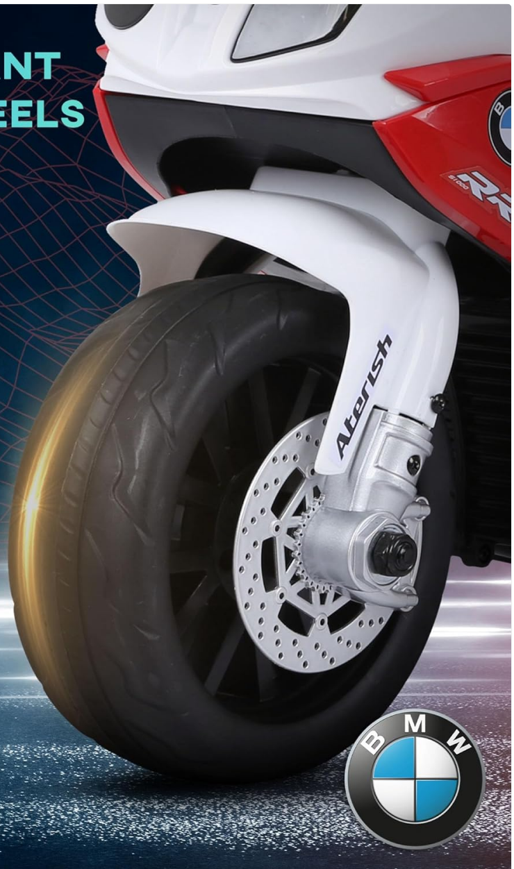
Image: A close-up of the wear-resistant textured wheels, showing suitability for cement, brick, asphalt, and wood floor surfaces.