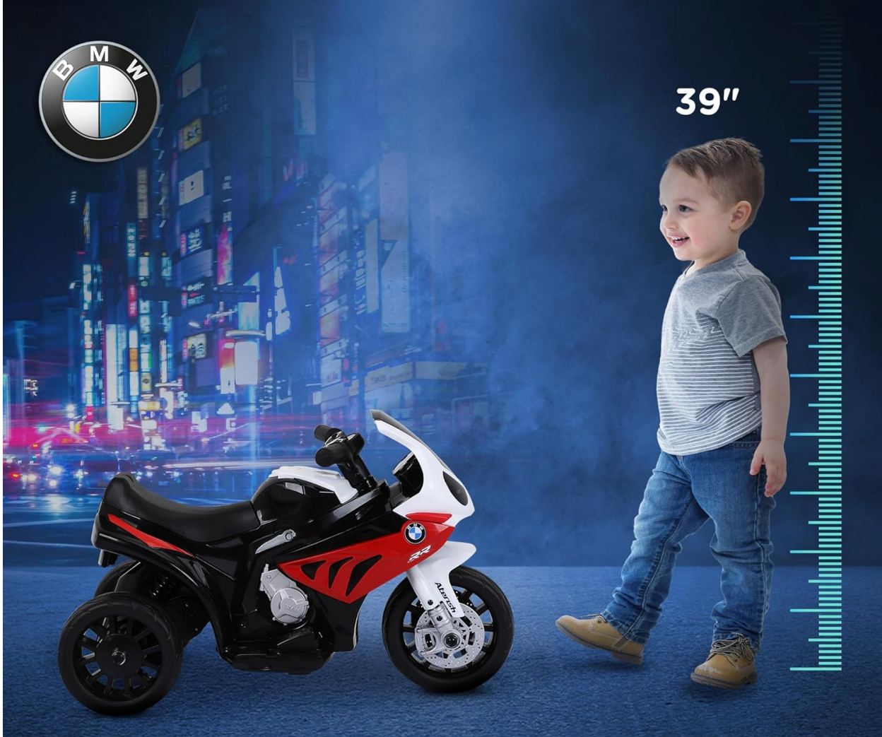
Image: A child standing next to the motorcycle, with a height measurement of 39 inches for scale.