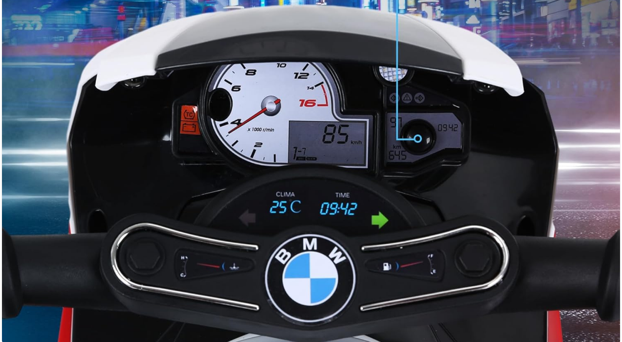
Image: Close-up of the motorcycle's dashboard, featuring gauges and the BMW logo.