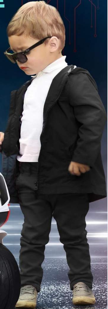
Image: A child standing beside the motorcycle, with text indicating features like 1.6 mph speed, durable build, 44 lbs weight capacity, and rechargeable battery.