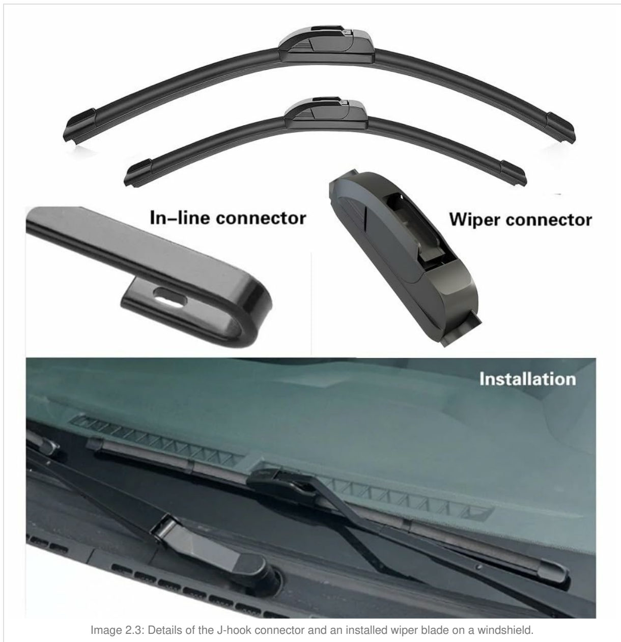
Image 2.3: Details of the J-hook connector and an installed wiper blade on a windshield.