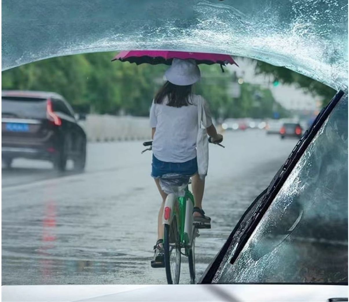
Image 3.1: Clear vision provided by Autopixl wiper blades during rainy conditions.

The 1,000 pressure points ensure the blade conforms perfectly to your windshield's curvature, delivering consistent contact and a streak-free wipe across the entire glass surface.