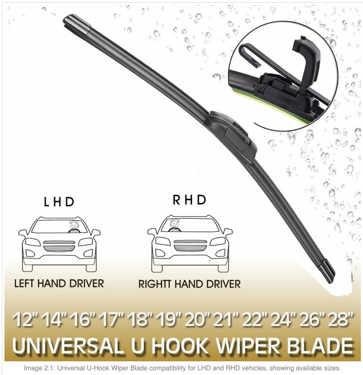
Image 2.1: Universal U-Hook Wiper Blade compatibility for LHD and RHD vehicles, showing available sizes.