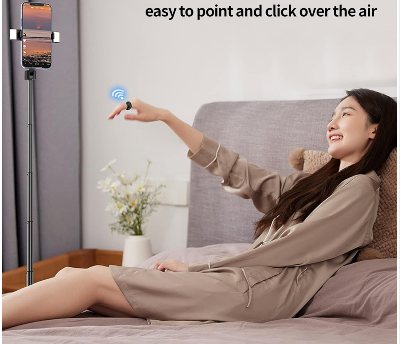
Image: A person comfortably using the Diyeeni Bluetooth Ring Remote Control while lying on a bed, demonstrating its 10-meter remote control capability for easy interaction with a phone on a stand.

10m remote control easy to point and click over the air