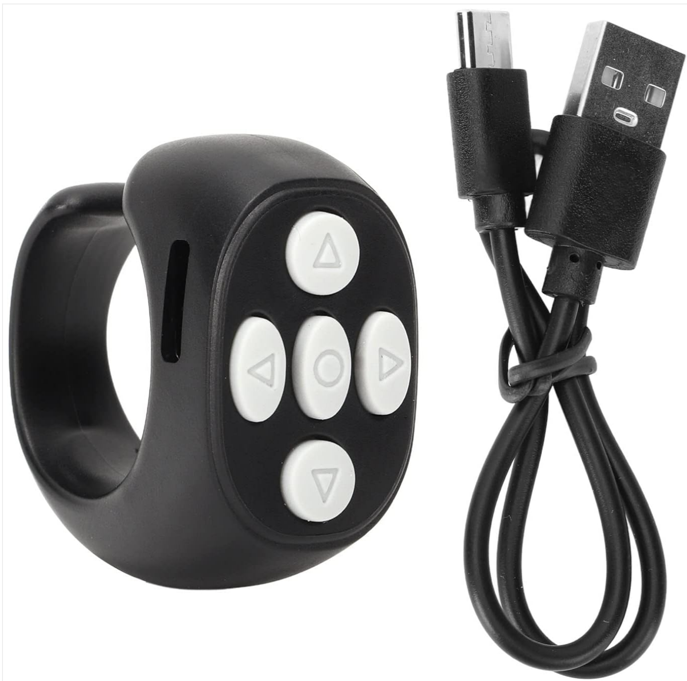
Image: The Diyeeni Bluetooth Ring Remote Control shown alongside its USB charging cable, illustrating the complete package contents.