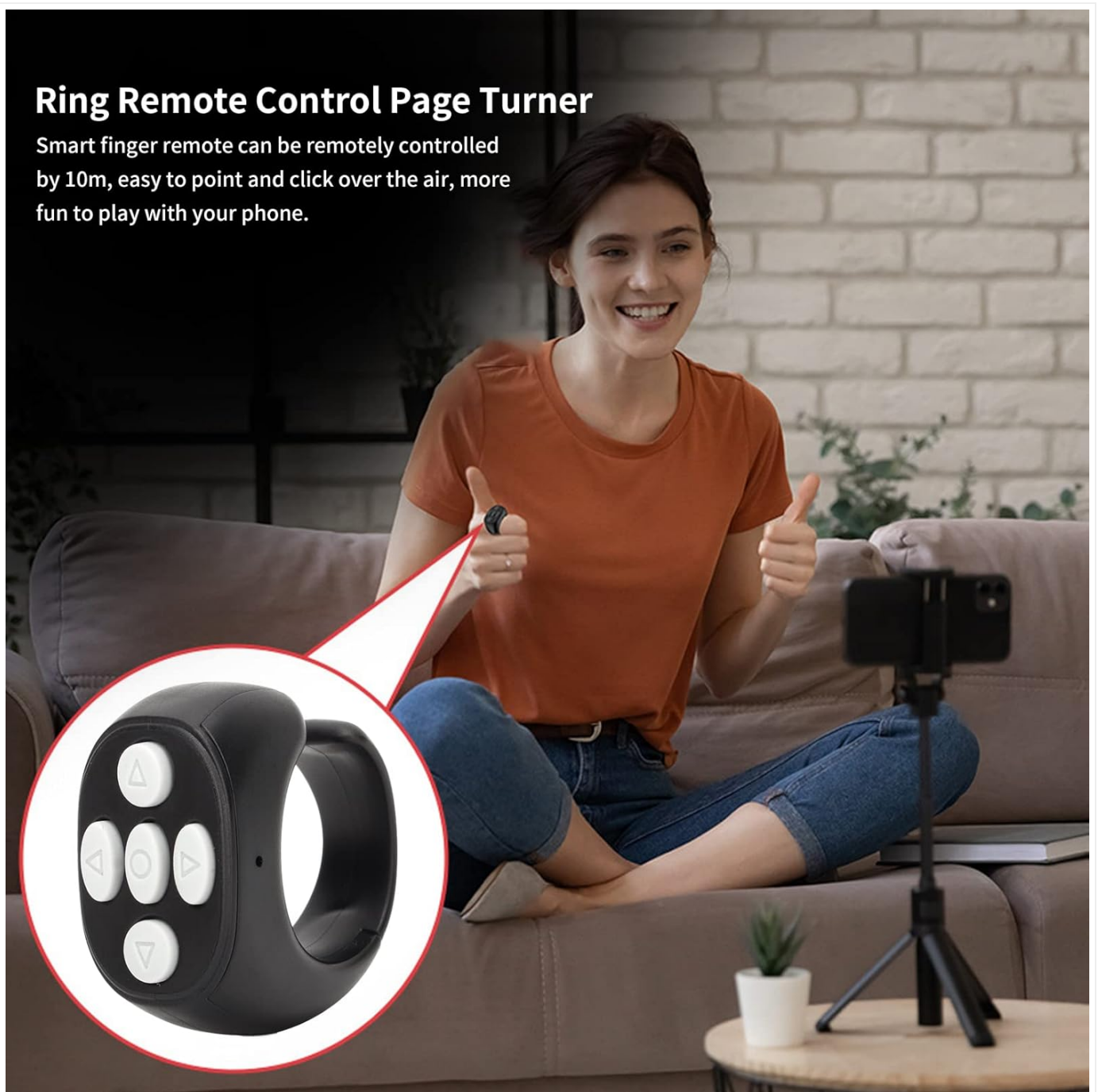
Image: A person sitting on a couch, smiling and giving a thumbs-up, while wearing the Diyeeni Bluetooth Ring Remote Control. A magnified inset shows the remote on their finger, highlighting its use as a page turner for remote control of a smartphone.

Smart finger remote can be remotely controlled by 10m, easy to point and click over the air, more fun to play with your phone.