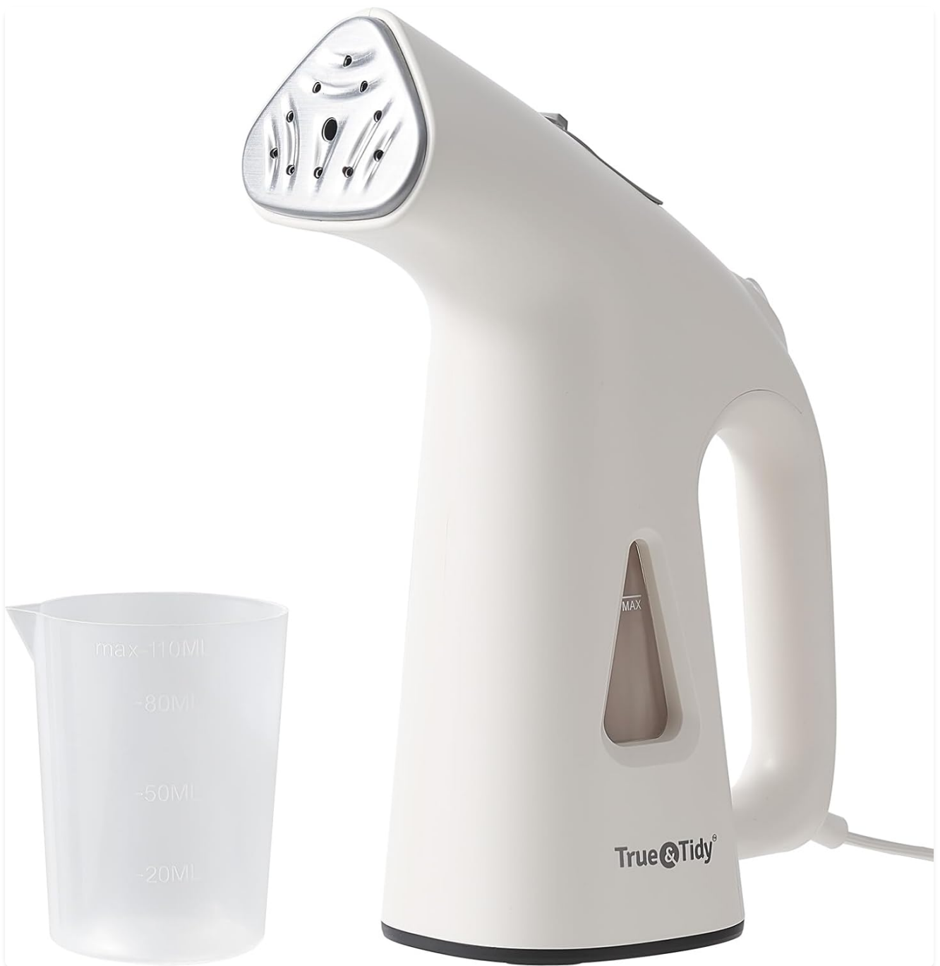
Image: The True & Tidy TS-38A Handheld Steamer in white, shown alongside its included measuring cup.