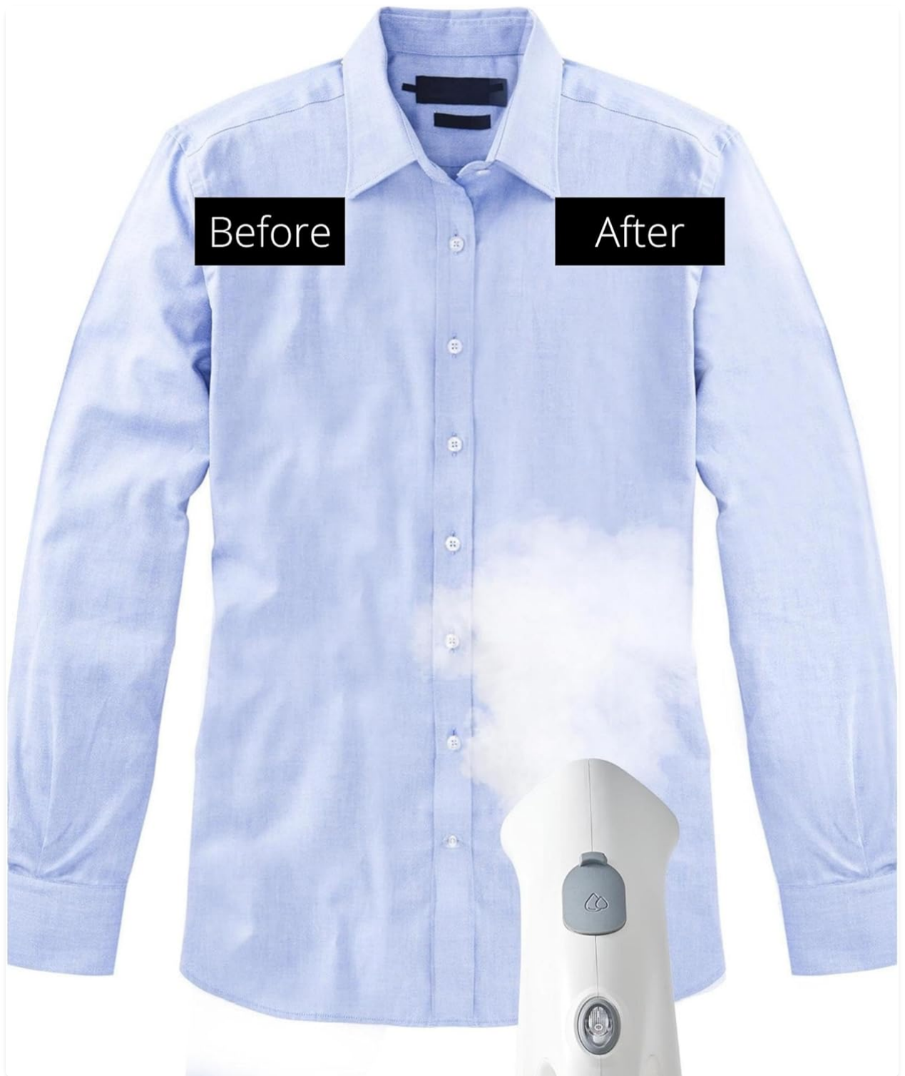
Image: The handheld steamer in action, effectively removing wrinkles from a blue collared shirt.