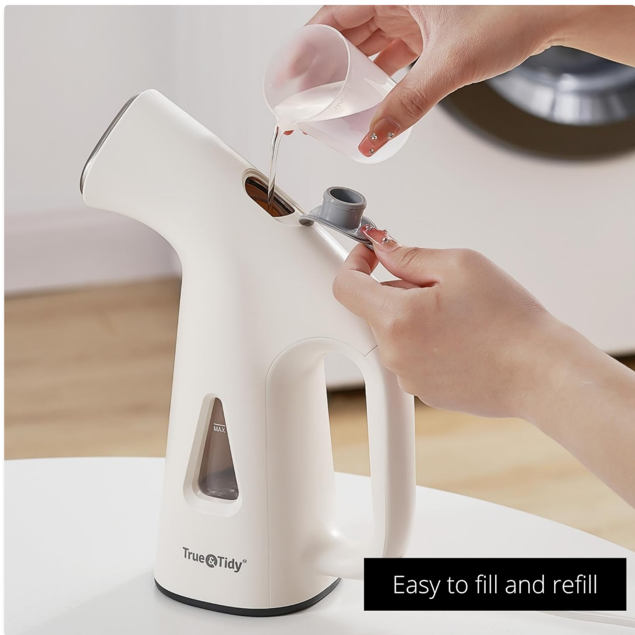
Image: Hands demonstrating the process of filling the steamer's water tank with water using the provided measuring cup.