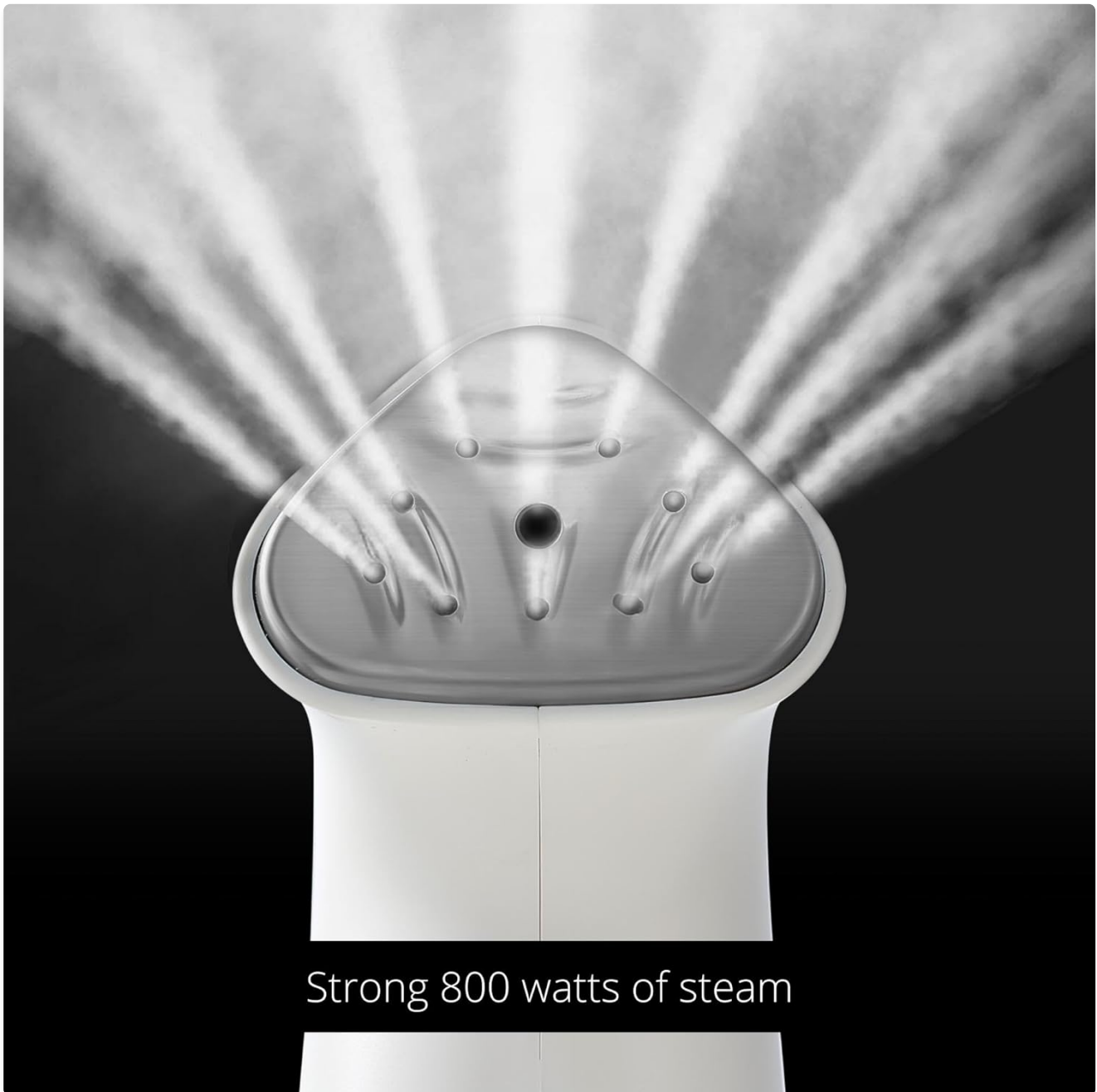
Image: The steamer in operation, showing strong steam being emitted from the nozzle, demonstrating its wrinkle-removing capability.