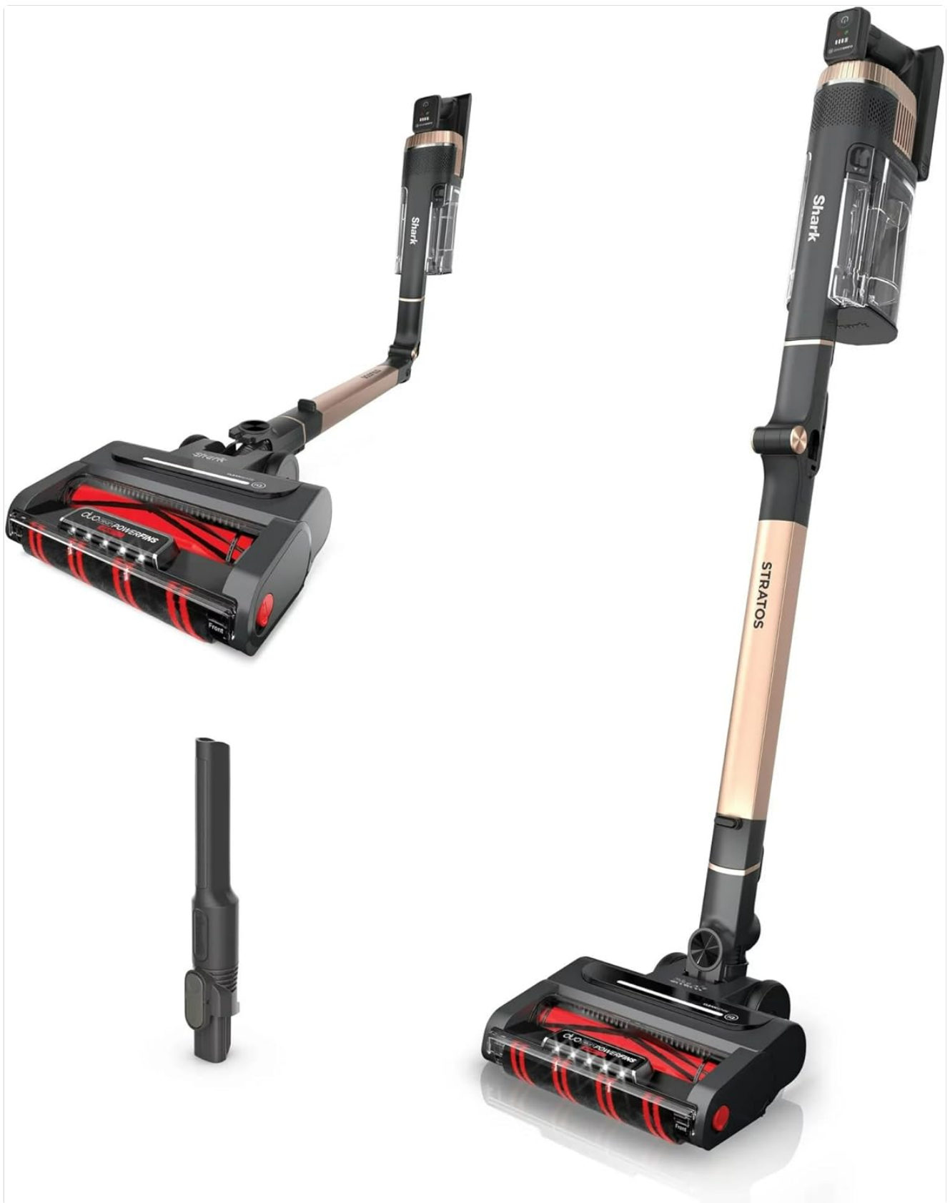
Image: The Shark IZ840H Stratos Cordless Vacuum, showcasing its upright configuration, its folded configuration for compact storage, and the included crevice tool. The vacuum features a rose gold and black design.