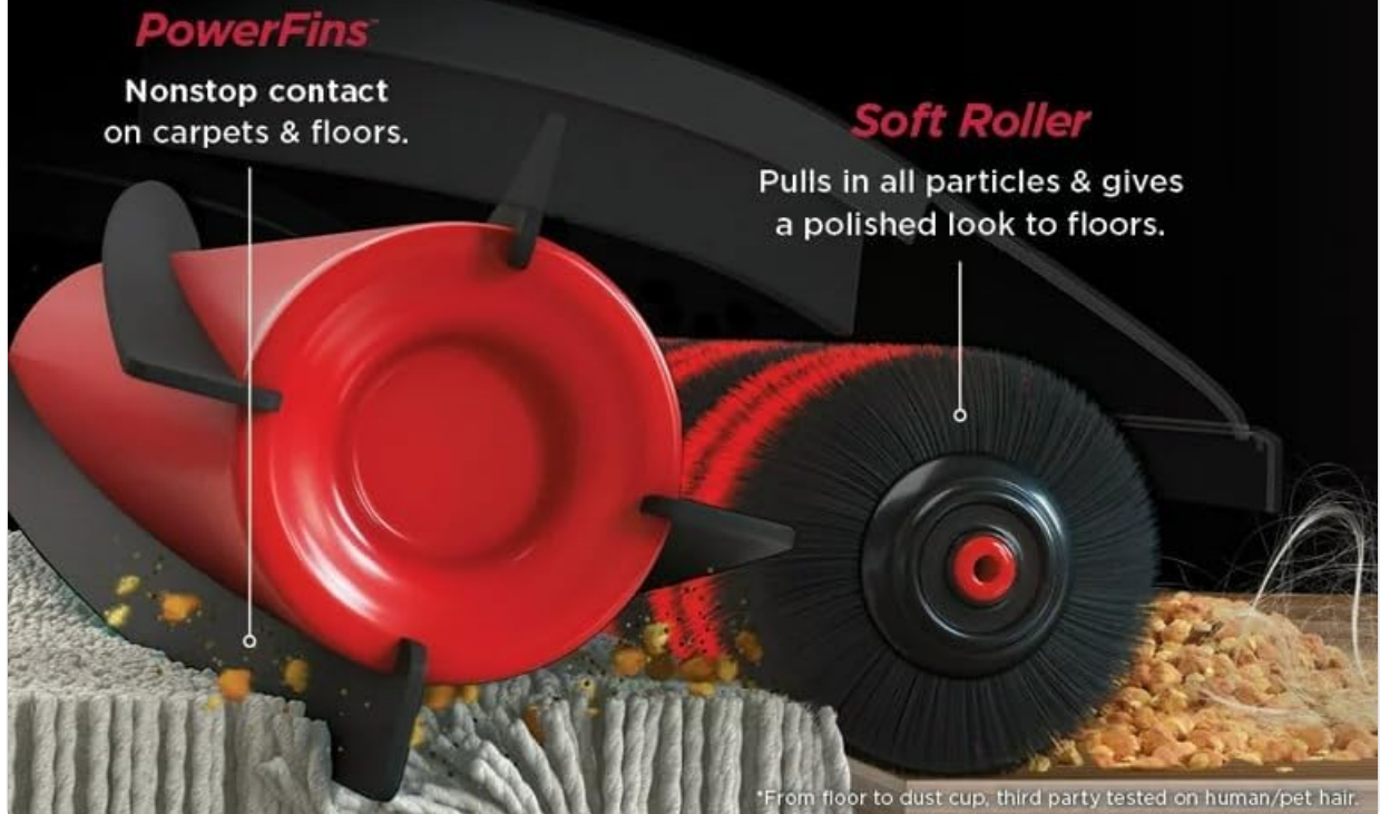
Image: A detailed view of the DuoClean PowerFins HairPro brush roll system, illustrating the PowerFins for deep carpet cleaning and the soft roller for hard floors, effectively capturing various types of debris and hair.