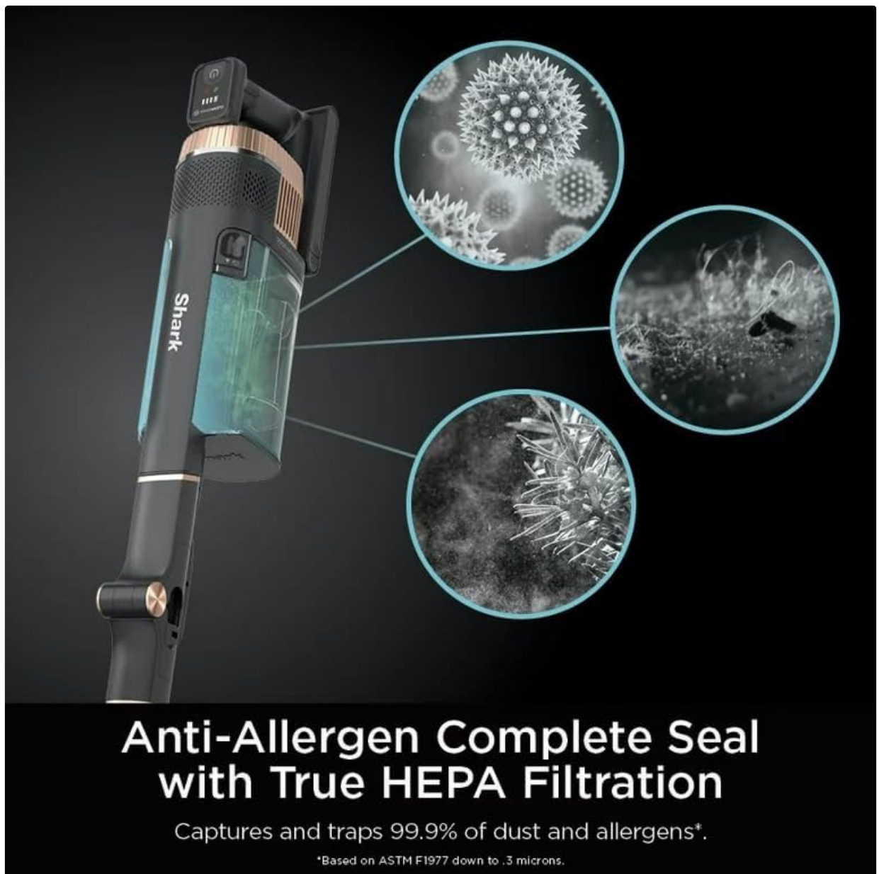
Image: An illustration showing the vacuum's sealed system and HEPA filter, with microscopic views of dust, pollen, and dander being captured, emphasizing its allergen trapping capabilities.