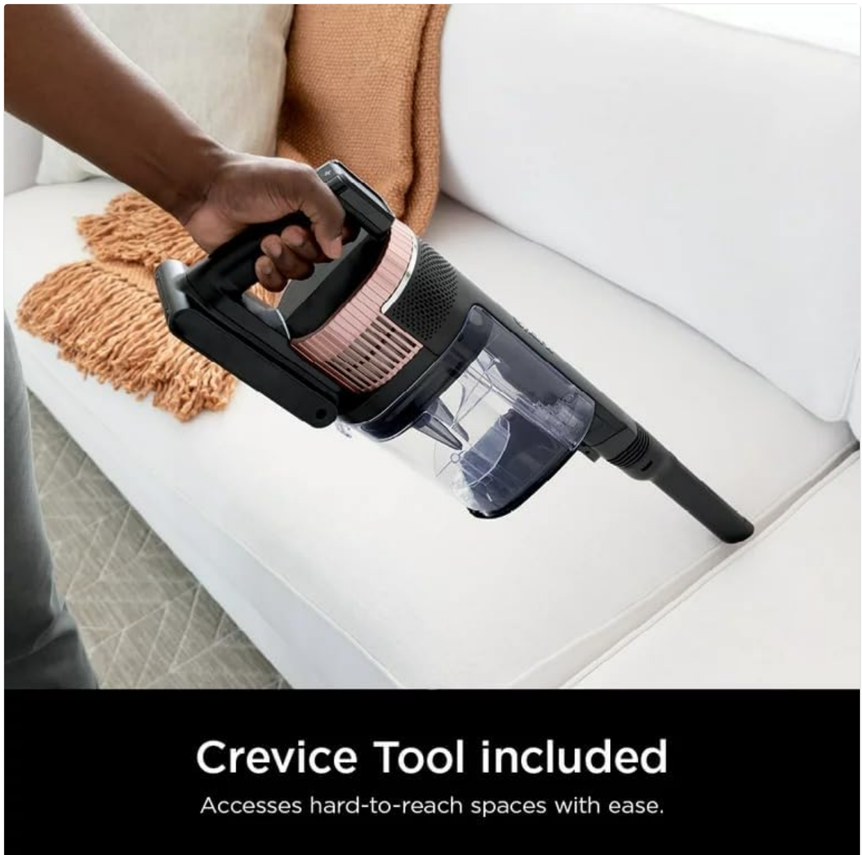
Image: A close-up of the crevice tool, designed for accessing hard-to-reach spaces, shown next to the main vacuum unit.