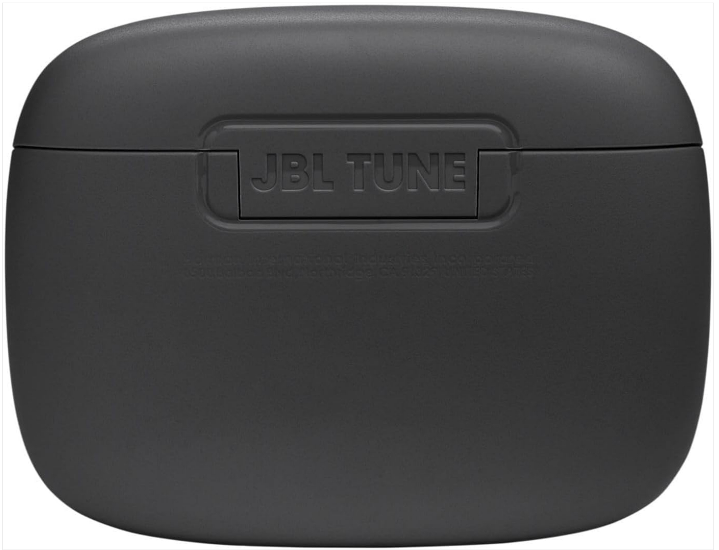
Image: Bottom view of the JBL Tune Beam charging case, clearly showing the USB-C charging port.