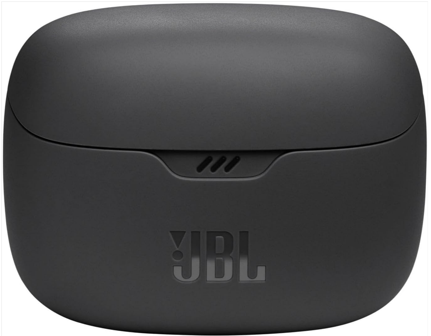
Image: The JBL Tune Beam charging case in a closed position, showing its compact and smooth exterior.