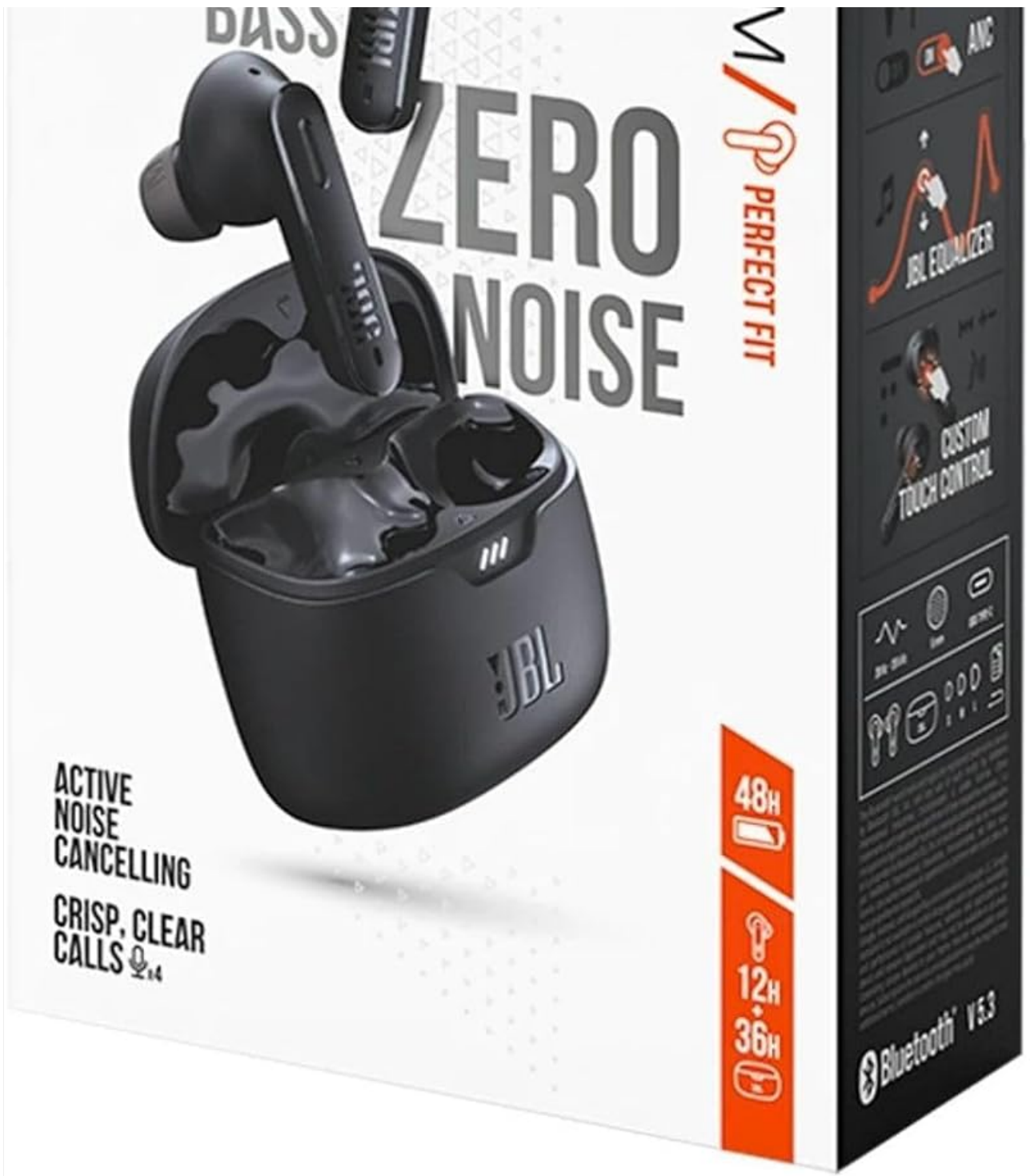
Image: Top view of the JBL Tune Beam charging case, featuring the embossed 'JBL TUNE' branding.