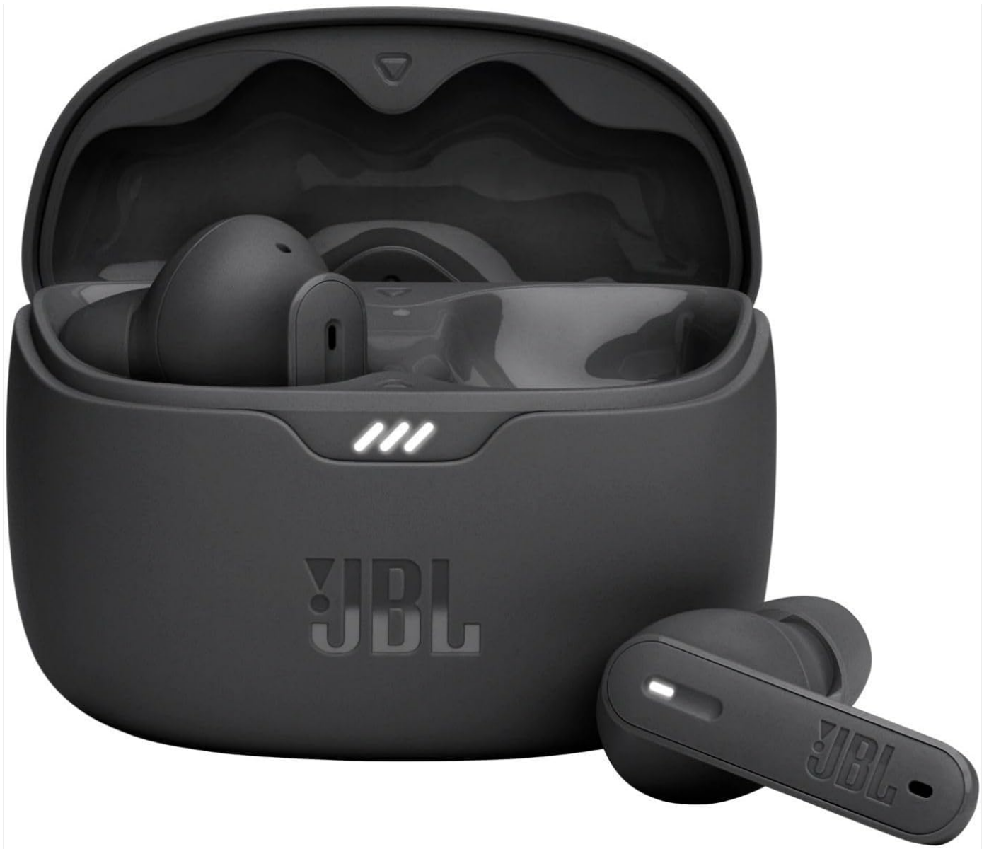
Image: The JBL Tune Beam charging case open with both earbuds inside, and one earbud removed and placed beside the case, showing its design.