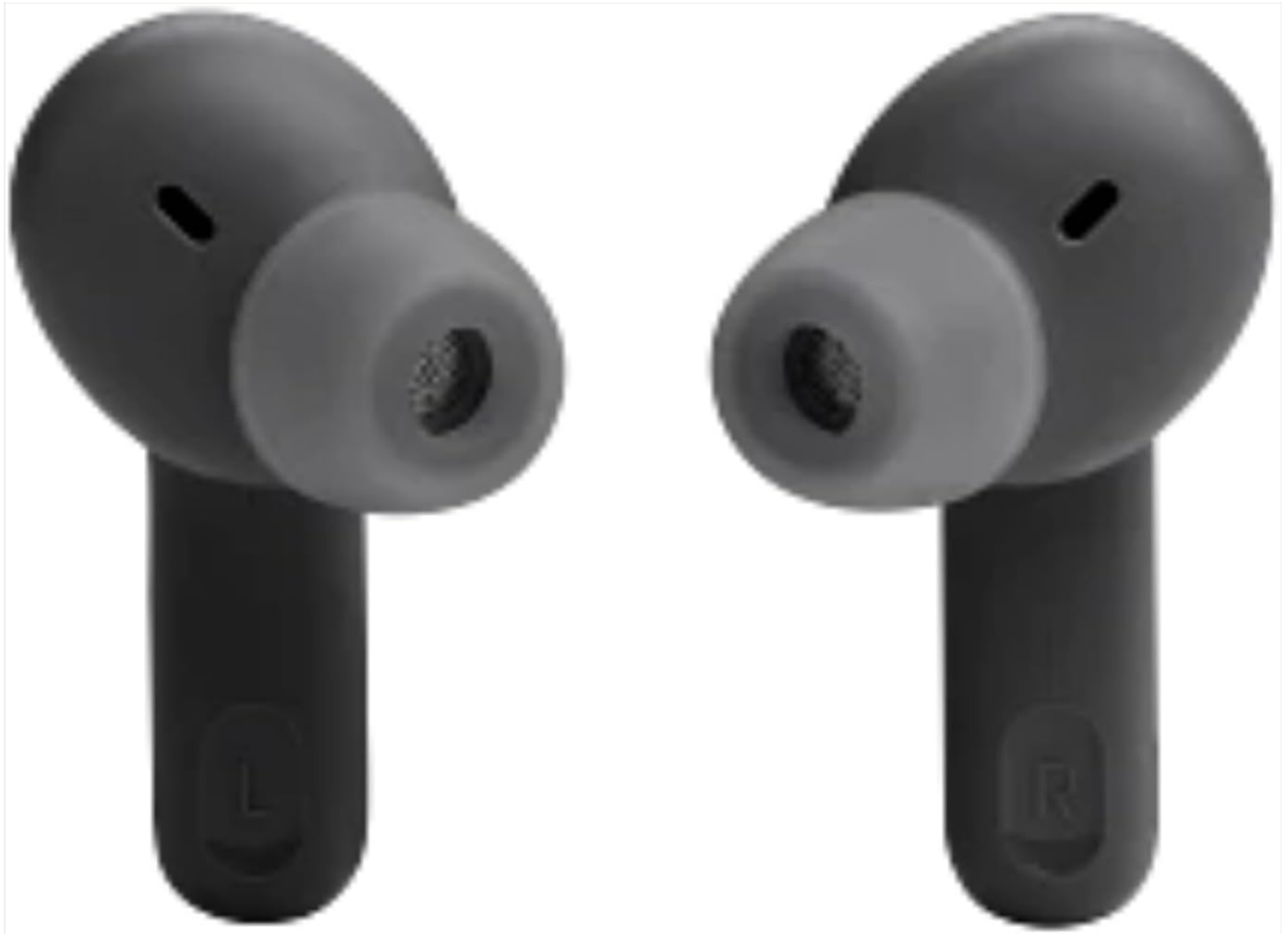
Image: Side view of the JBL Tune Beam earbuds, showing the ergonomic shape and ear tip attachment point.