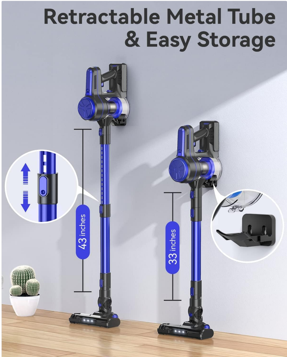
Figure 2: The EICOBOT A10 vacuum cleaner illustrating its retractable metal tube, adjustable from 33 inches to 43 inches, and its convenient wall-mounted storage solution.