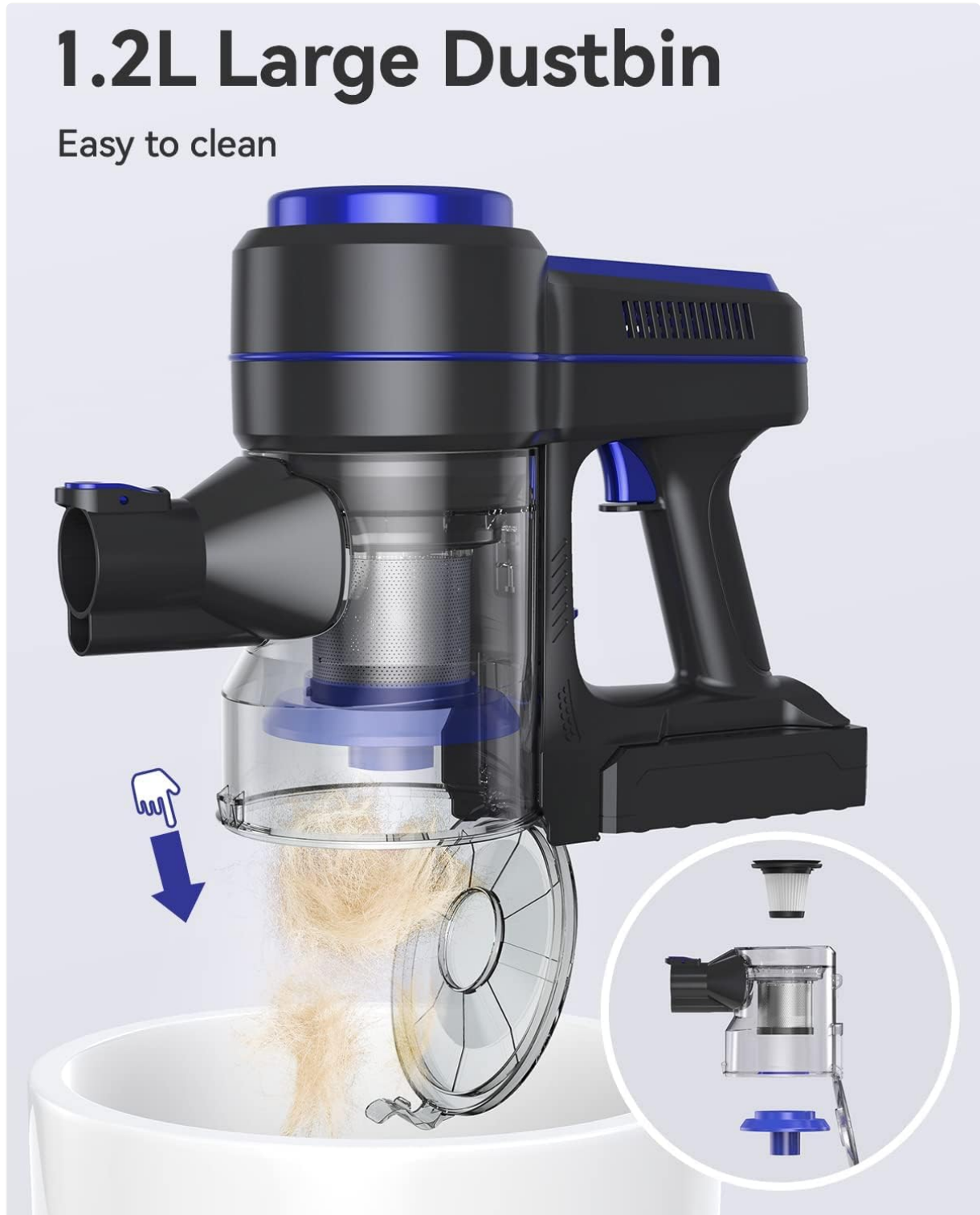
Figure 6: The EICOBOT A10 vacuum cleaner demonstrating the easy emptying process of its 1.2L large dustbin, which