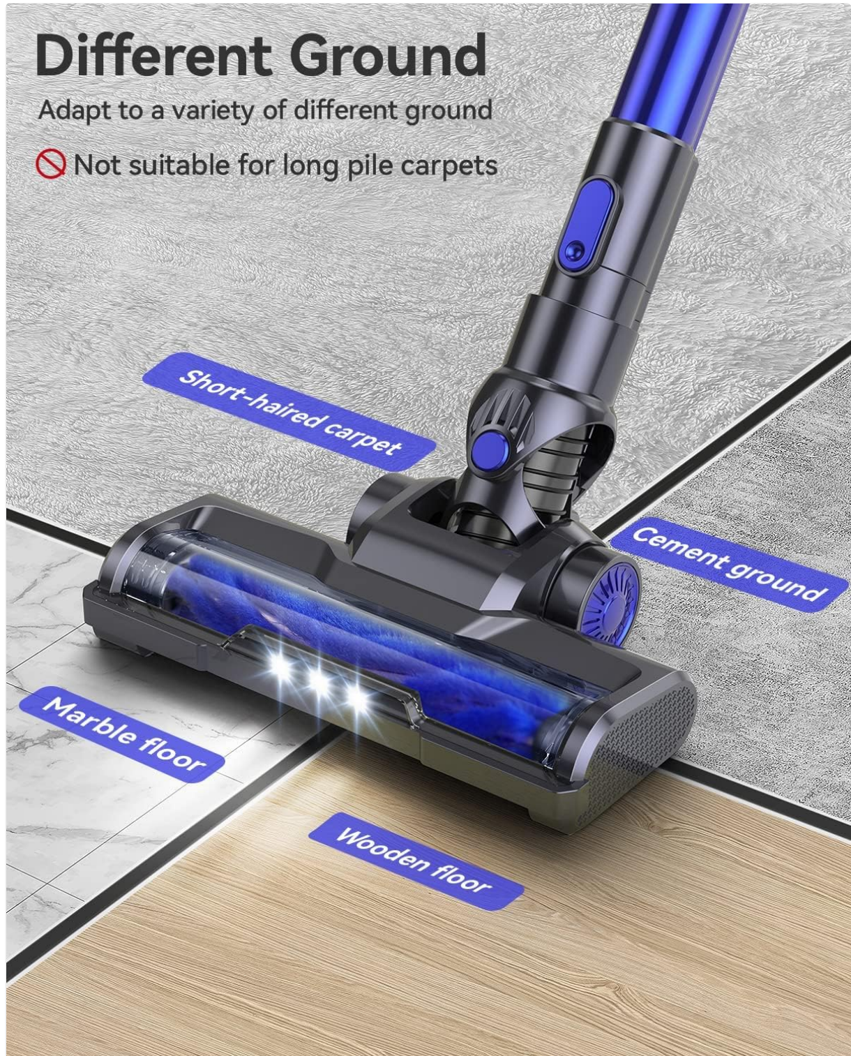
Figure 5: The EICOBOT A10 vacuum cleaner demonstrating its adaptability to different floor surfaces, including short-haired carpet, cement, marble, and wooden floors. It is important to note that it is not suitable for long-pile carpets.