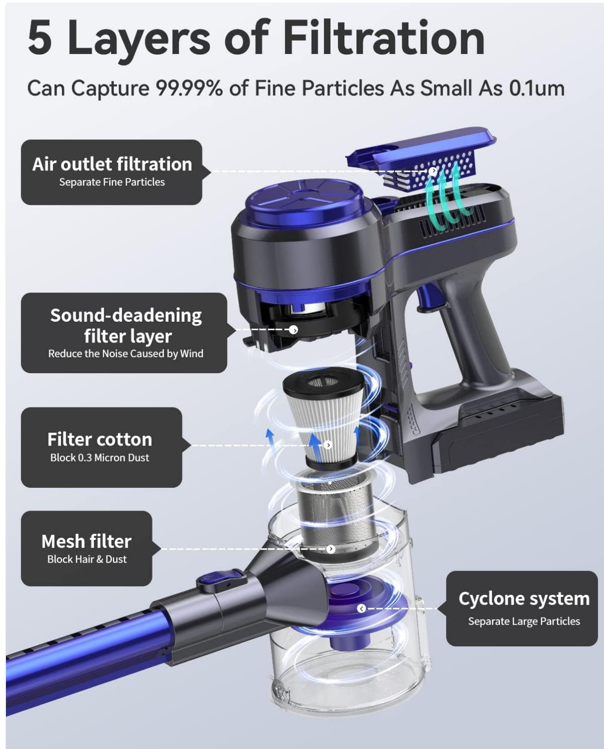
Figure 7: A detailed diagram illustrating the EICOBOT A10's 5-layer filtration system, which includes a cyclone system for