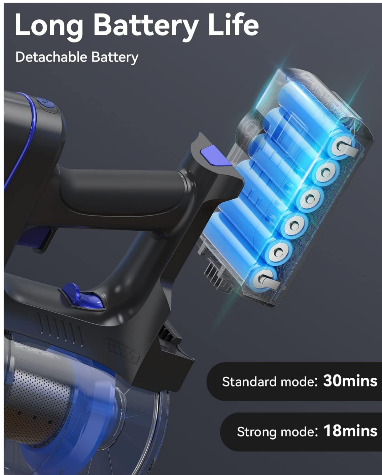
Figure 3: The EICOBOT A10's detachable battery pack, highlighting its internal structure and indicating approximate runtimes: 30 minutes in Standard mode and 18 minutes in Strong mode.