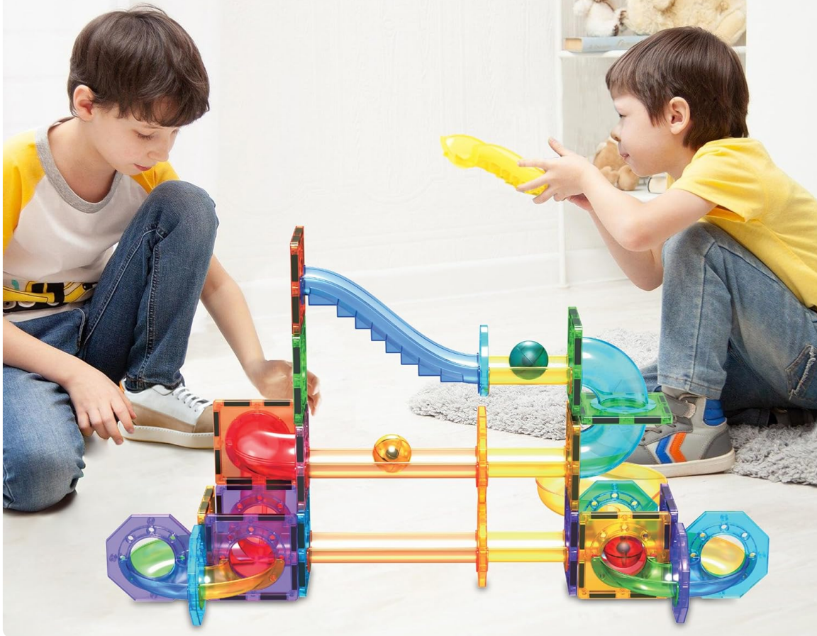
Figure 4: Children engaging with a completed PicassoTiles Marble Run structure.

Your browser does not support the video tag. Please update your browser to view this content.