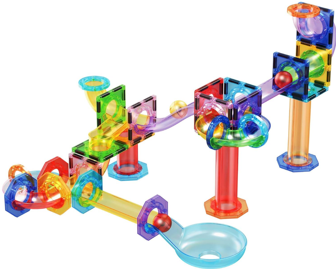
Figure 1: PicassoTiles PTG60 Magnetic Marble Run Set packaging.