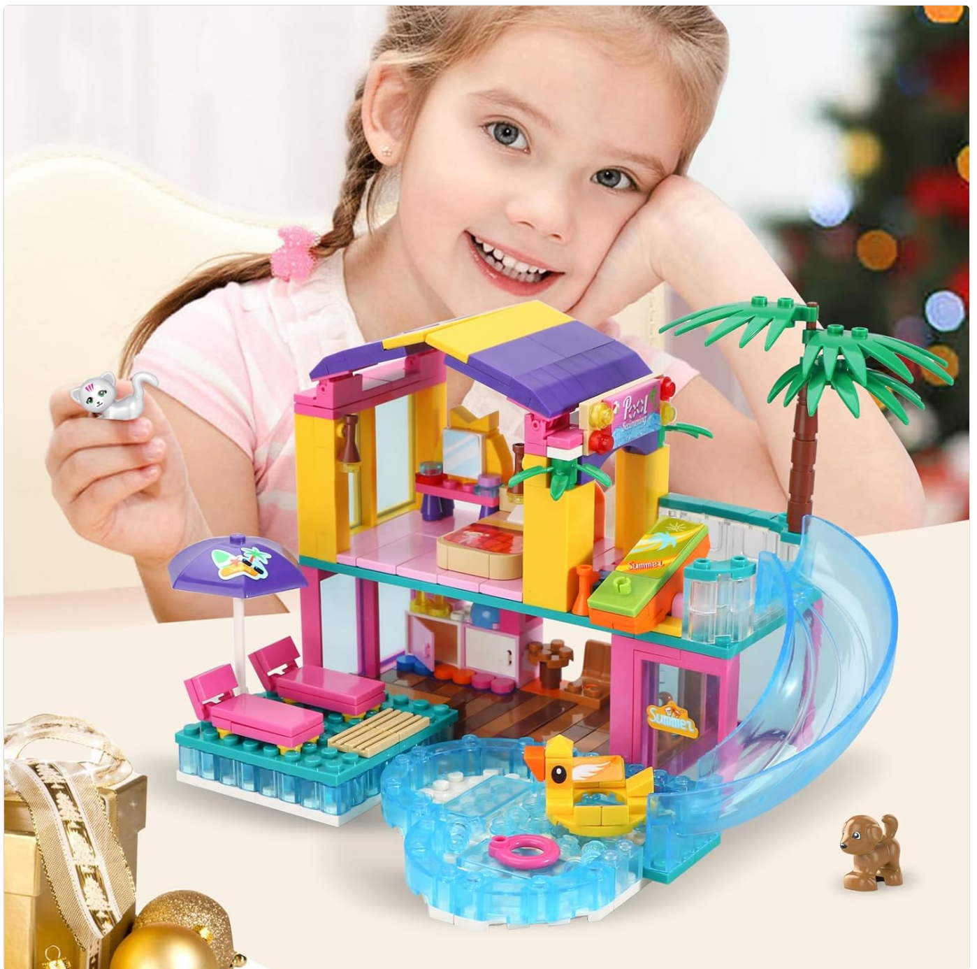
Image: A child enjoying playtime with the completed beach house set.