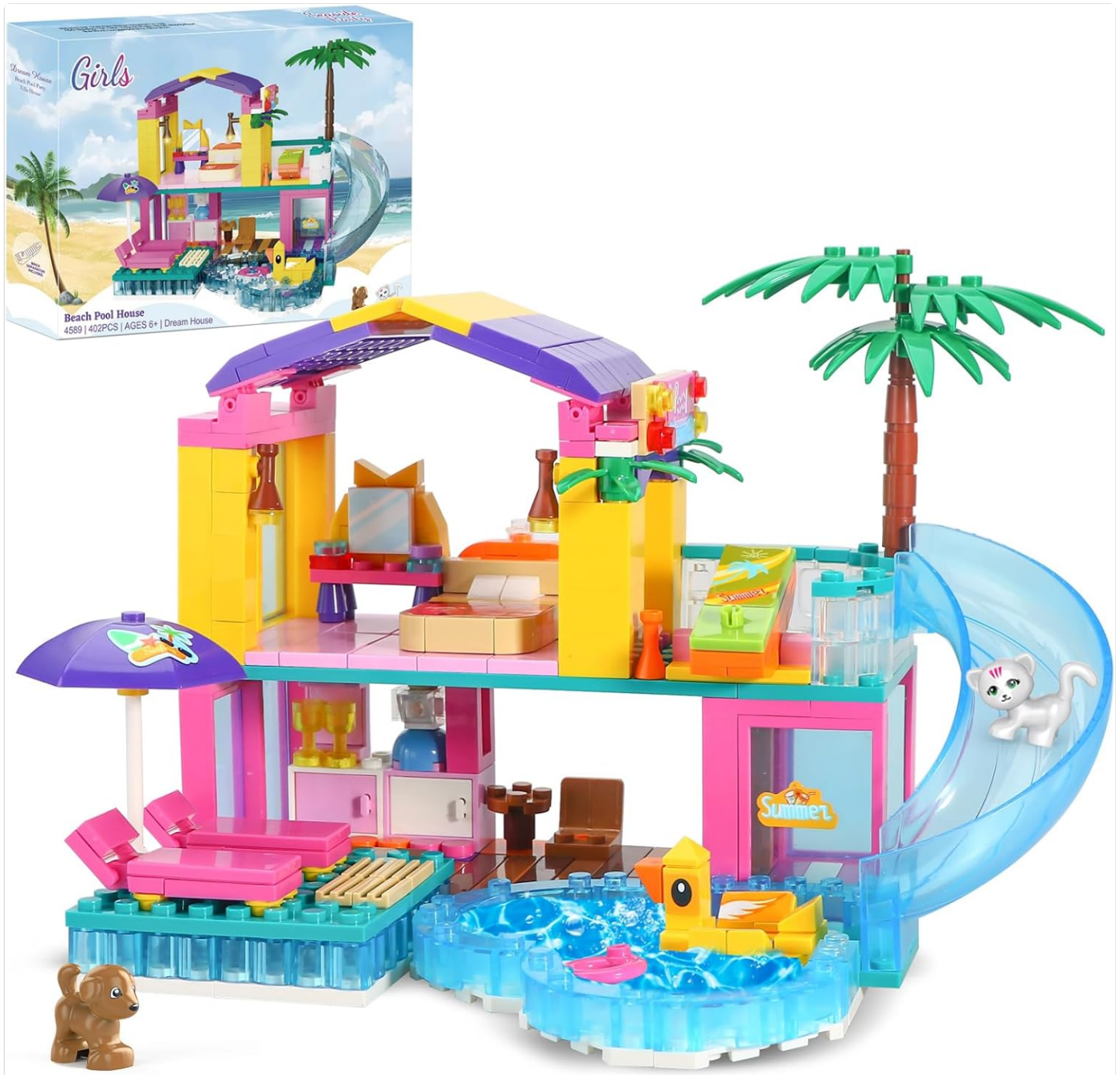
Image: The completed Beach House model, showcasing its two stories, pool, and slide.