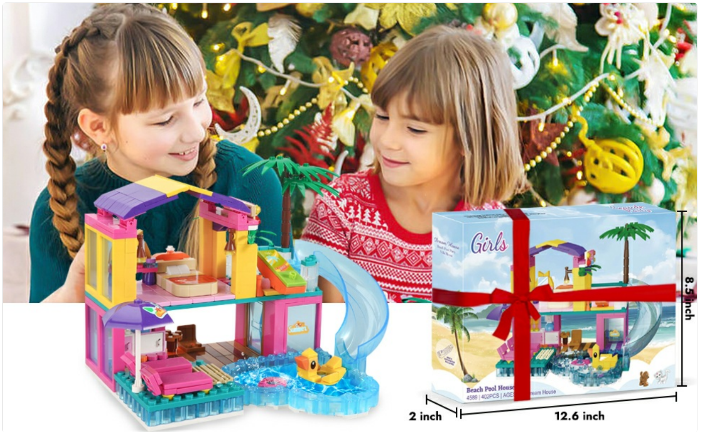
Image: The product packaging with its dimensions, alongside the assembled beach house.