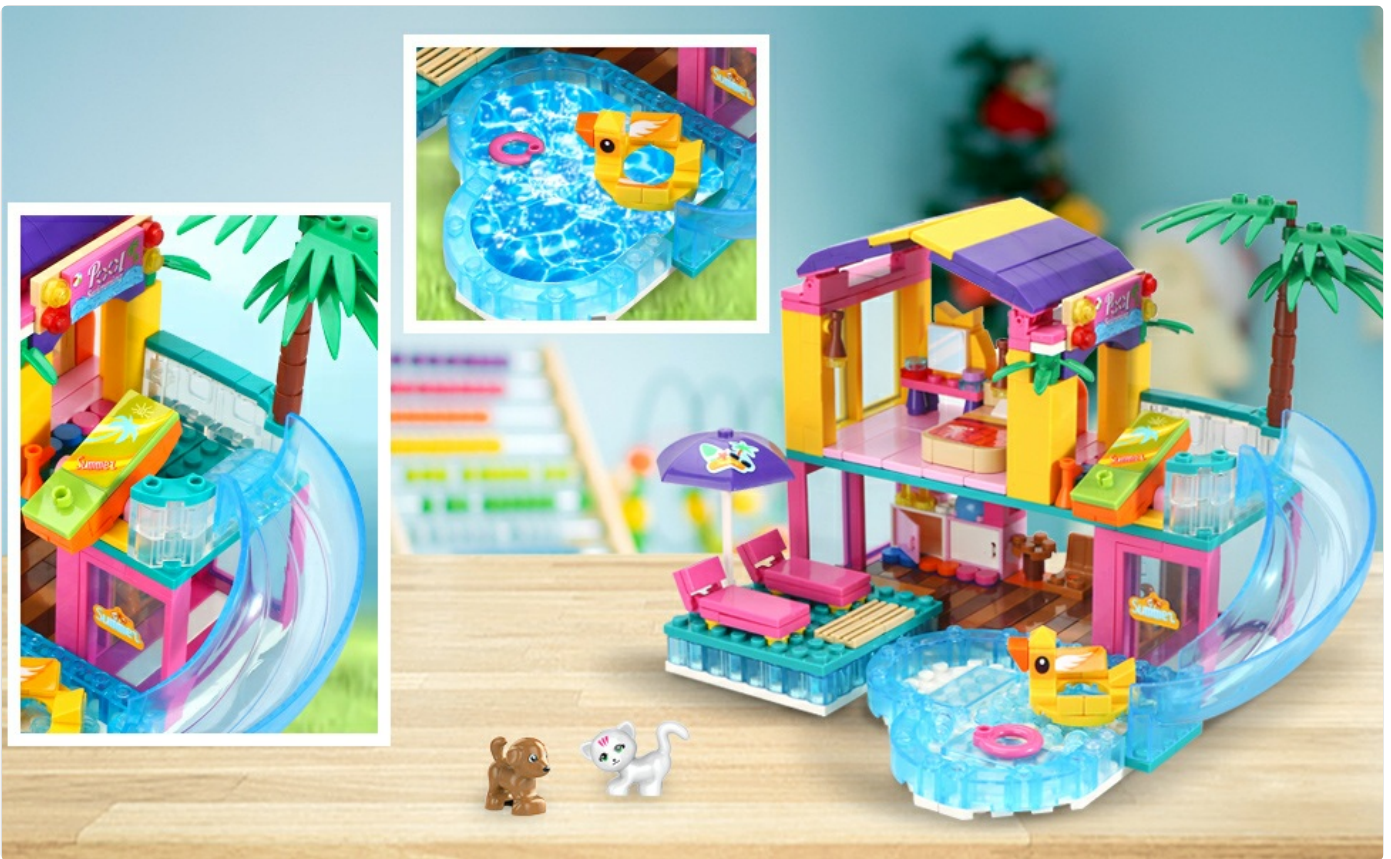
Image: The beach house set featuring the pool, slide, and included animal figures, ready for play.