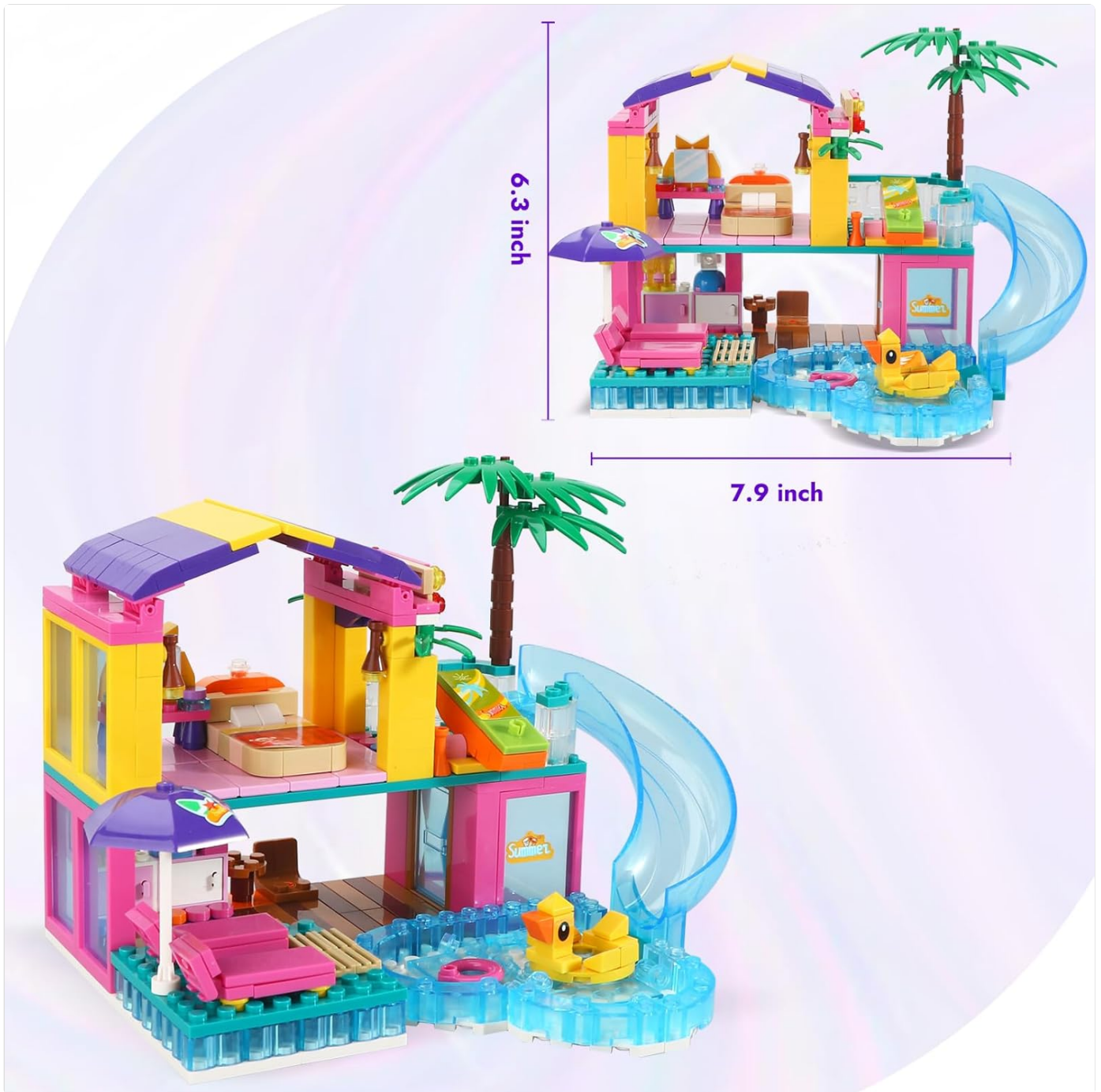
Image: Visual representation of the assembled product's dimensions.