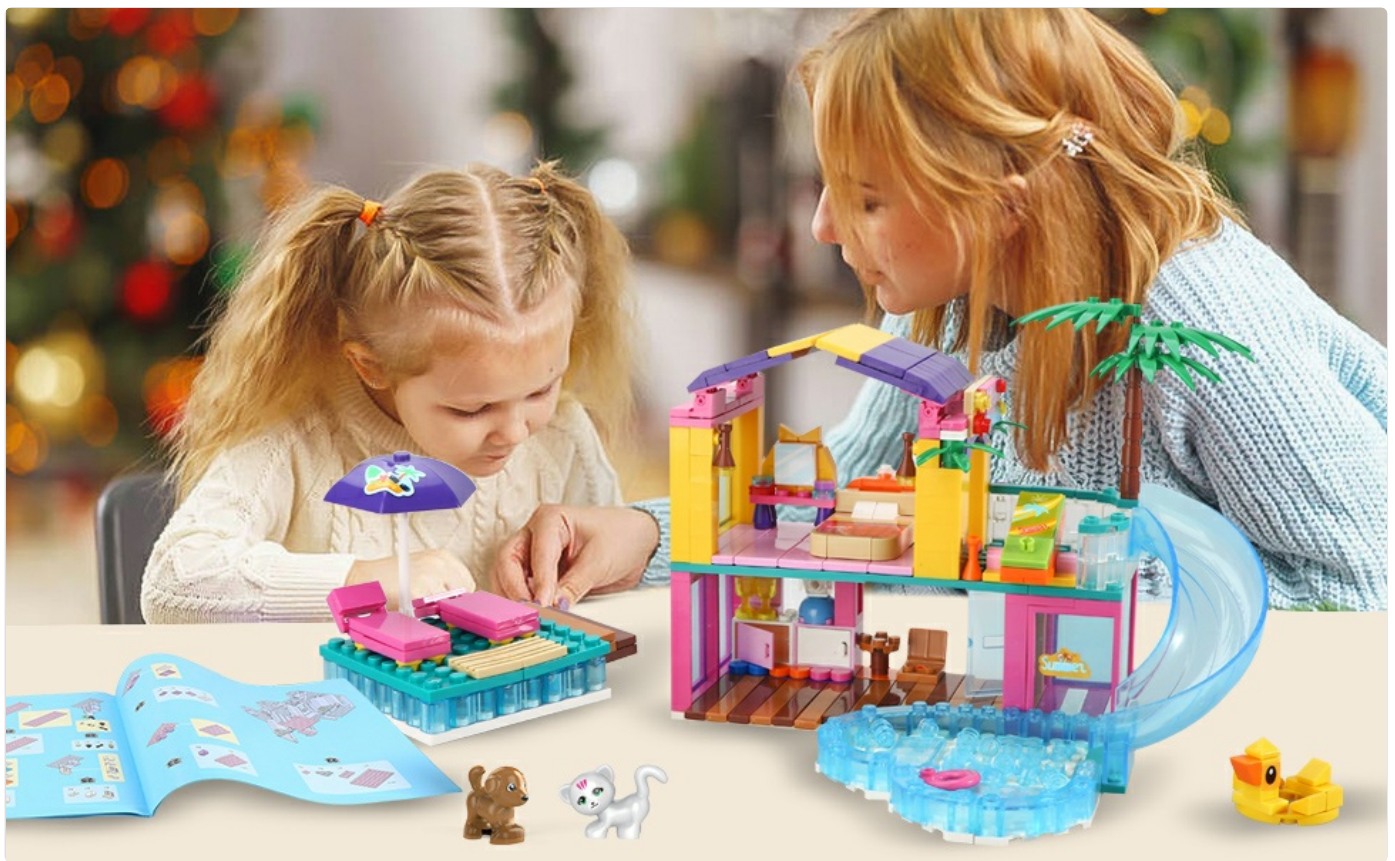
Image: A child following the instruction manual to assemble the building set.