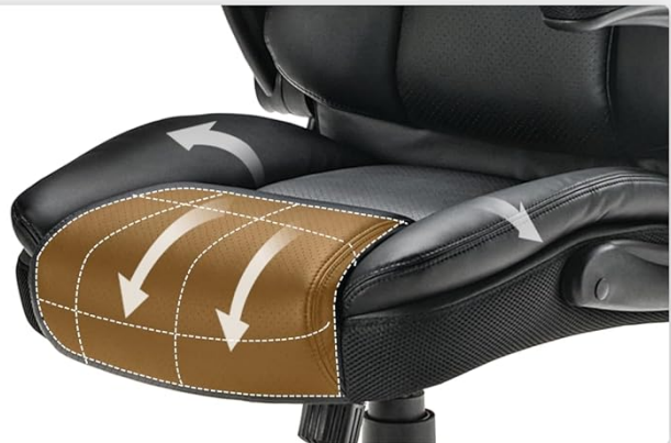
Image 6: Comfort Features (Headrest, Breathable Leather, U-Shaped Cushion)

Relax your leg, reduce the tailbone pain caused by sitting for a long time