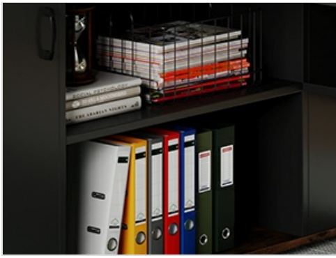
Image: A composite view highlighting the various storage compartments of the desk, including open shelves and a cabinet.

The desk features multiple storage options, including open shelves and a two-shelf cabinet. These are designed to accommodate various office supplies, files, and equipment.