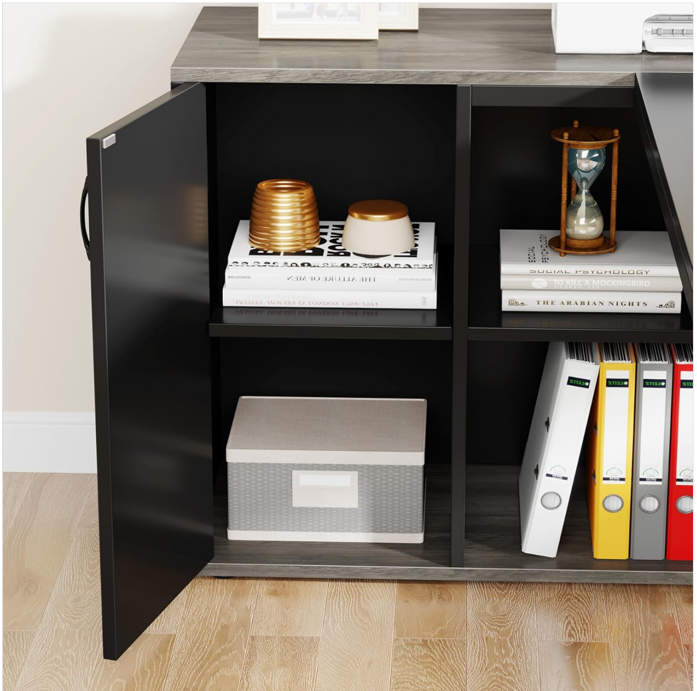
Image: The side cabinet with its door open, revealing two internal shelves suitable for binders, books, or other office items.

The integrated cabinet provides enclosed storage for items you wish to keep out of sight, with two adjustable shelves for flexible organization.