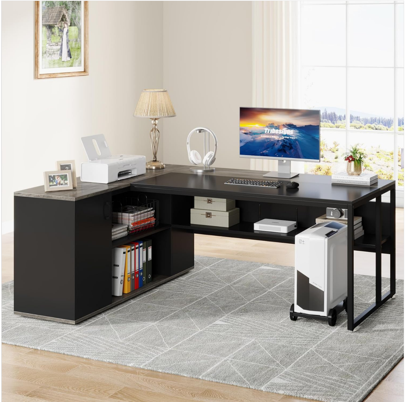
Image: A dedicated CPU stand with wheels, positioned under the main desk section, offering mobility and protection for your computer tower.

The desk features multiple storage options, including open shelves and a two-shelf cabinet. These are designed to accommodate various office supplies, files, and equipment.