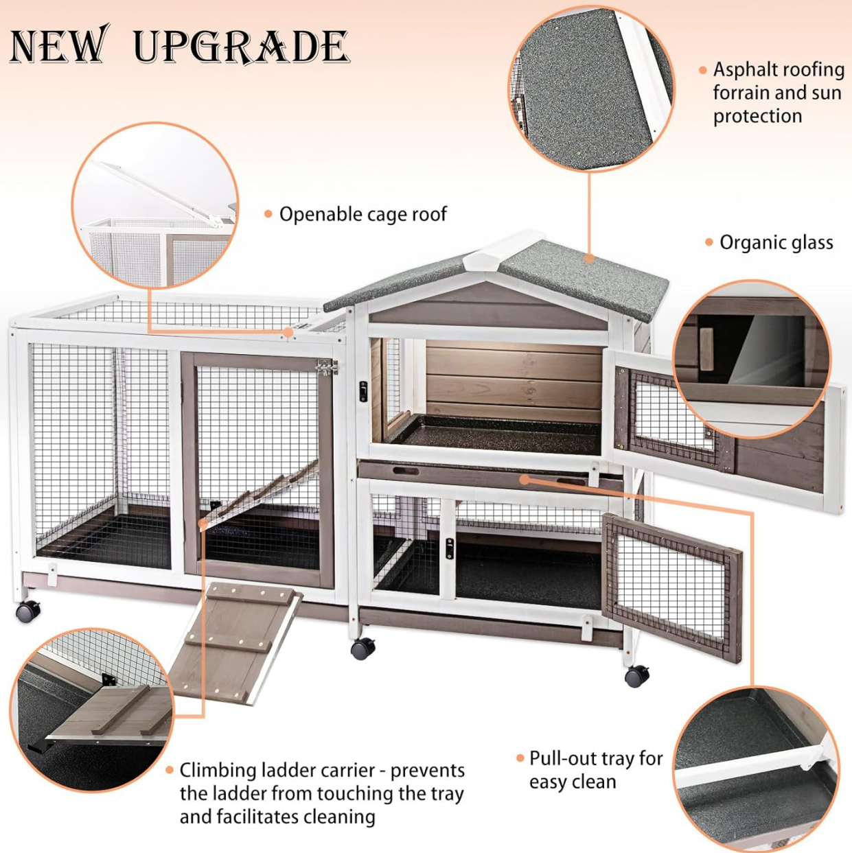
Image 4.1: Key features of the hutch, including the openable roof for access, an organic glass window for viewing pets, a climbing ramp, and a pull-out tray for cleaning.