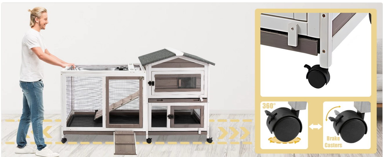
Image 4.2: The hutch equipped with 360-degree mobile brake casters, allowing for easy movement and secure positioning.