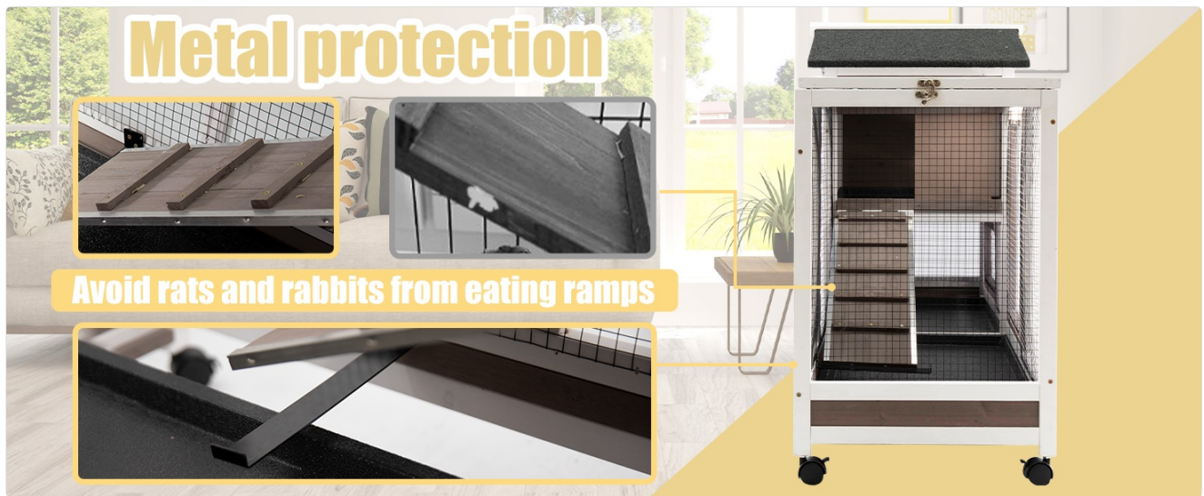
Image 6.2: Metal protection integrated into the hutch's design helps prevent damage to ramps from pet chewing.