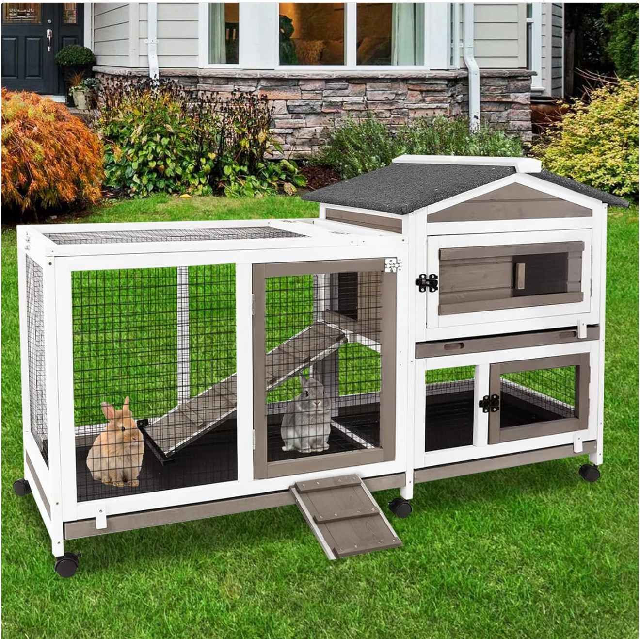
Image 1.1: The PetsCosset 57" L Rabbit Hutch, featuring a two-story design with a spacious run area and a sheltered sleeping compartment, suitable for outdoor placement.