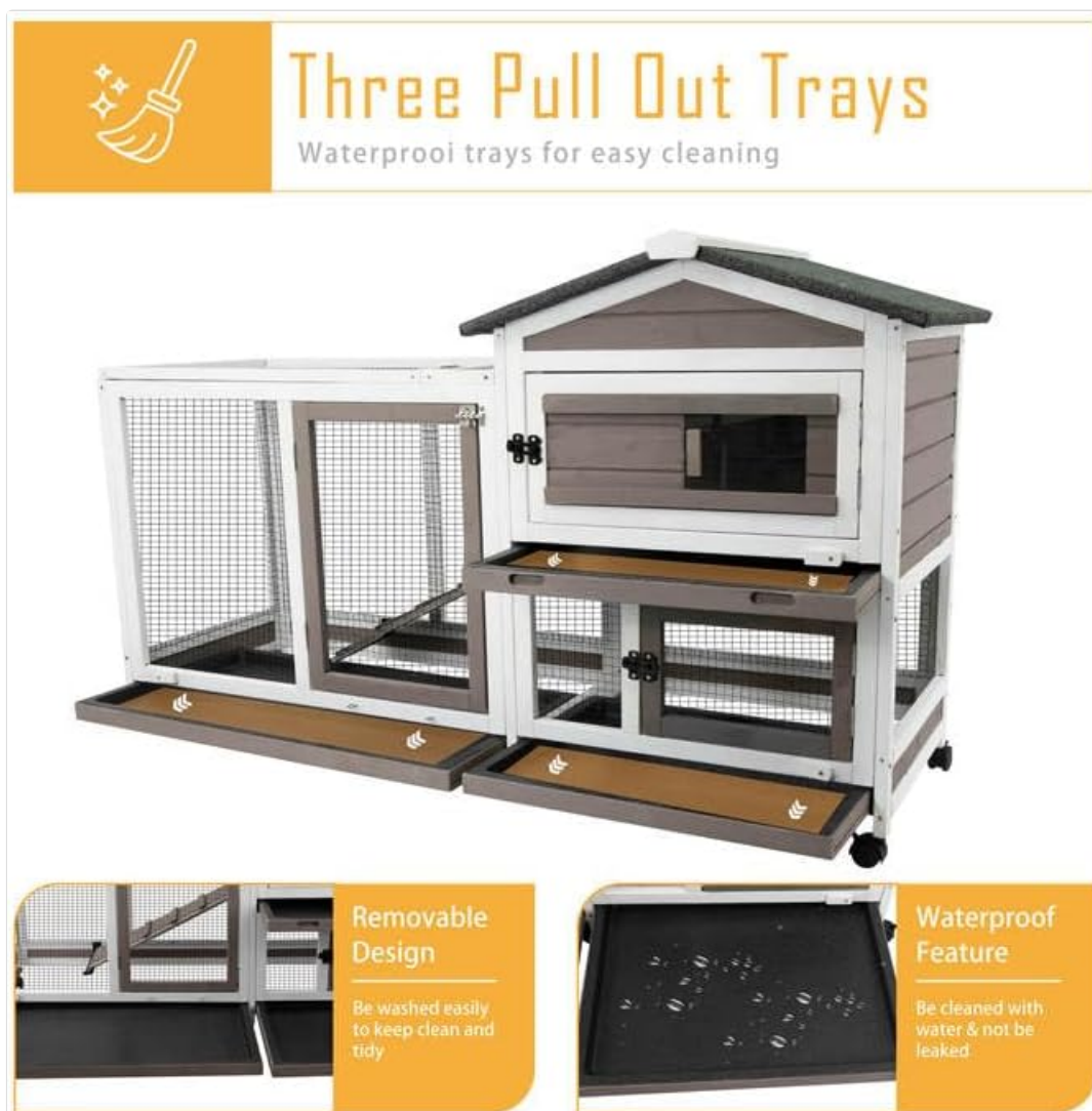
Image 6.1: The hutch features three waterproof pull-out trays, simplifying the cleaning process and maintaining a hygienic environment.