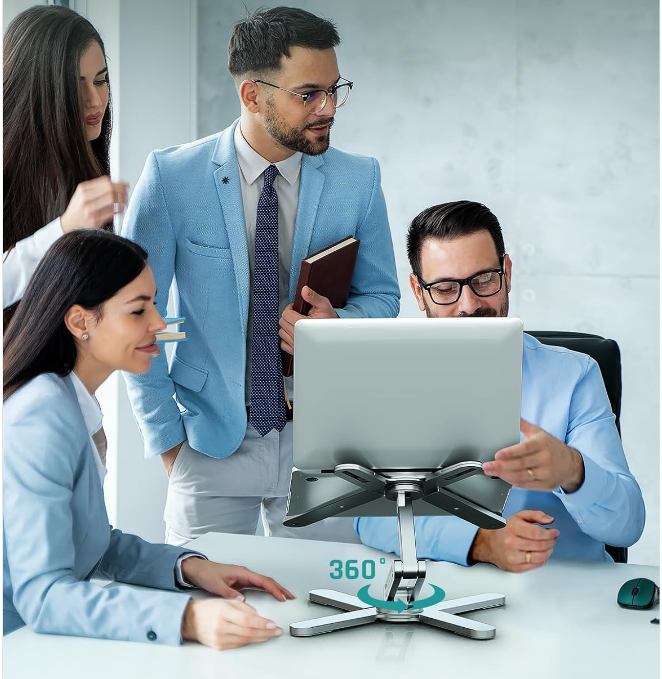
Figure 4: 360-degree swivel functionality.