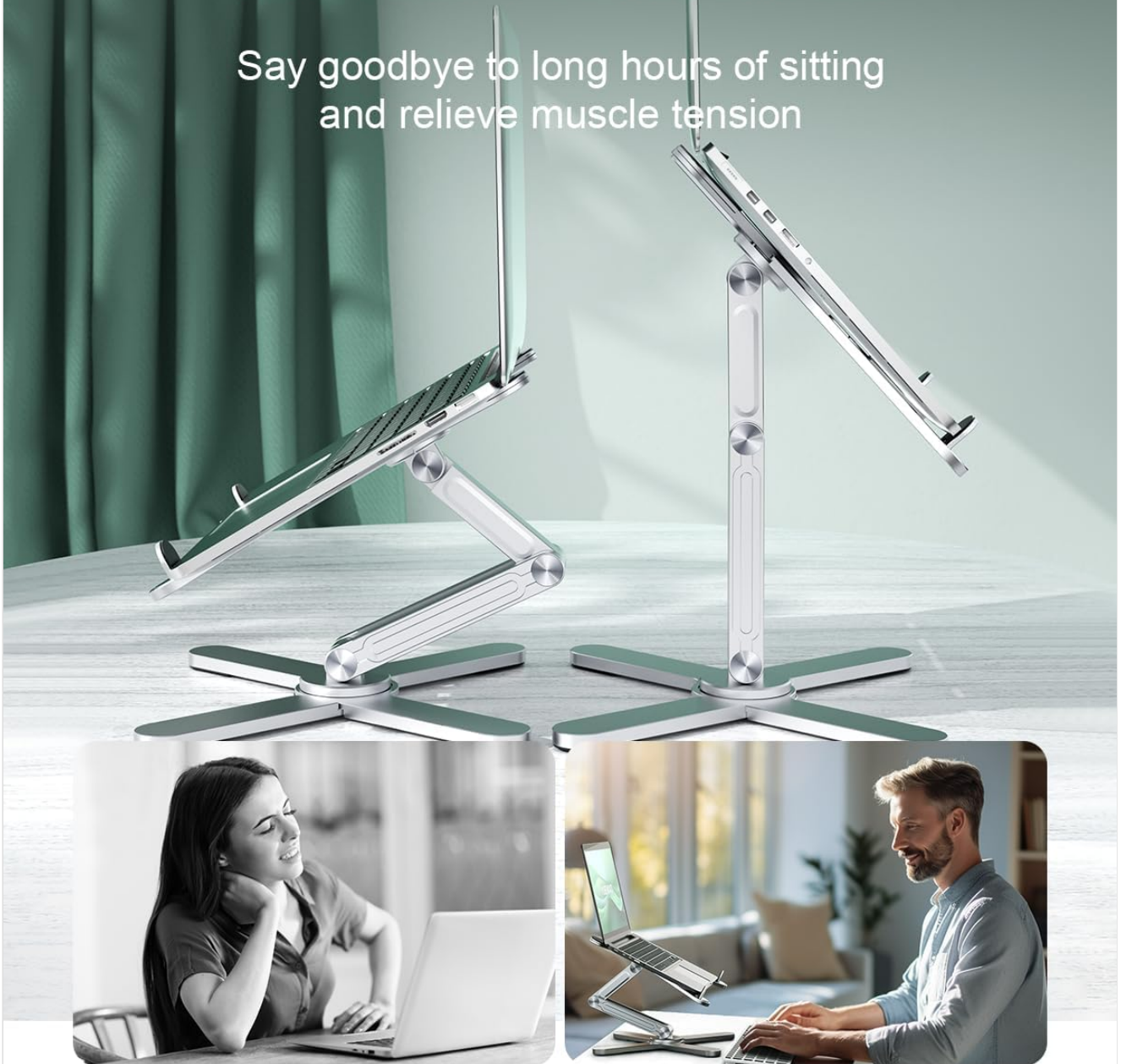
Figure 3: Adjustable height for ergonomic comfort.

Say goodbye to long hours of sitting and relieve muscle tension