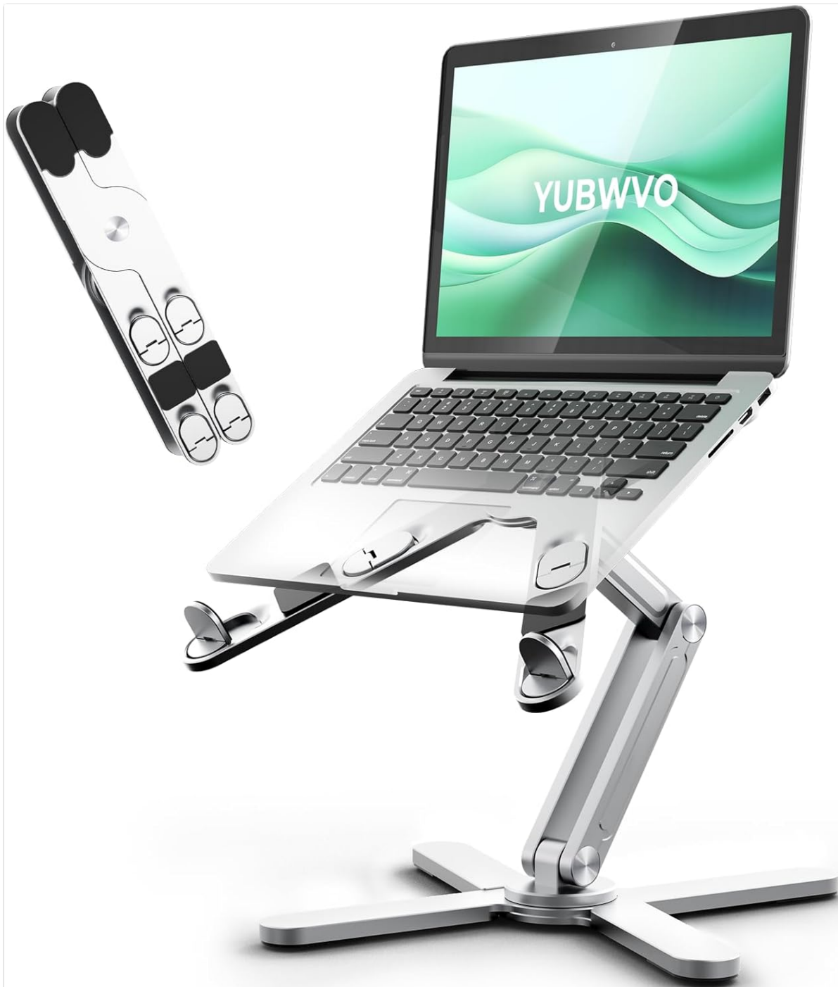
Figure 1: YUBWVO W50 Laptop Stand with a laptop.